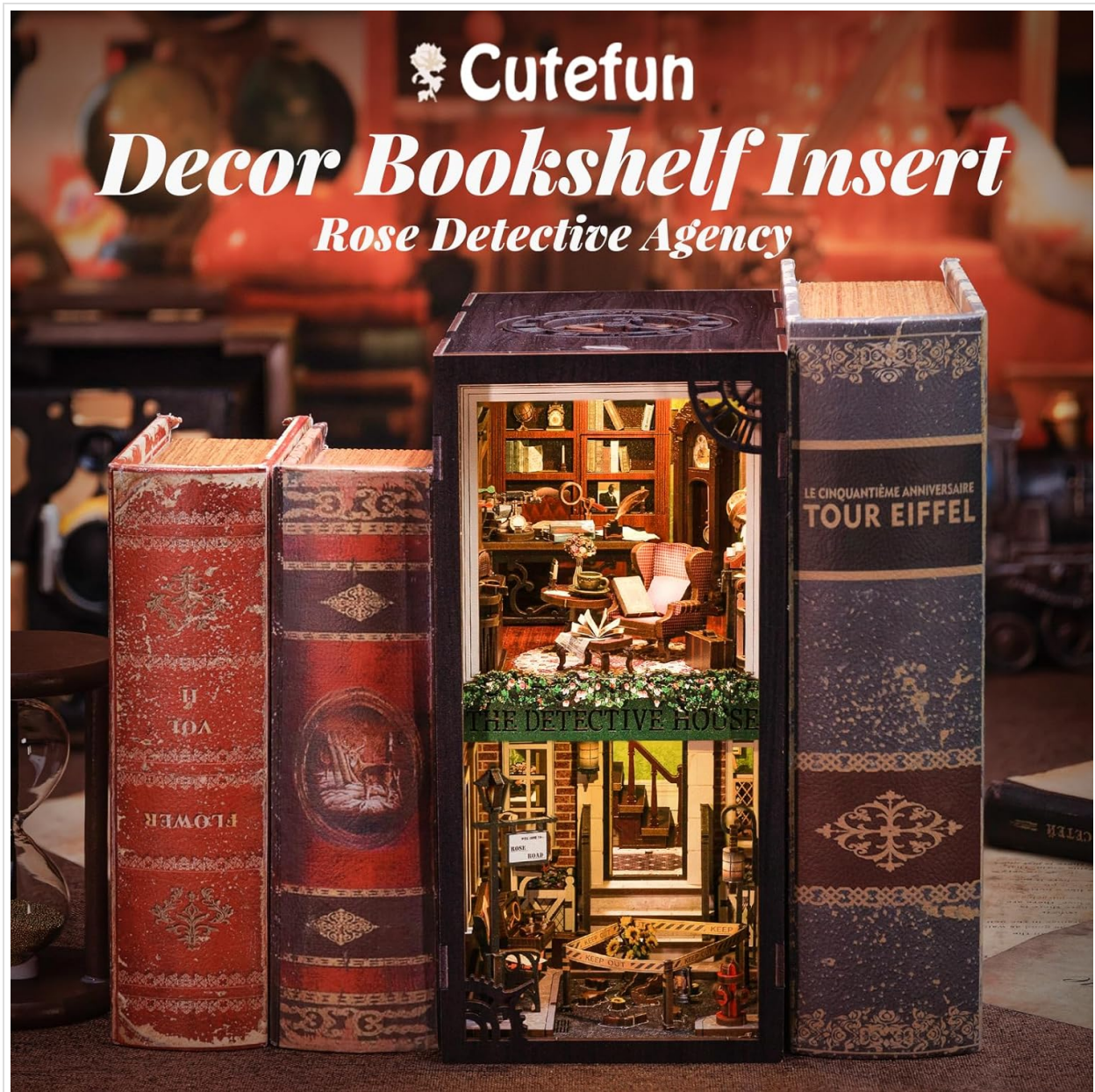
Image 1.2: The assembled Book Nook Kit integrated into a bookshelf, demonstrating its intended use as a decorative insert among books.