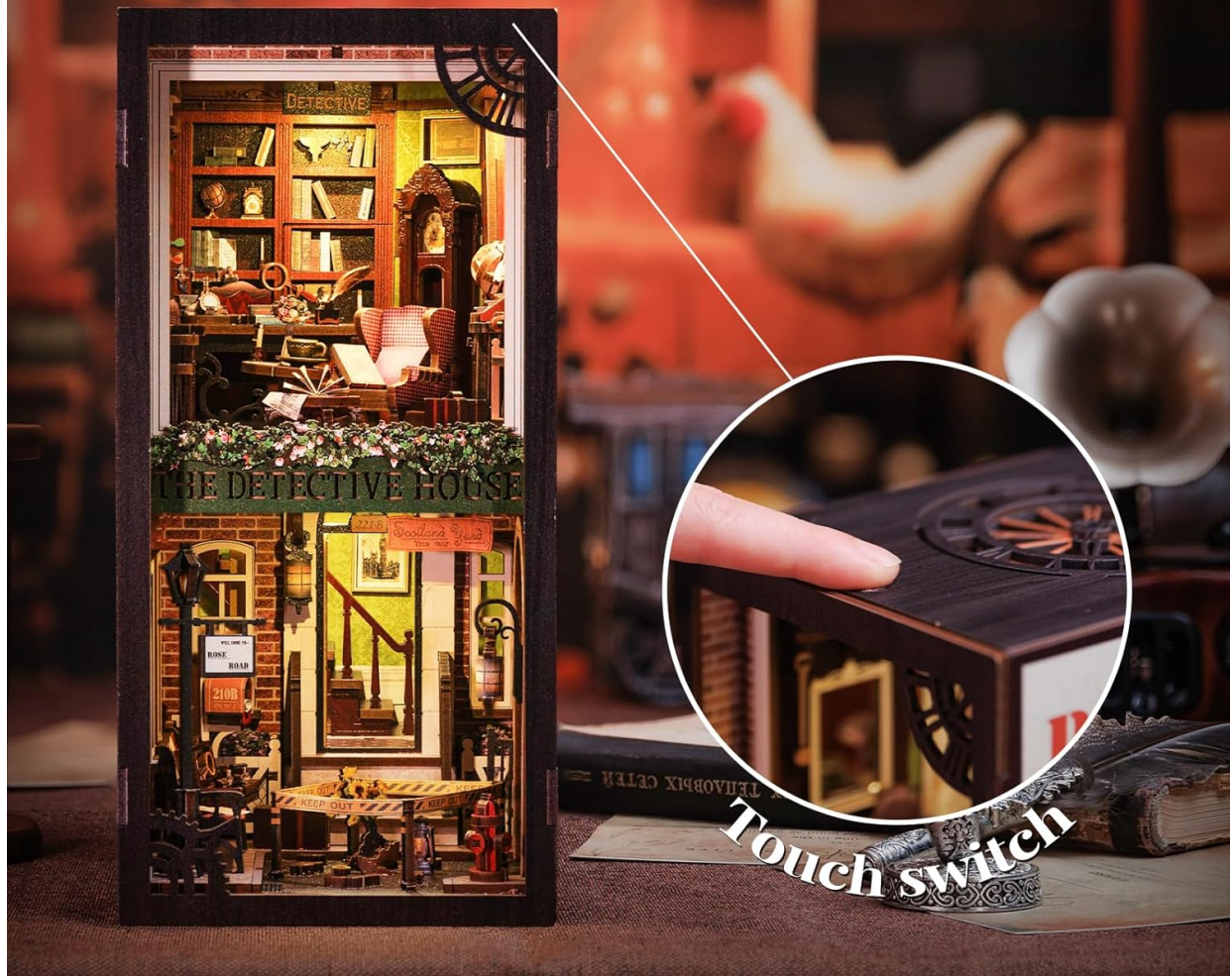
Image 5.1: A hand demonstrating how to use the touch-sensitive light switch located on the top surface of the book nook.

Touch to turn on the light 💡 light up every moment of life