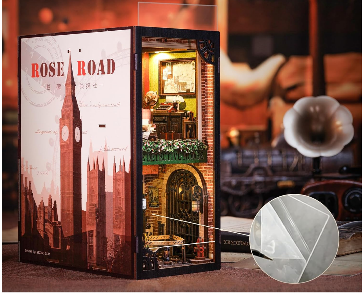
Image 4.2: The book nook with its clear dust cover being installed, highlighting the protective feature and the instruction to remove protective films.

Upgrade to add a dust sheet Please remove the protective sides before use film on both