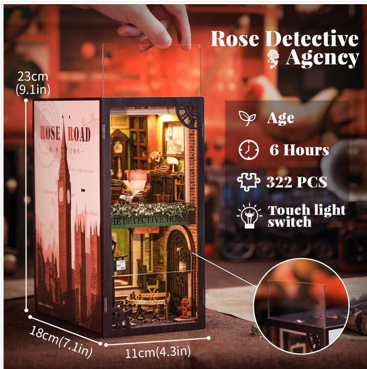
Image 8.1: Visual representation of the product dimensions: 23cm (9.1in) height, 18cm (7.1in) length, and 11cm (4.3in) width.