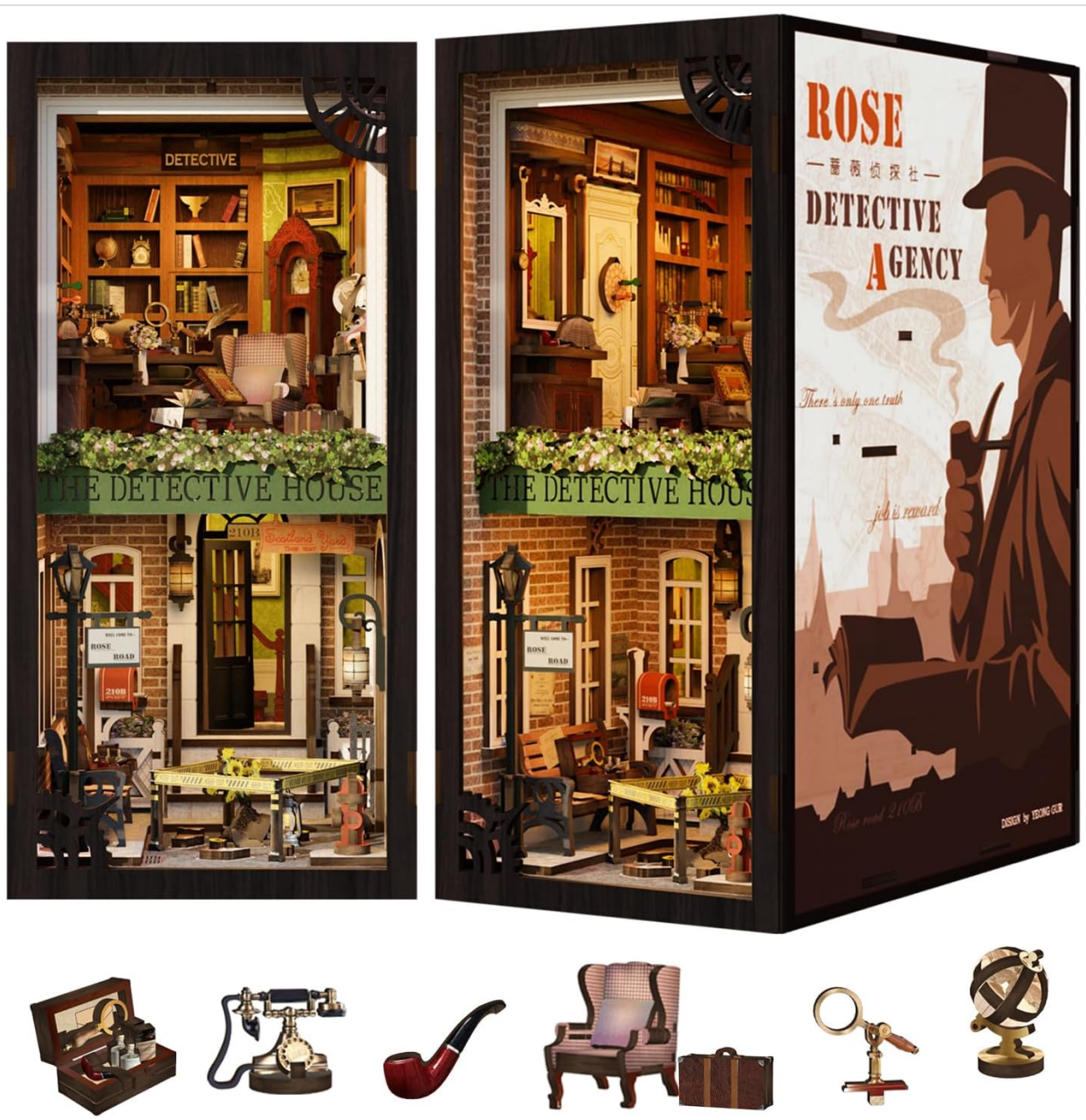
Image 1.1: The fully assembled Cutefun SZ02B DIY Book Nook Kit, showcasing the detailed Rose Detective Agency scene from multiple angles, along with miniature accessory pieces.