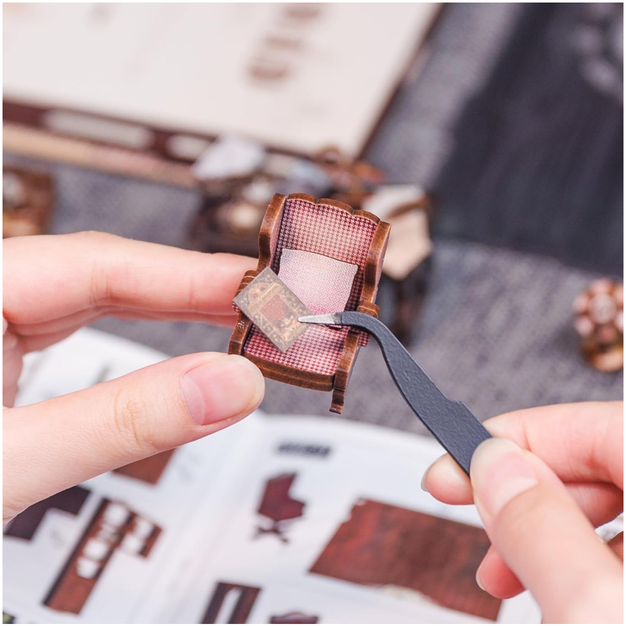
Image 4.1: Demonstrates the use of tweezers for precise placement of small miniature components, such as a book on a chair.