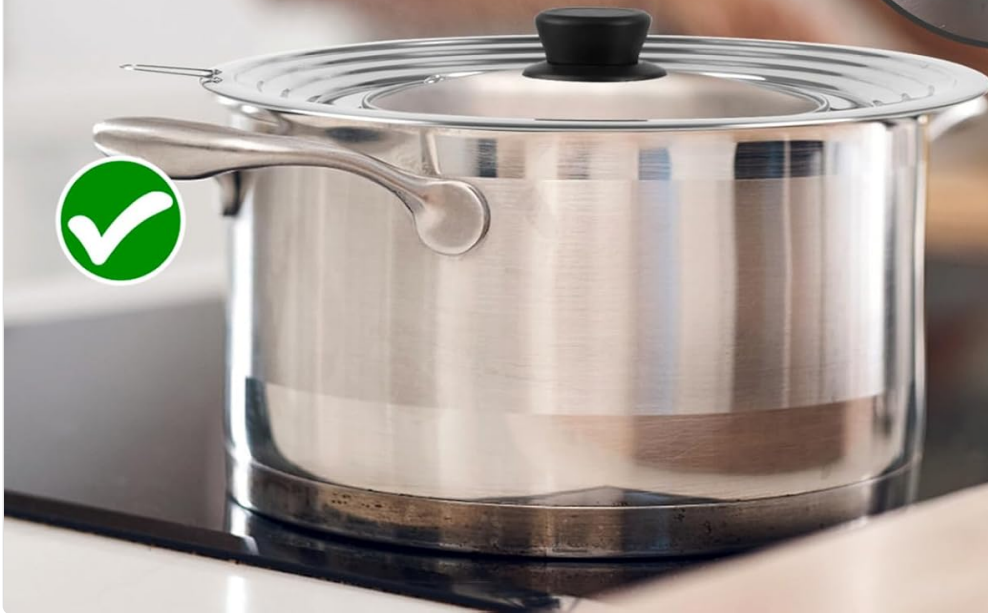
Image 3.2: Illustration showing the lid's compatibility with pans featuring low-angle handles, and incompatibility with cookware that has raised handles.