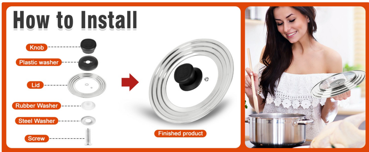
Image 2.1: Step-by-step diagram for attaching the knob to the universal pan lid.

Ensure all components are securely fastened before first use.