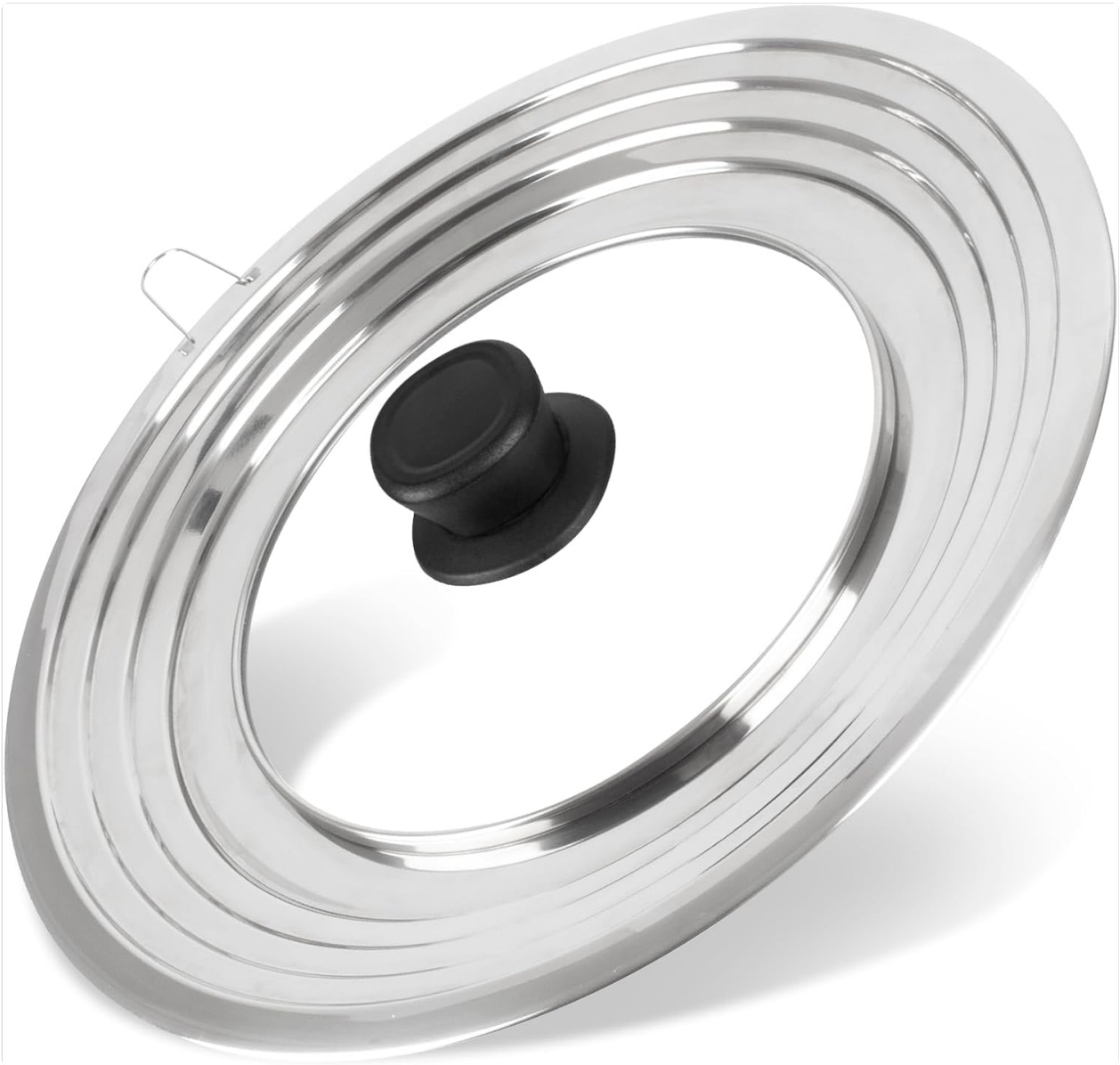
Image 1.1: The Komokeru Universal Pan Lid, showcasing its stainless steel rim and clear glass center.