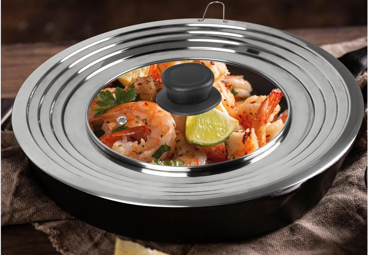
Image 4.1: The universal lid highlighting its premium quality, dishwasher-safe, and rust-resistant features.