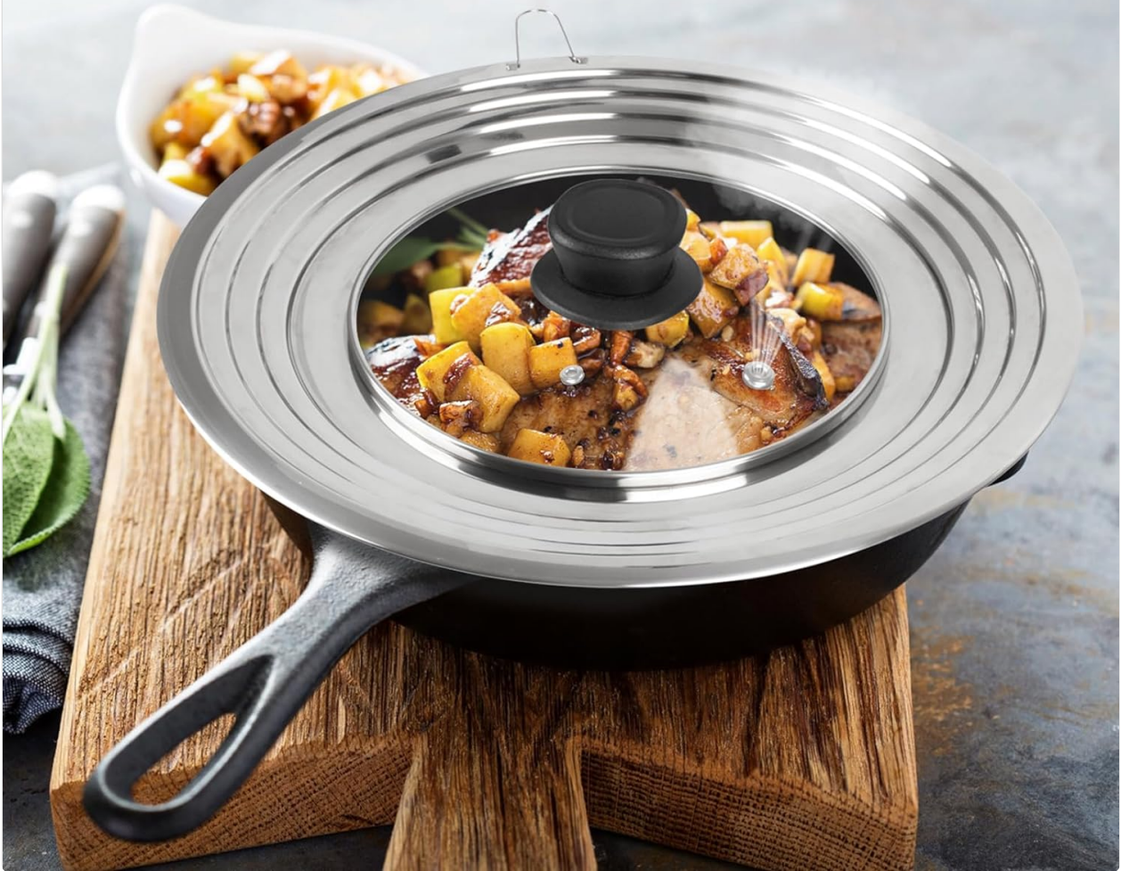
Image 3.1: The universal lid placed on a skillet, demonstrating the clear glass top for viewing food.

Perfect for watching your food as you cook