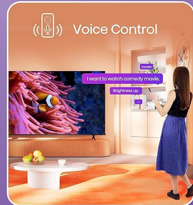
Image: Visual representation of the Hisense 58A6K TV's key features, including 4K resolution, Pixel Tuning, Game Mode Plus, Dolby Vision, Direct Full Array, and Voice Control.