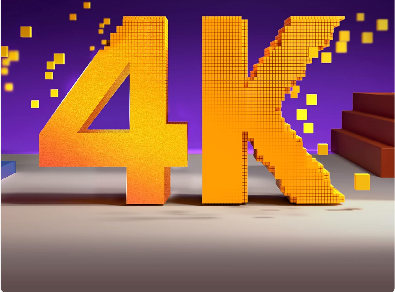
Image: A large, stylized '4K' graphic, representing the exceptionally detailed 4K quality available for all your favorite content on the Hisense TV.