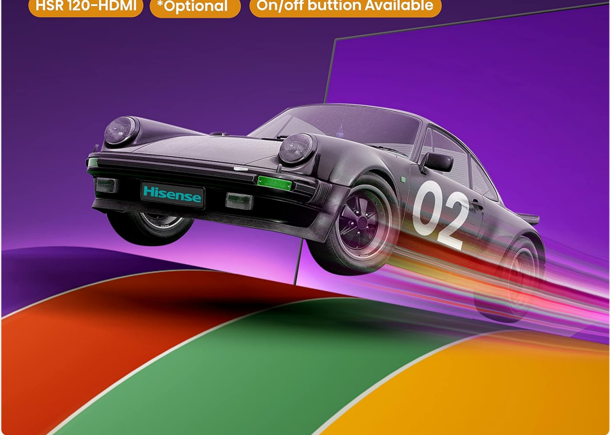
Image: Graphic illustrating MEMC (Motion Estimation, Motion Compensation) technology, which provides a smoother picture with no blur, particularly beneficial for fast-moving scenes.