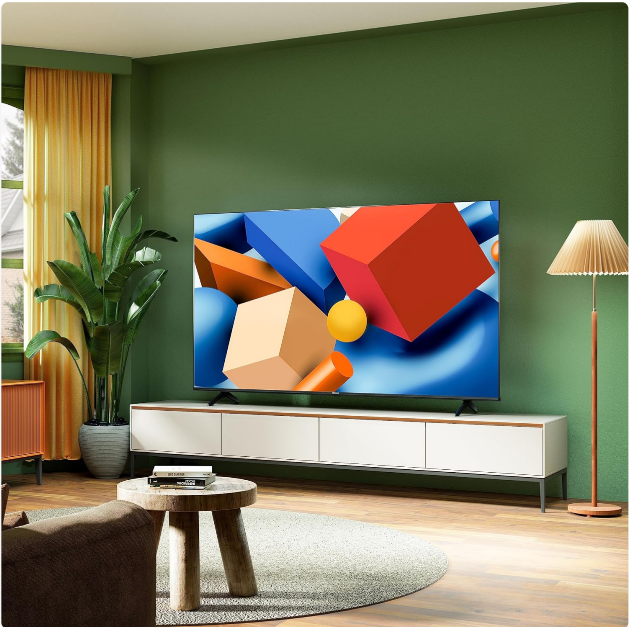
Image: The Hisense 58A6K TV displayed in a modern living room, showcasing its sleek design and large screen, ready for viewing.

After connecting all necessary cables, plug the TV into a power outlet. Press the power button on the remote control or on the TV itself. Follow the on-screen instructions for the initial setup, including language selection, network connection (Wi-Fi or Ethernet), and channel scanning.