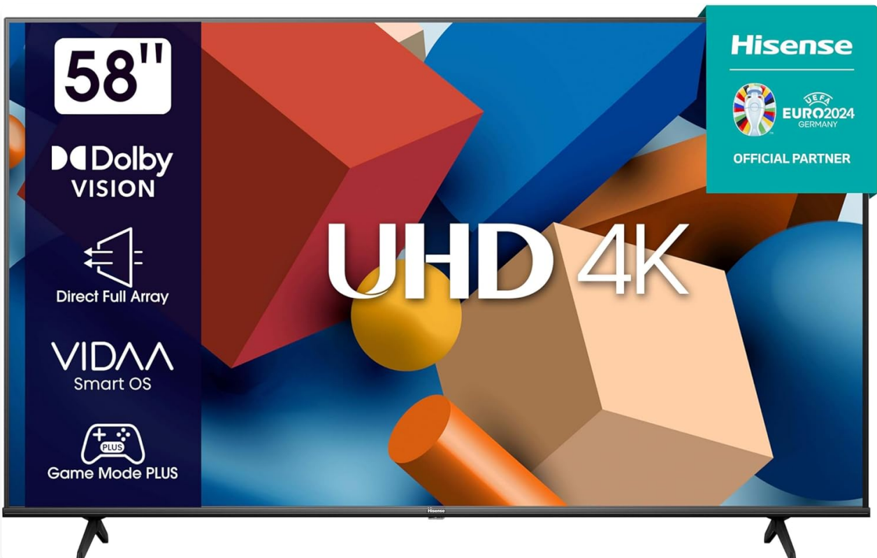
Image: Front view of the Hisense 58A6K 58-inch 4K Smart TV, highlighting its 58-inch screen, Dolby Vision, UHD 4K, VIDAA Smart OS, Game Mode PLUS, and Hisense EURO2024 Germany Official Partner logo.

This user manual provides detailed instructions for the installation, operation, and maintenance of your Hisense 58A6K 58-inch LED 4K Ultra HD Smart TV. Please read this manual thoroughly before using your TV and retain it for future reference. This television offers a stunning 4K Ultra HD display, smart features powered by VIDAA U6, and advanced technologies for an immersive viewing experience.