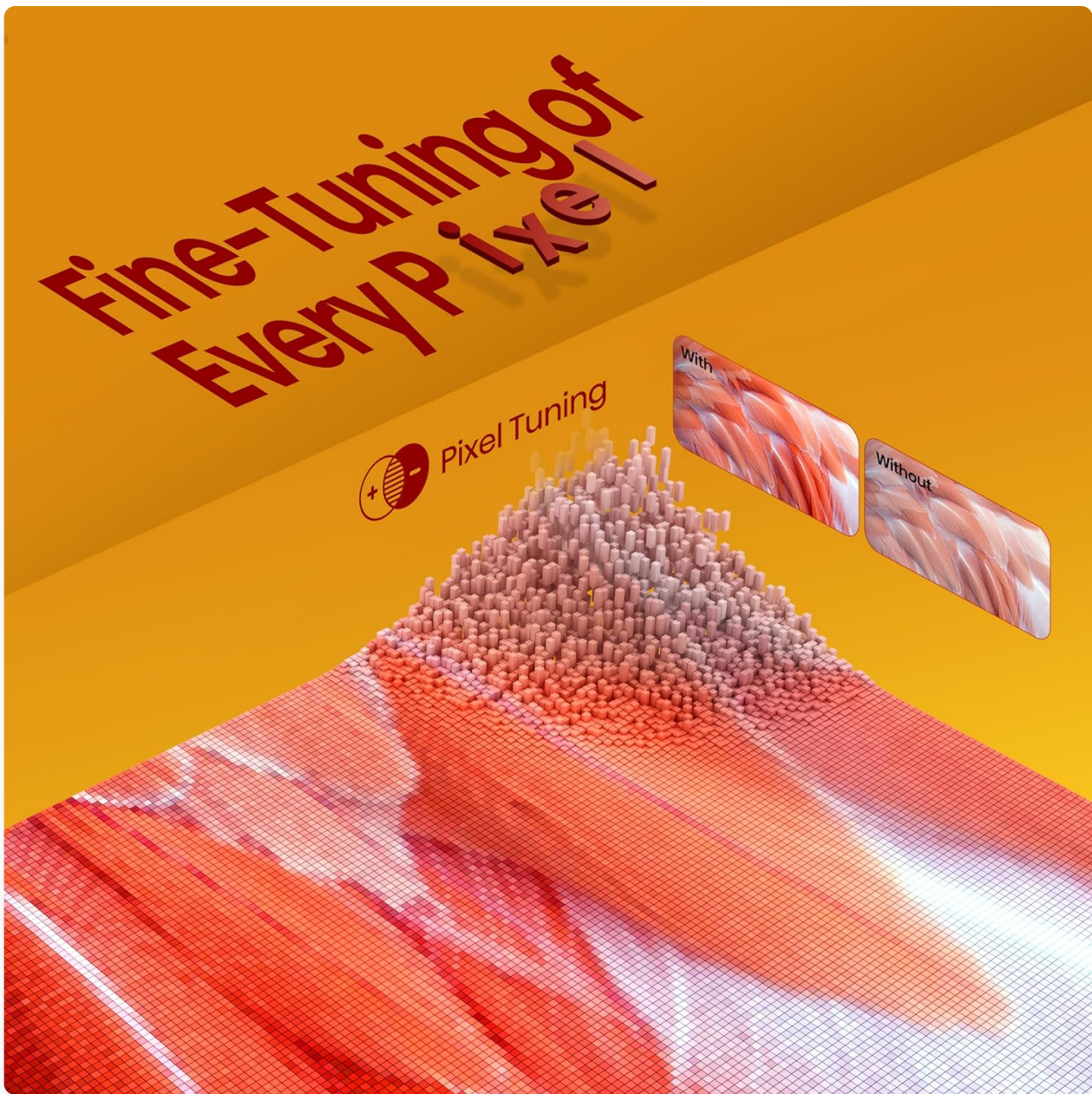
Image: A visual concept demonstrating 'Fine-Tuning of Every Pixel' with Pixel Tuning, showing how image quality is improved by optimizing individual pixels.