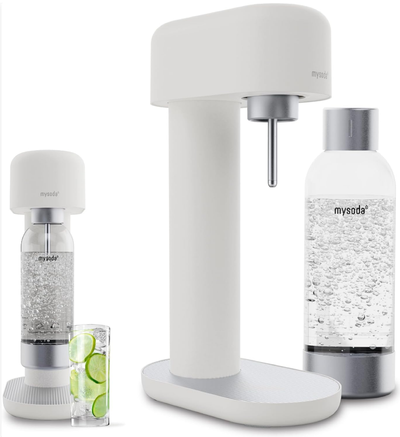
Image: The Mysoda Ruby 2 Sparkling Water Maker, showcasing its sleek design and included water bottle, ready for use.