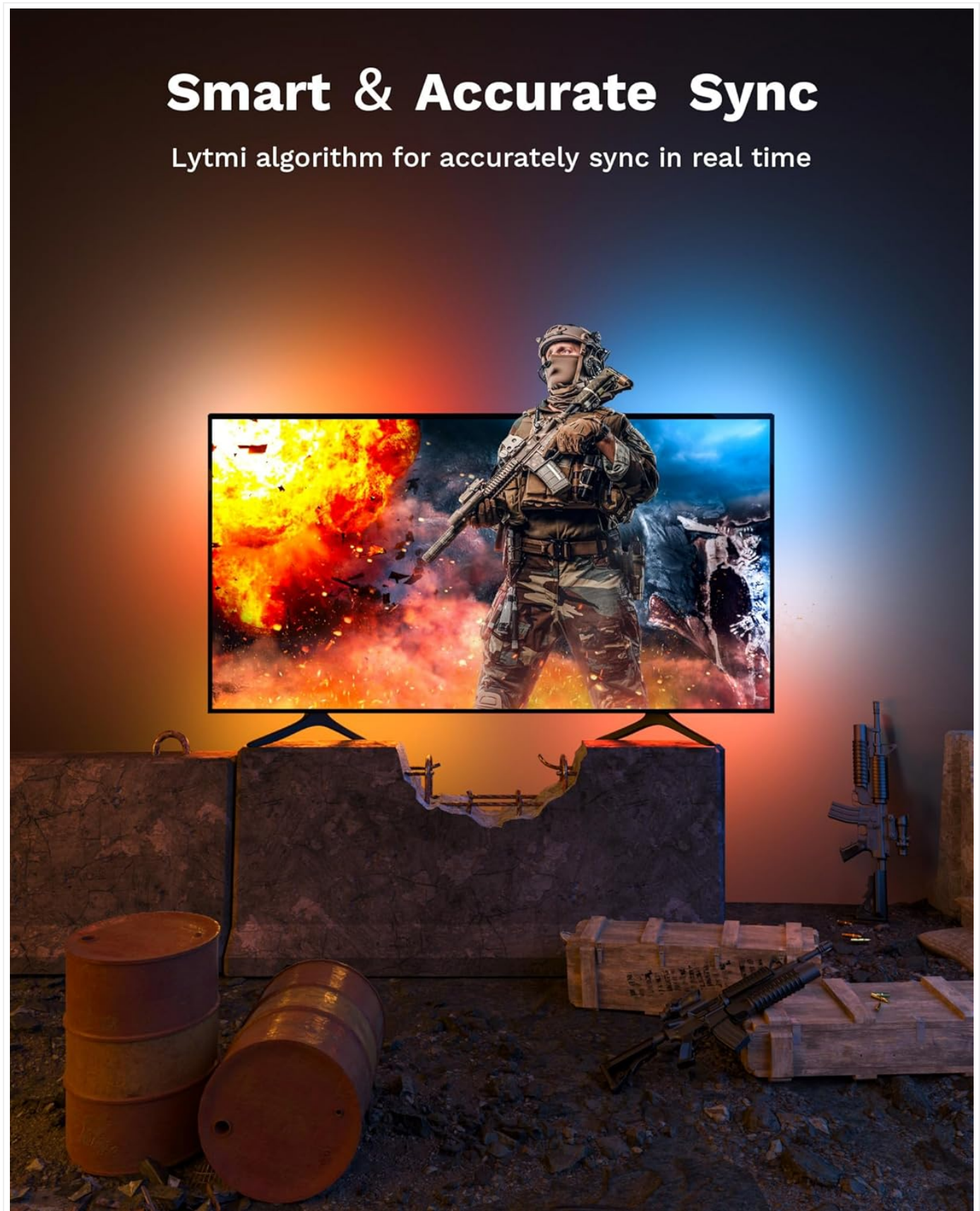
Figure 5: The system provides smart and accurate real-time color synchronization.

The Lytmi Fantasy 3 uses an advanced algorithm to accurately synchronize the backlight colors with the content displayed on your TV screen. This provides an immersive viewing experience, especially for high-performance gaming and fast-paced movies.