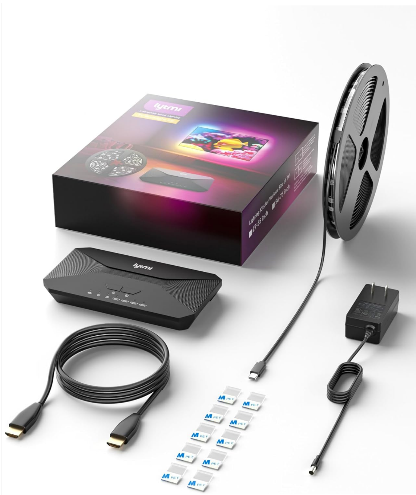
Figure 2: Included components: Sync Box, LED strip, HDMI cables, power adapter, and mounting accessories.