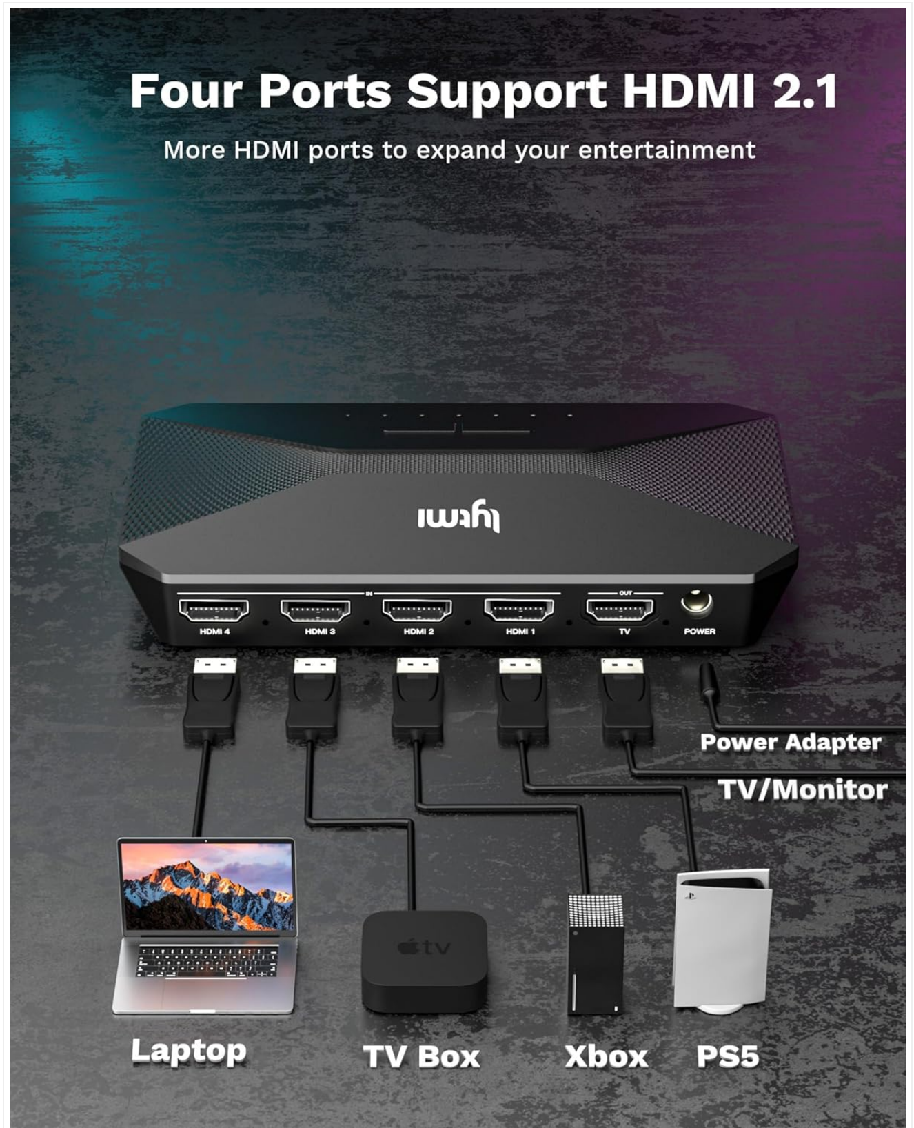
Figure 4: Connecting various HDMI devices to the Sync Box.

More HDMI ports to expand your entertainment