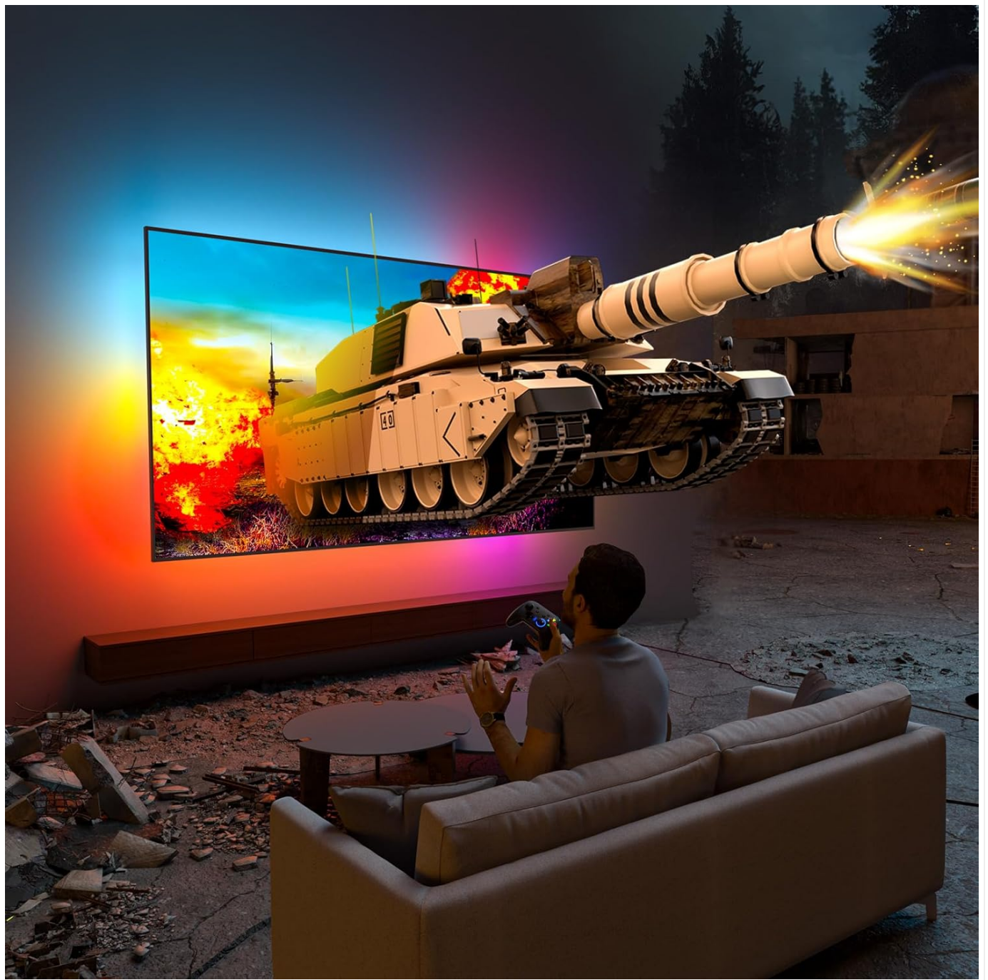
Figure 1: Lytmi Fantasy 3 TV Backlight Kit enhancing a gaming experience.