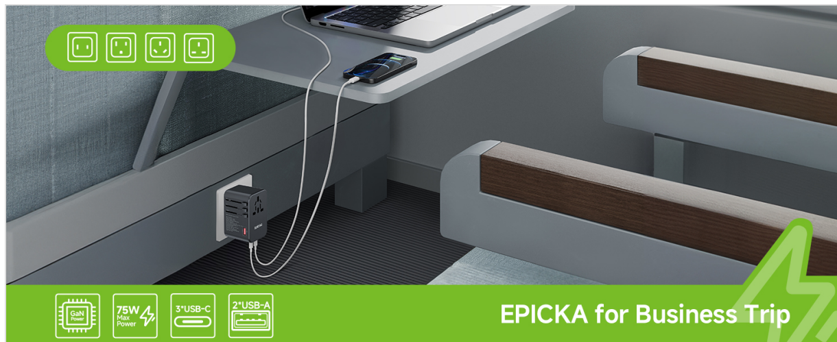
Image: A graphic illustrating the benefits of advanced GaN technology, including lighter, faster, safer charging, improved efficiency, intelligent recognition, increased heat dissipation, and small size.

The integrated GaN (Gallium Nitride) technology allows for a compact size while providing high power output, improved efficiency, intelligent recognition, and increased heat dissipation for safer and faster charging.