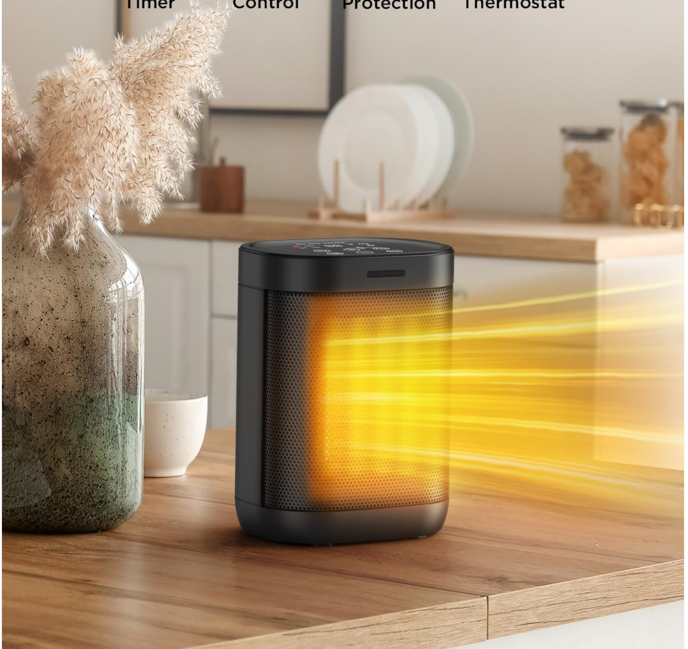
Image: The Chikit space heater showcasing its main features: 24-hour timer, touch control panel, comprehensive safety protection, and an adjustable thermostat.