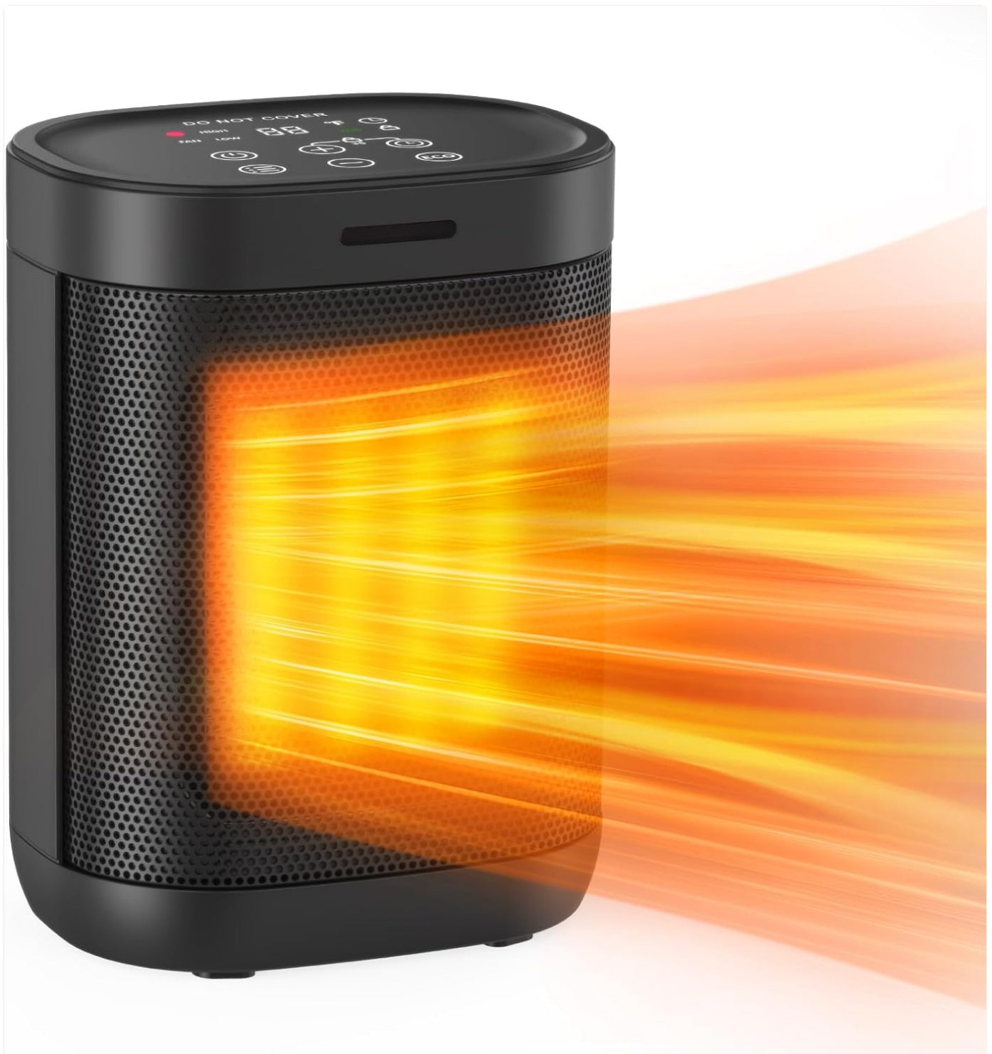
Image: The Chikit space heater in operation, with warm air flowing from its grille and the control panel visible on top.