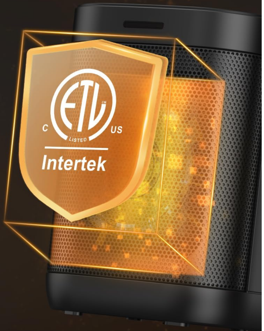
Image: The Chikit space heater highlighting its safety features including child lock, flame retardancy, overheat protection, tip-over protection, and ETL certification.