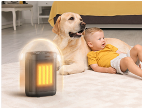
Image: The Chikit space heater positioned near a child and a dog, emphasizing the importance and function of its child lock safety feature.