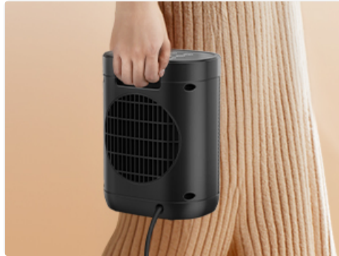
Image: A person carrying the Chikit space heater using its built-in handle, illustrating its portable design for easy placement.