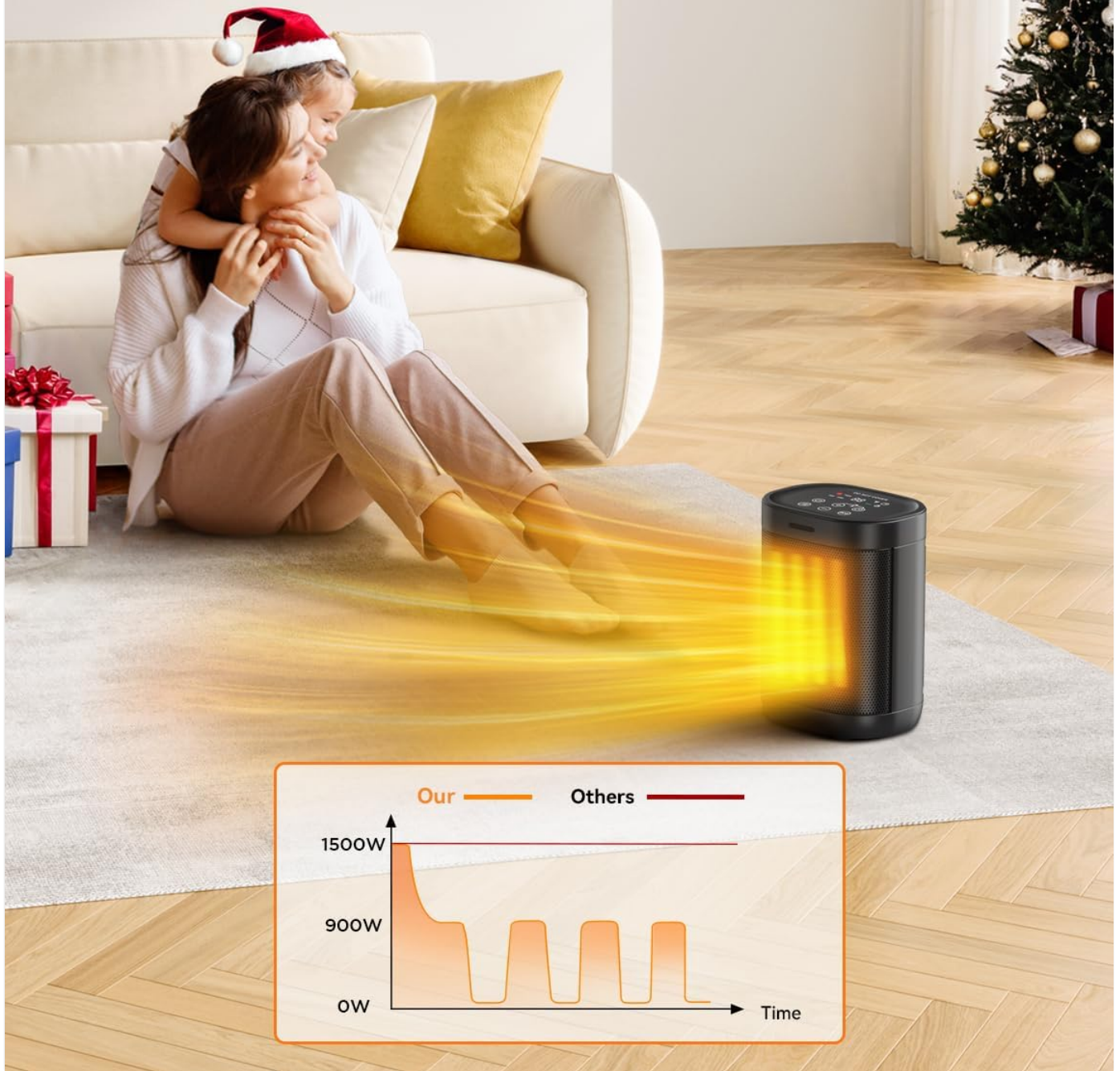
Image: The Chikit space heater operating in ECO mode, illustrated with a graph demonstrating how power consumption fluctuates to maintain a stable temperature, promoting energy efficiency.

ECO mode can reduce energy consumption and be more environmentally friendly