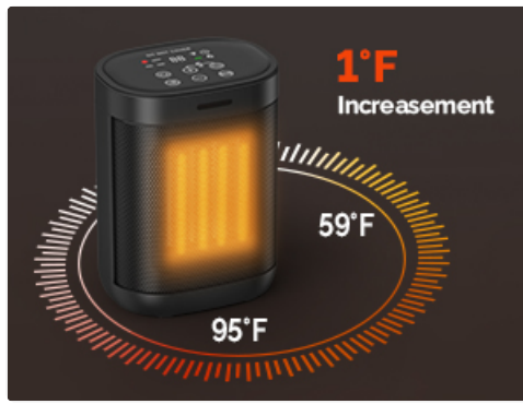
Image: The Chikit space heater demonstrating its adjustable thermostat, allowing temperature settings from 59°F to 95°F in 1°F increments.