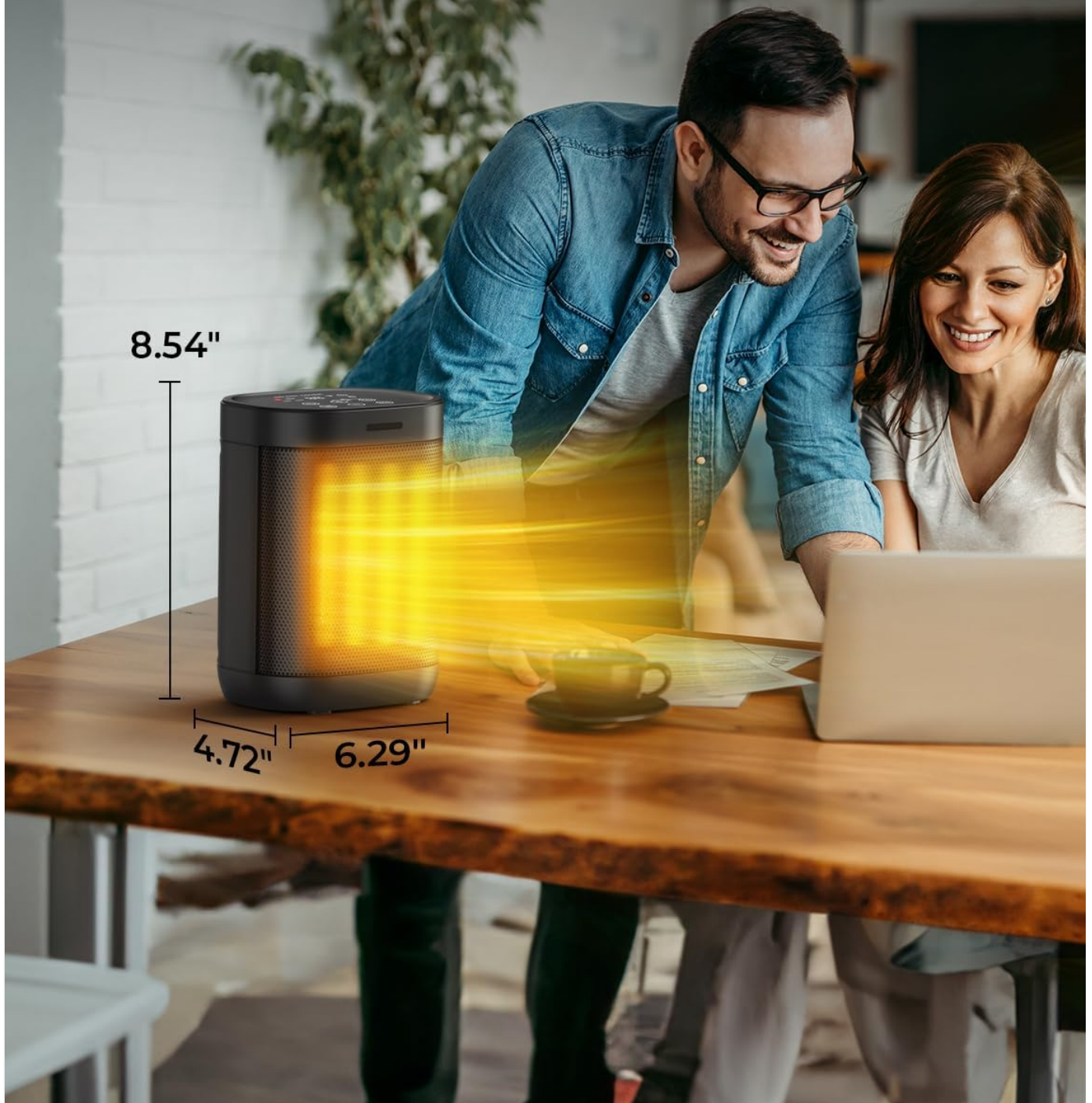
Image: A visual representation of the Chikit space heater with its dimensions clearly marked for height, width, and depth.

It is a powerful partner for you to work and study in winter