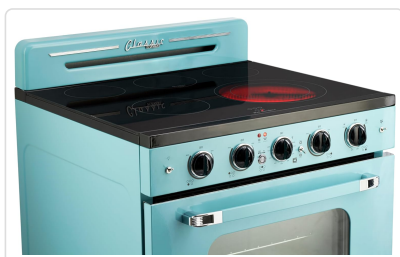
Detailed view of the 5-element glass cooktop and the intuitive control knobs.