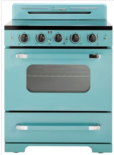
Front view of the Classic Retro Electric Range, showcasing its Ocean Mist Turquoise finish and chrome accents.