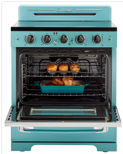
The spacious 3.9 cu/ft oven interior with two adjustable heavy-duty racks, suitable for various dishes.