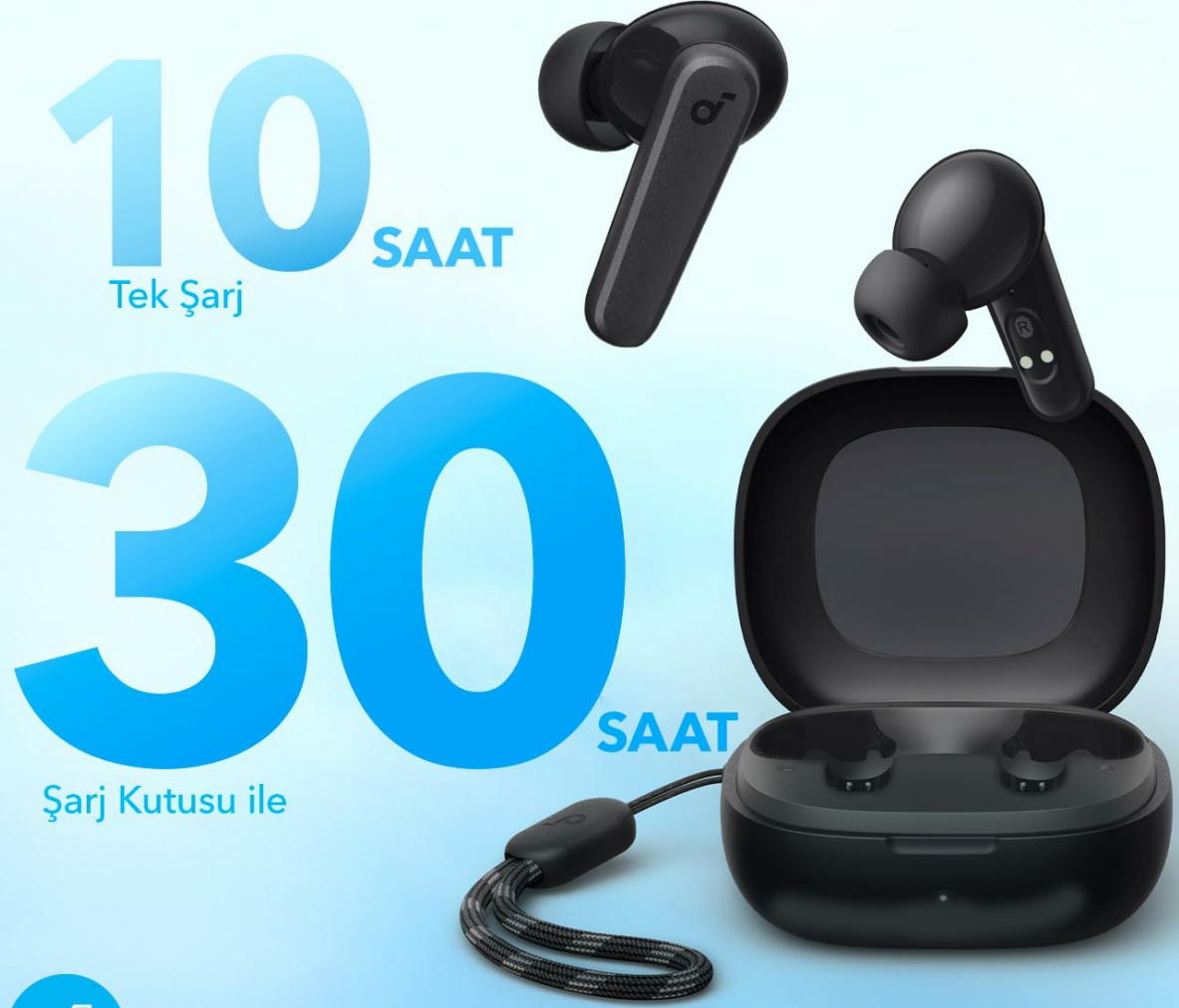
Image: The Anker Soundcore R50i charging case with earbuds inserted, indicating the charging status via an illuminated LED.

The R50i earbuds offer an impressive 30 hours of total playtime with the charging case. A quick 10-minute charge can provide up to 2 hours of listening time.