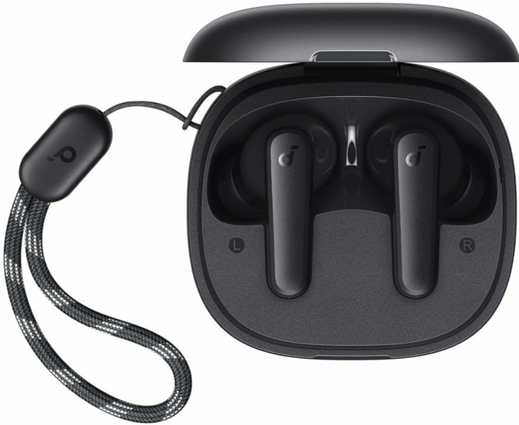
Image: The open charging case of the Soundcore R50i, showing the two earbuds securely placed within their charging slots.