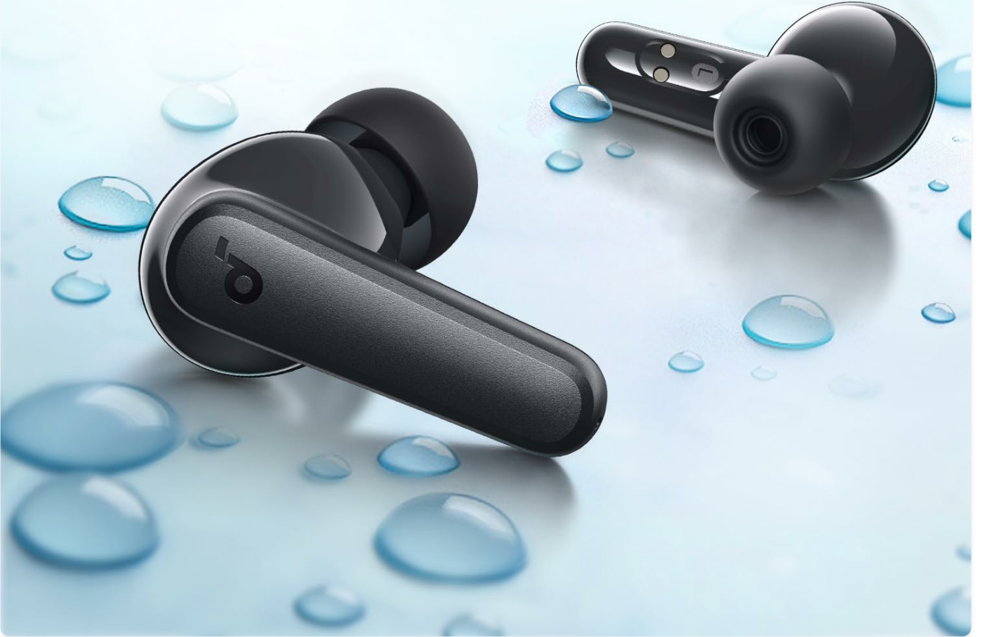
Image: A detailed view of a single Soundcore R50i earbud, emphasizing the touch-sensitive surface for control inputs.