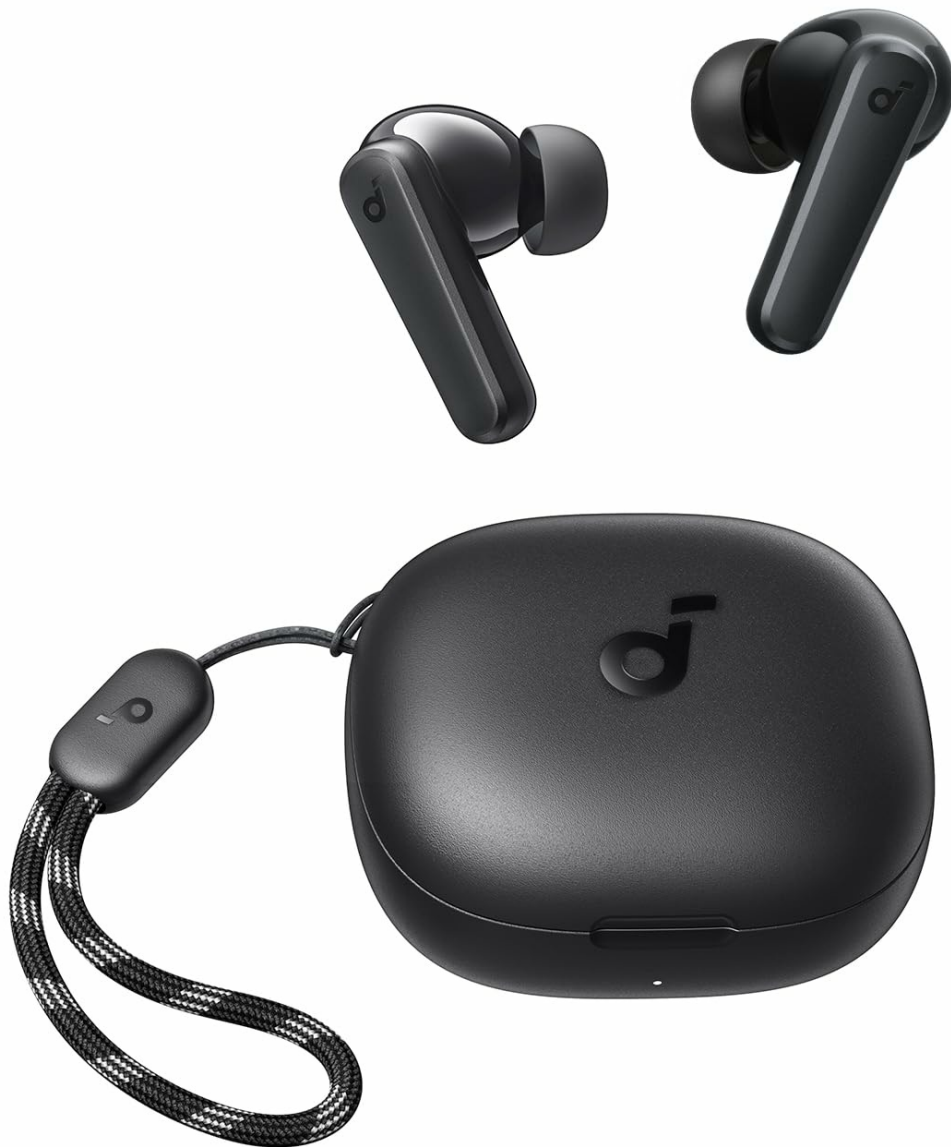
Image: Anker Soundcore R50i True Wireless Earbuds and their charging case, presented in black.