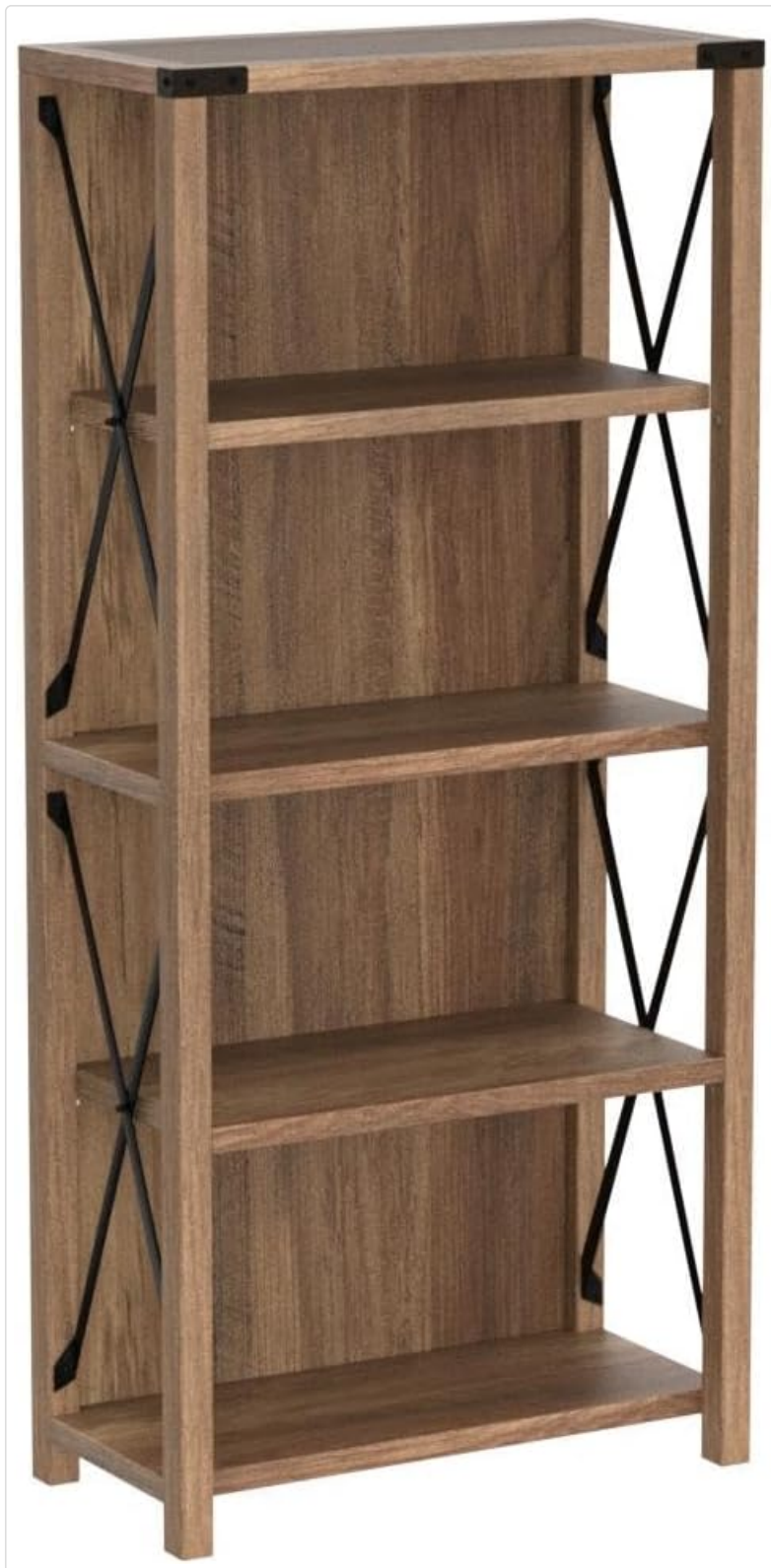
Figure 1: An assembled AMERLIFE 4-Tier Bookshelf, showcasing its structure.