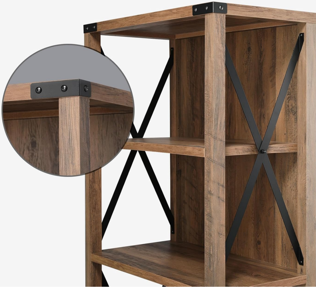
Figure 2: Detail of the X-shaped metal frame and corner bracket, highlighting the structural design.