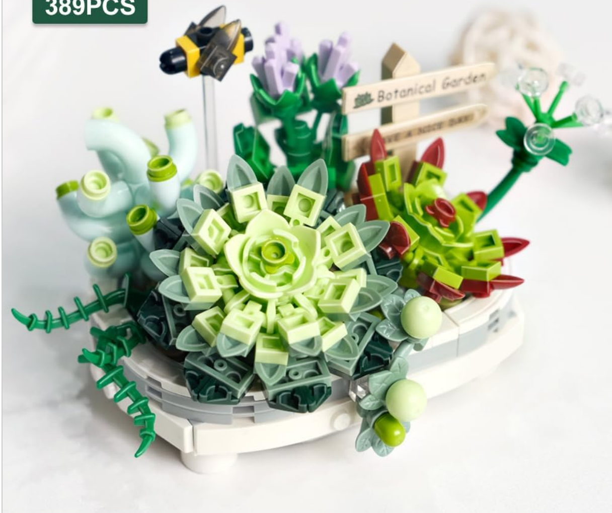
Figure 1.1: The fully assembled LOZ Mini Blocks 1660 Succulent Plant Building Kit, showcasing the various plant elements and decorative bee.