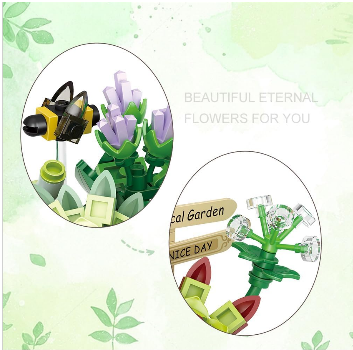
Figure 3.3: Close-up of the intricate details of the bee and other floral elements.