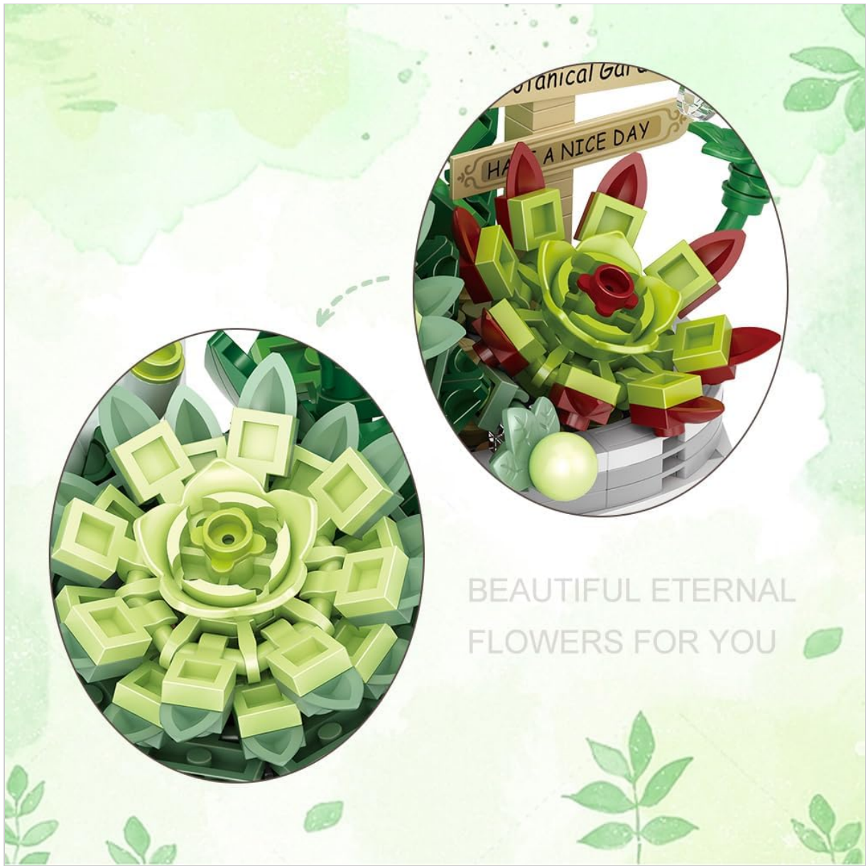
Figure 3.2: Detailed view of one of the succulent plant constructions, highlighting the block connections.