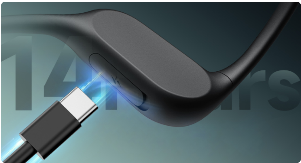
Image: Charging the RunFree headphones.