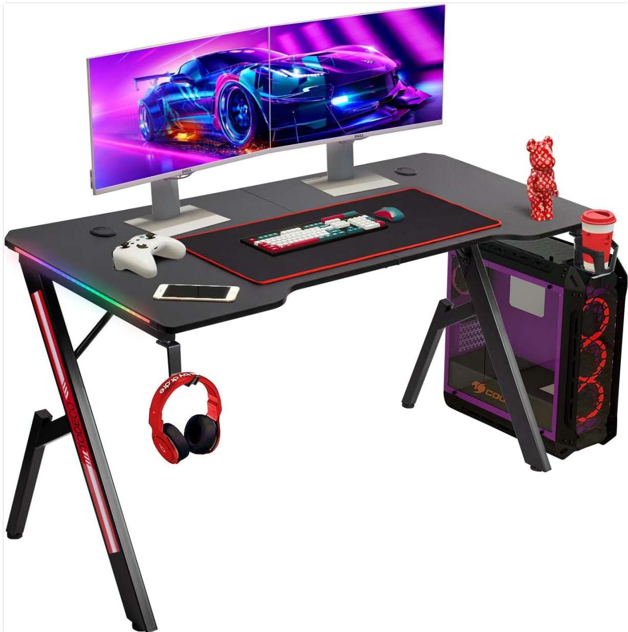
Image: The Todeco LED Gaming Desk, showcasing its spacious carbon fiber top, integrated RGB lighting, and accessories like the headphone hook and cup holder.