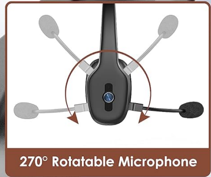
270° Rotatable Microphone