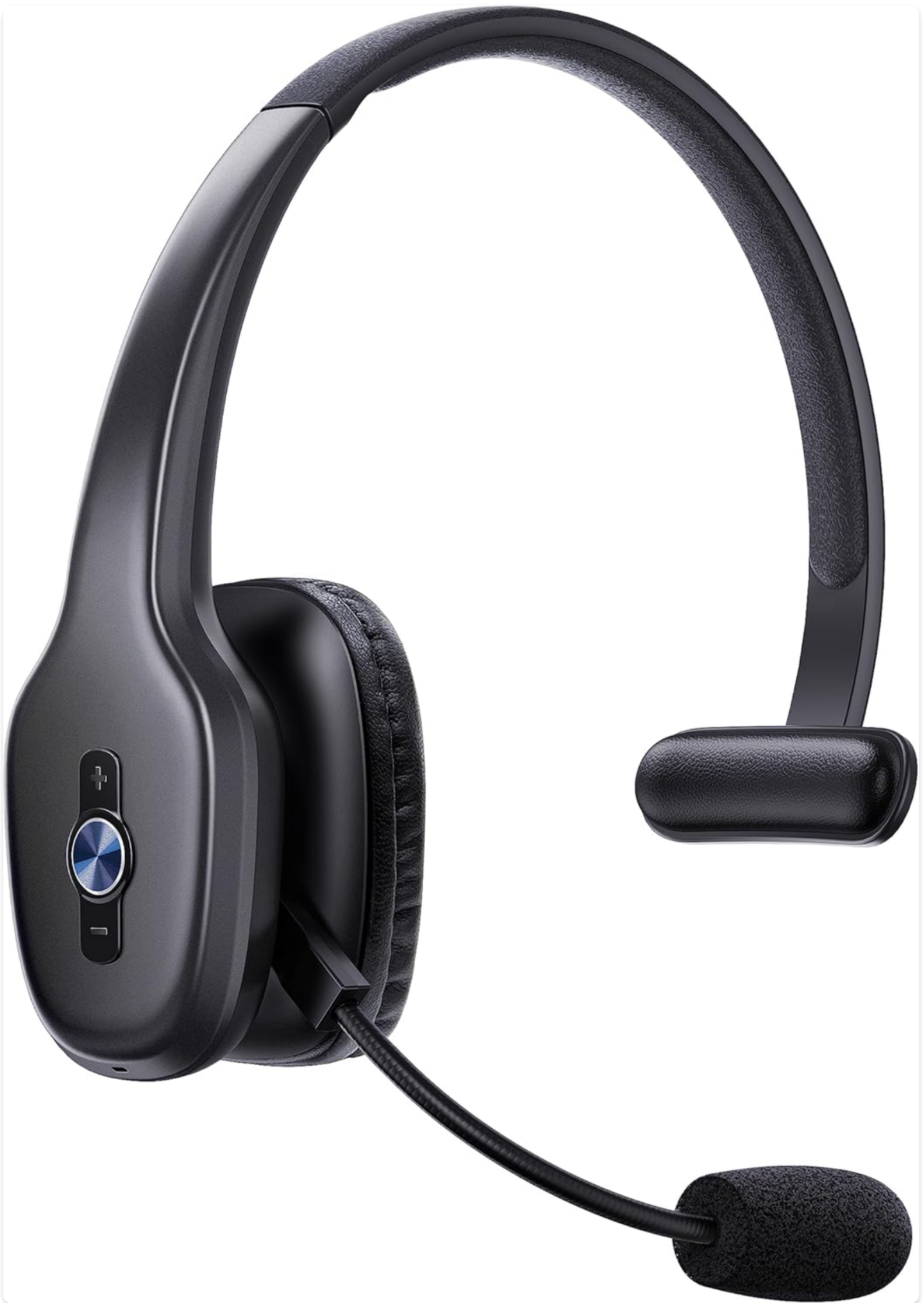
Figure 2.1: Gixted Bluetooth Headset H1. This image displays the overall design of the headset, highlighting its sleek black finish and the integrated microphone arm.