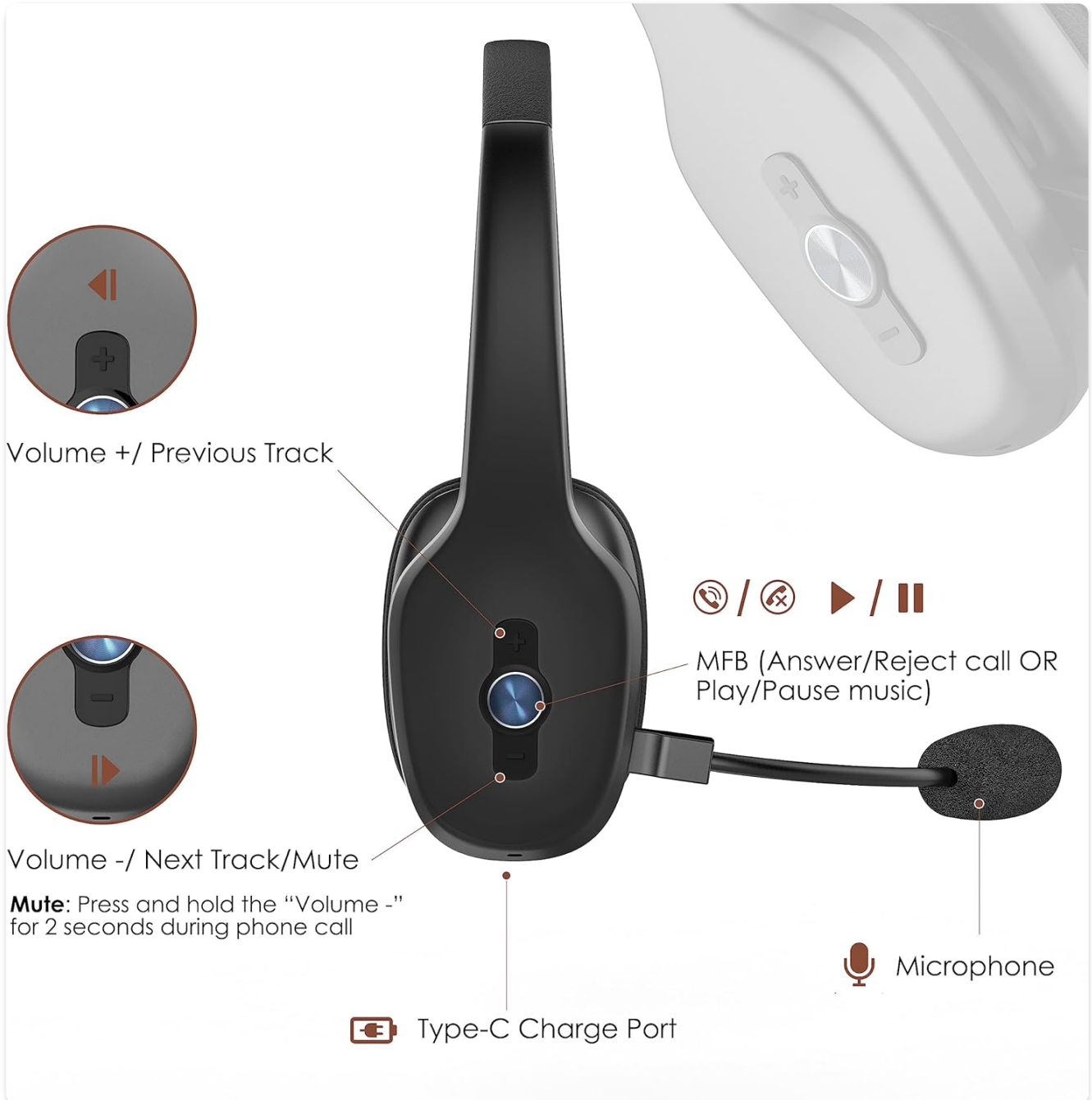
Figure 4.1: Headset Control Buttons. This diagram clearly labels the Multi-Function Button (MFB), Volume +/- buttons, and the Type-C charging port, along with their primary functions.