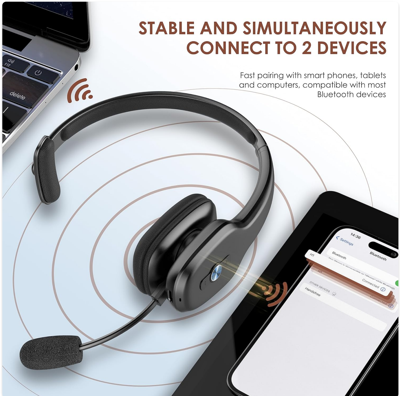
Figure 3.2: Simultaneous Device Connection. This image demonstrates the headset's ability to connect stably and simultaneously to two devices, such as a laptop and a smartphone.