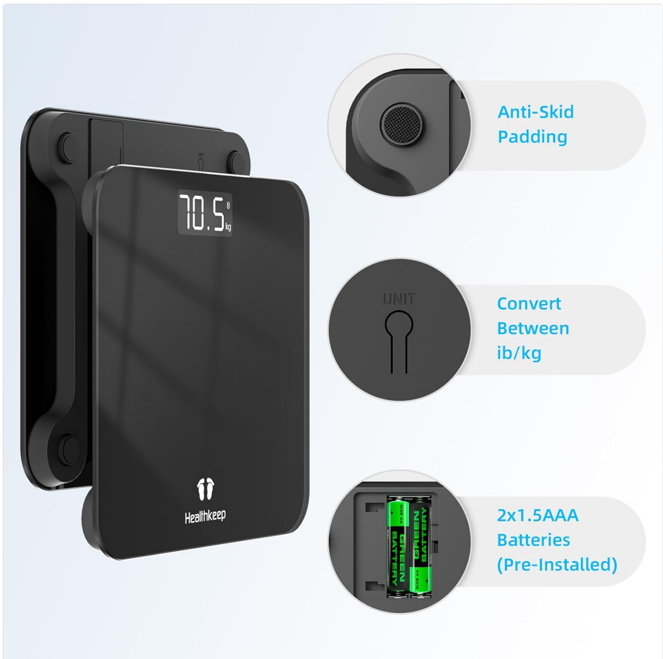
Image: Underside of the scale showing the battery compartment and the unit conversion button. The scale uses 2x AAA batteries, which are pre-installed.