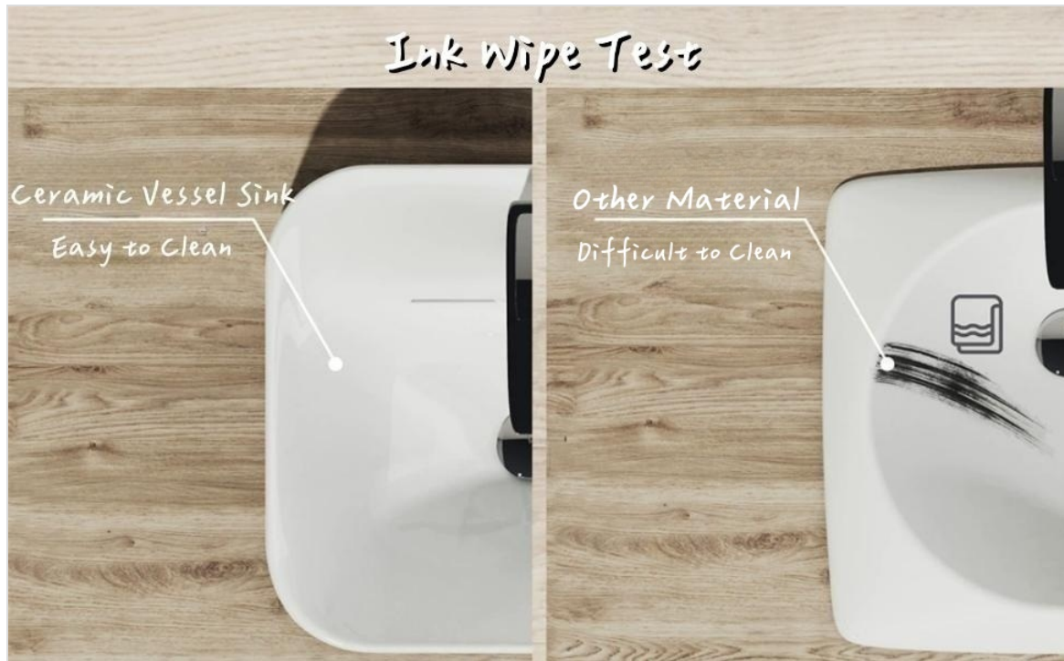
Image: Cleaning and maintenance guidelines from the instruction manual.