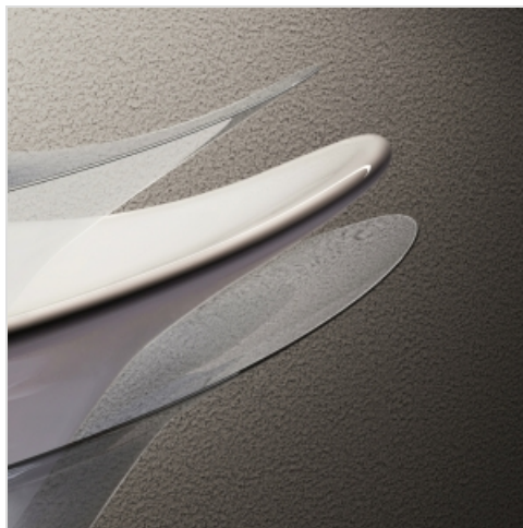
Image: Illustration of a faucet installed on the countertop next to the sink.

Install the faucet (not included) following its manufacturer's instructions.