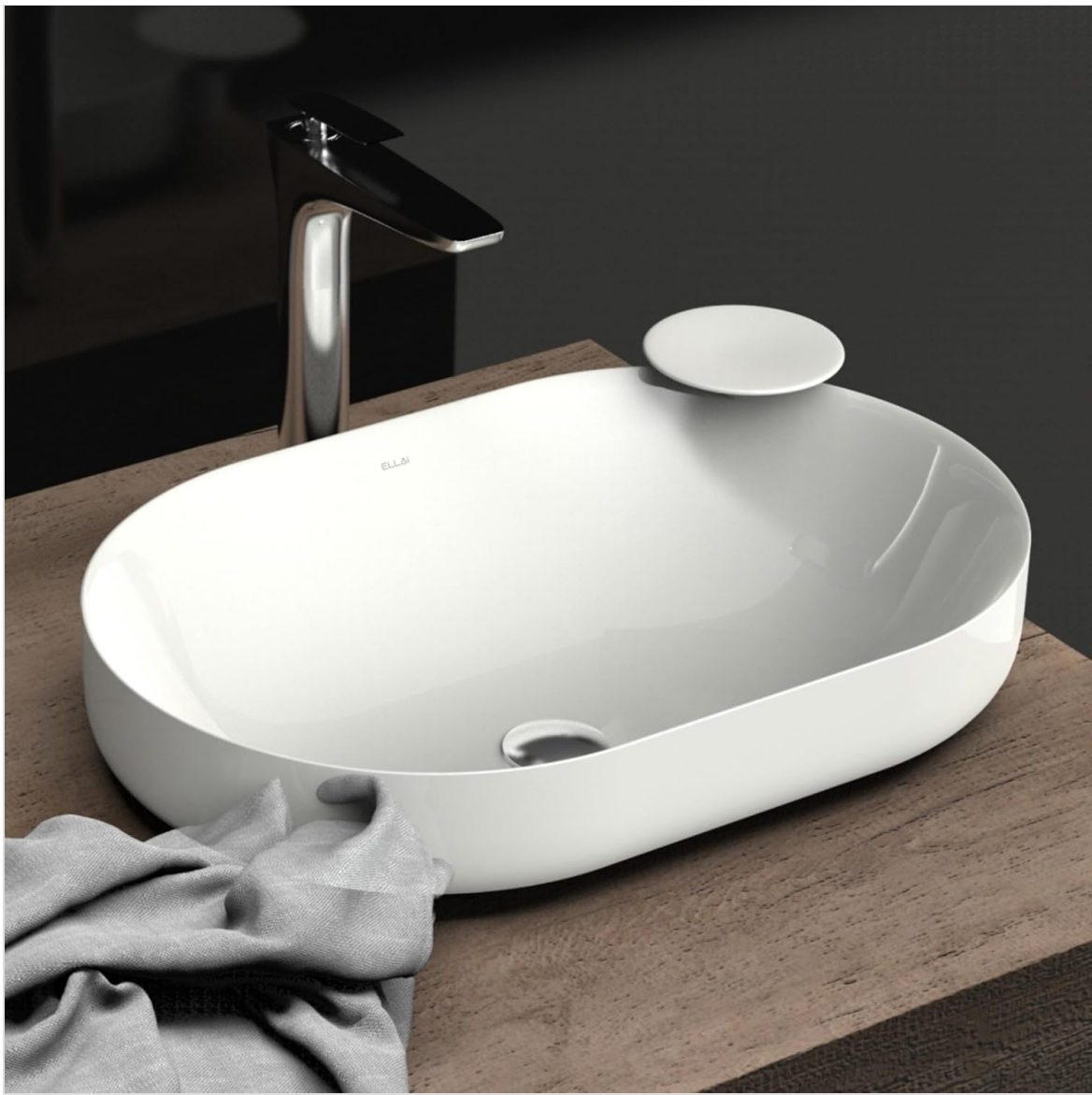
Image: Front view of the ELLAI Polaris Oval Bathroom Vessel Sink.