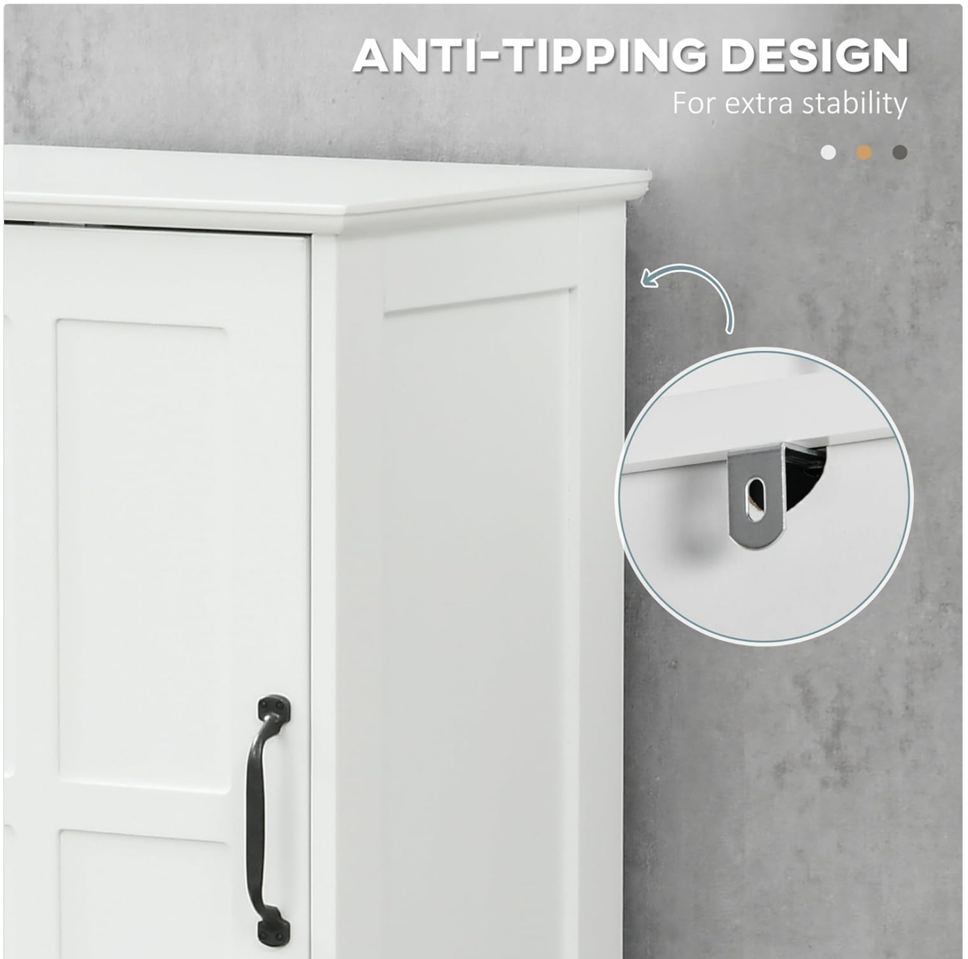
Image: A close-up view of the anti-tipping design, showing the metal bracket that attaches to the top rear of the cabinet, designed to be secured to a wall for stability.