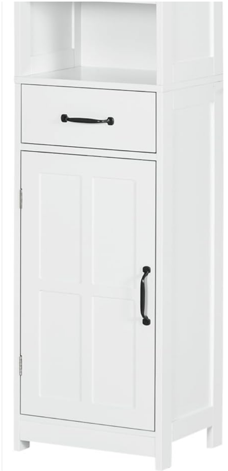
Image: Front view of the kleankin Slim Bathroom Storage Cabinet, showcasing its tall, slim profile with an upper cabinet, an open shelf, a drawer, and a lower cabinet, all in a clean white finish.