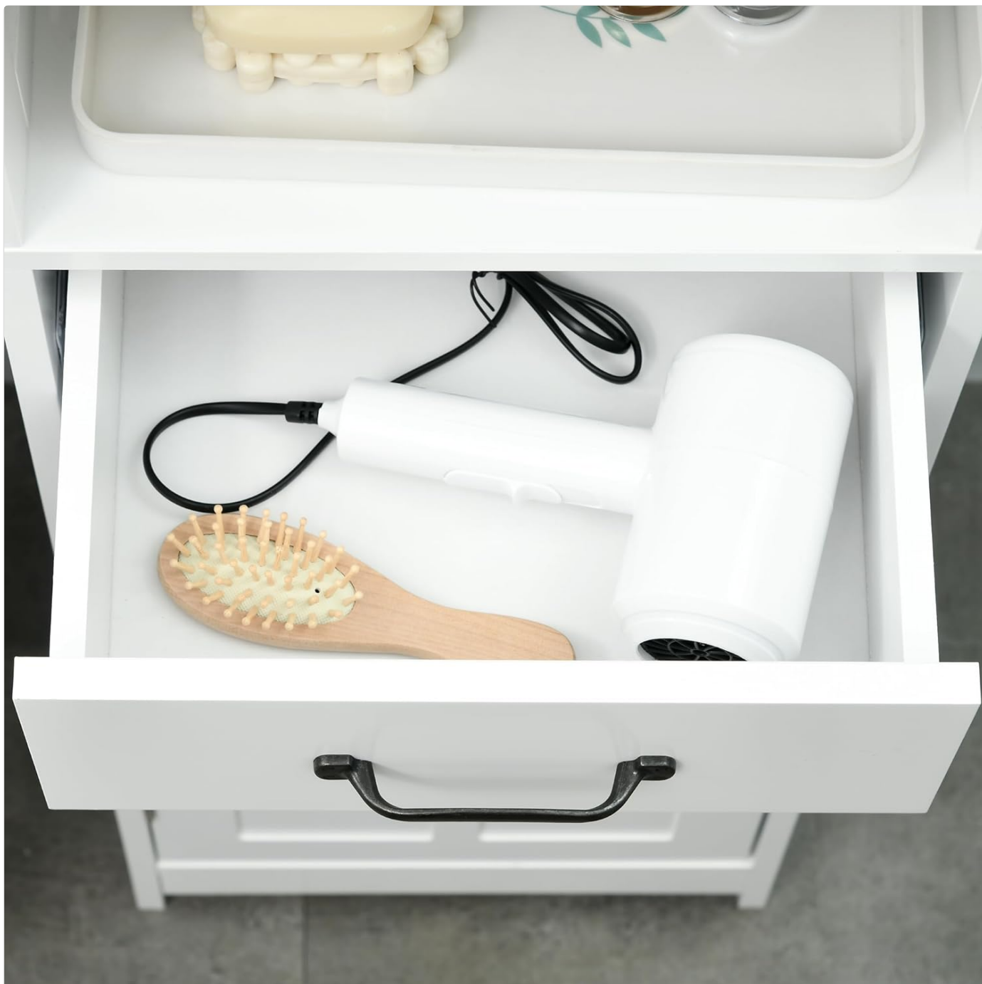
Image: A close-up view of the cabinet's drawer, showcasing its interior space with a hair dryer and a brush, indicating its suitability for storing personal care items.