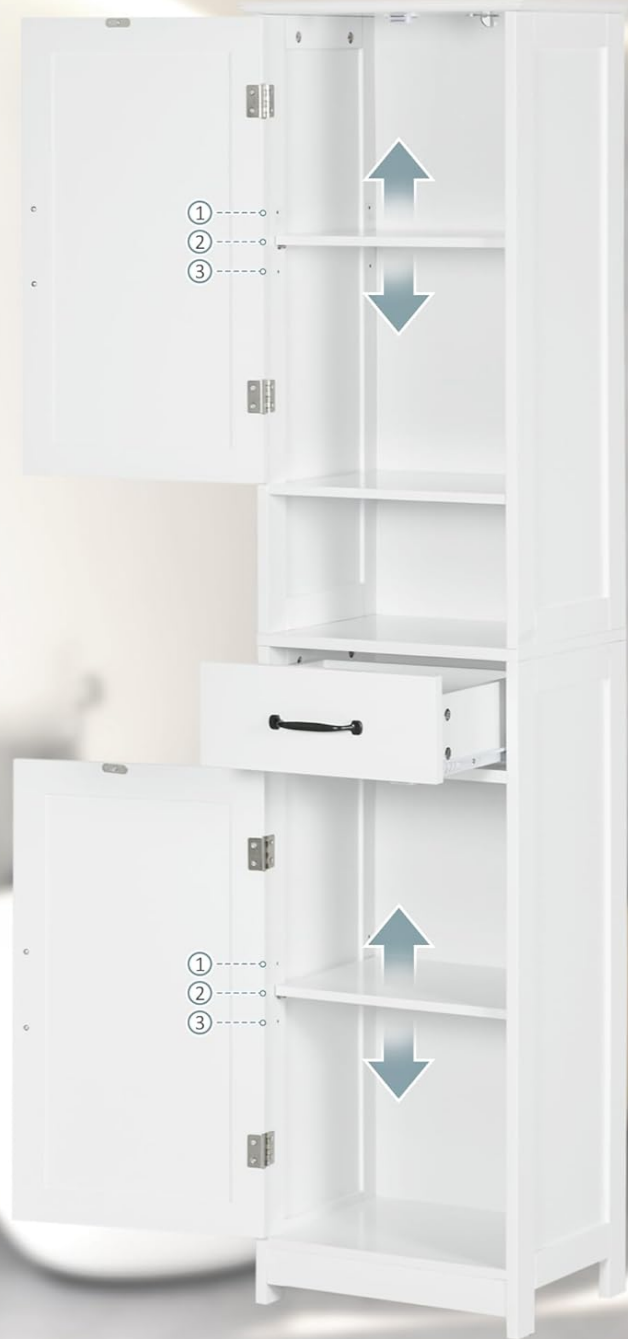
Image: An illustration demonstrating the "Adjustable Shelf" feature within both the upper and lower cabinet sections, showing how shelves can be repositioned to meet different storage needs.