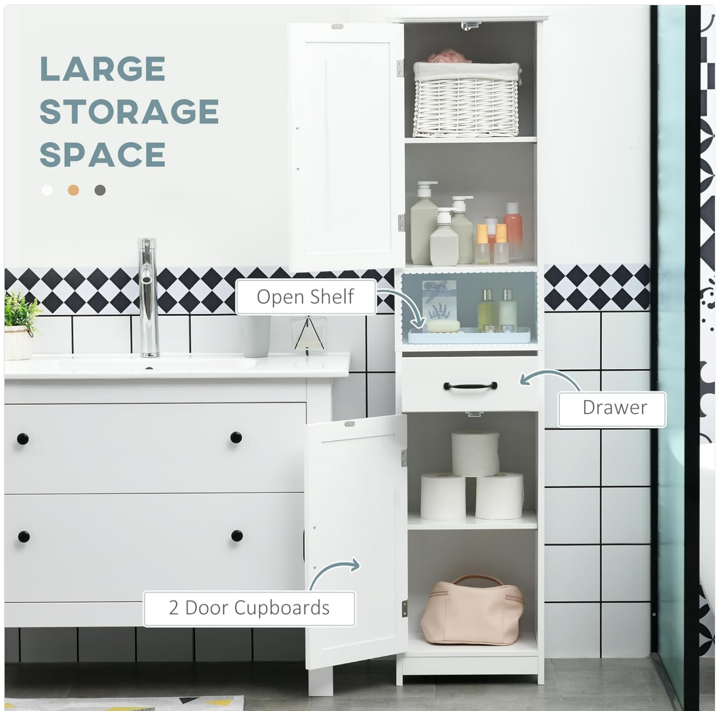
Image: A visual representation highlighting the "Large Storage Space" of the cabinet, pointing out the open shelf, the sliding drawer, and the two door cupboards, demonstrating their capacity for various bathroom items.