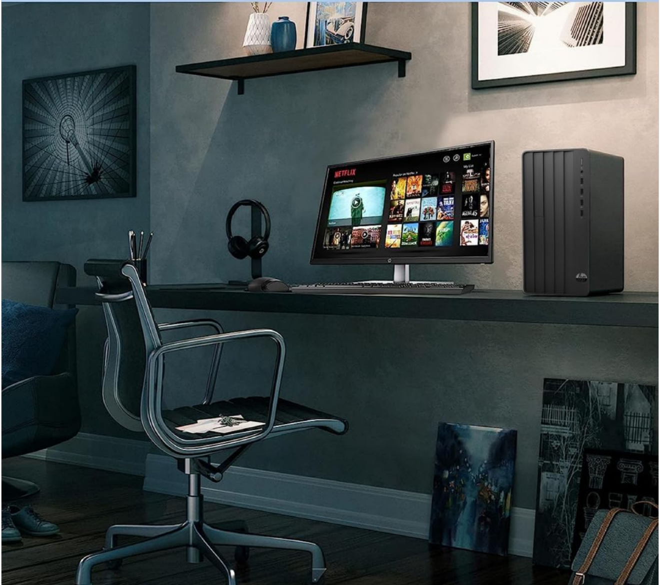
Image: The desktop computer set up on a desk with a monitor, keyboard, and mouse, demonstrating a typical workspace configuration.

Connect and stream smoothly thanks to the Wi-Fi® and Bluetooth® combo with MU-MIMO support for multi-device homes.