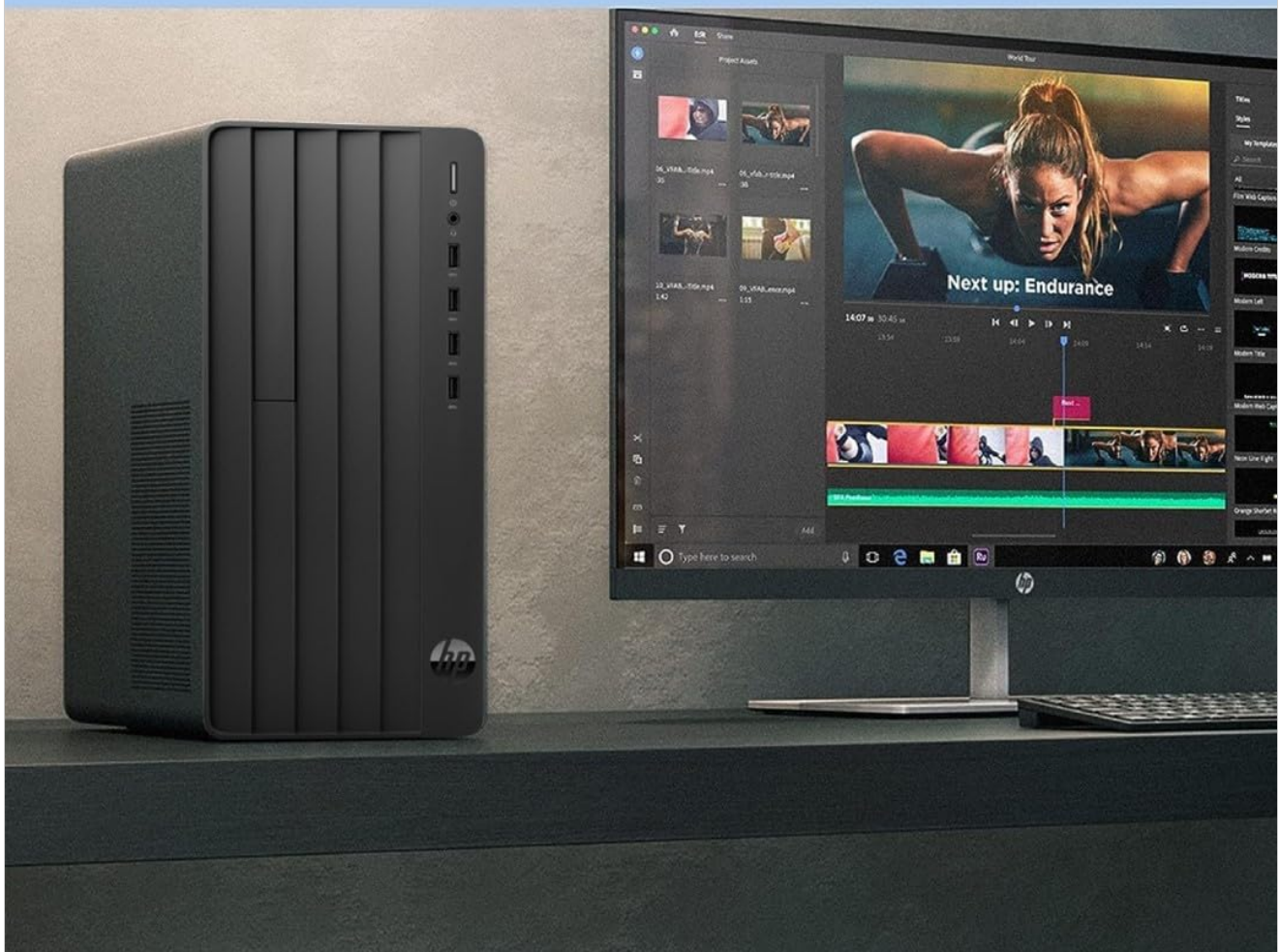
Image: The desktop and monitor displaying a video editing interface, highlighting its capability for resource-intensive tasks.

From a rejuvenated Start menu to new ways to connect, the Windows 11 Pro OS is the place to pursue your passions through a fresh experience.