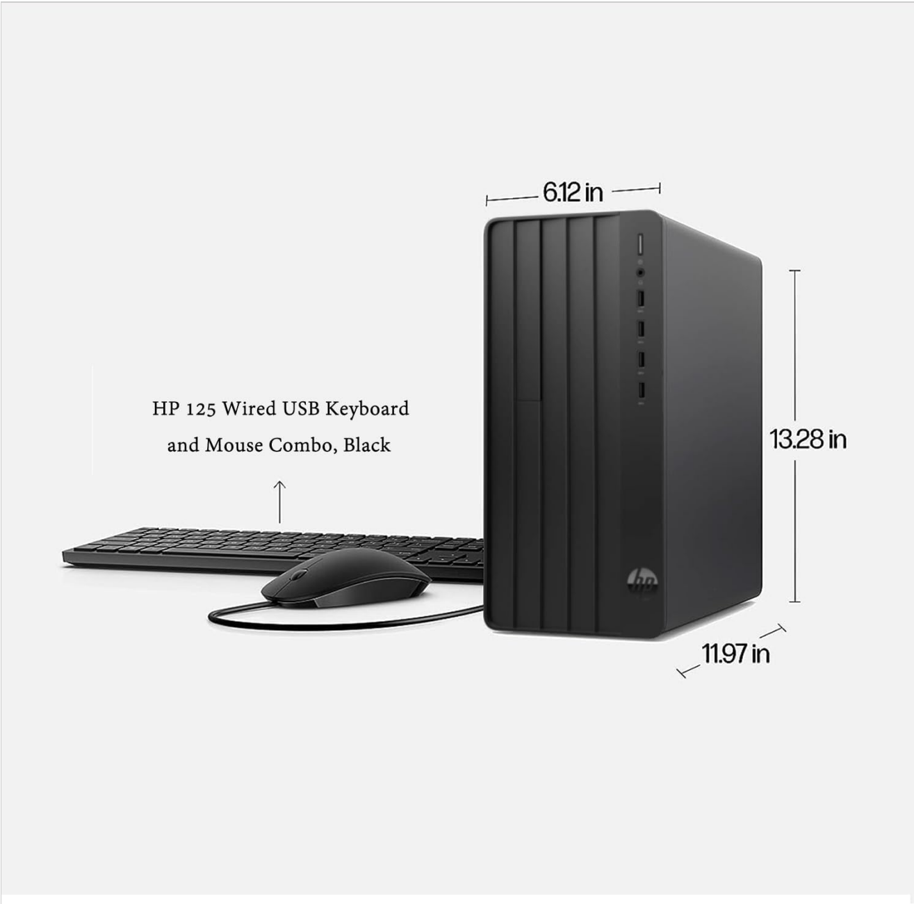
Image: The physical dimensions of the HP Pro Tower 290 G9 desktop, illustrating its compact form factor.