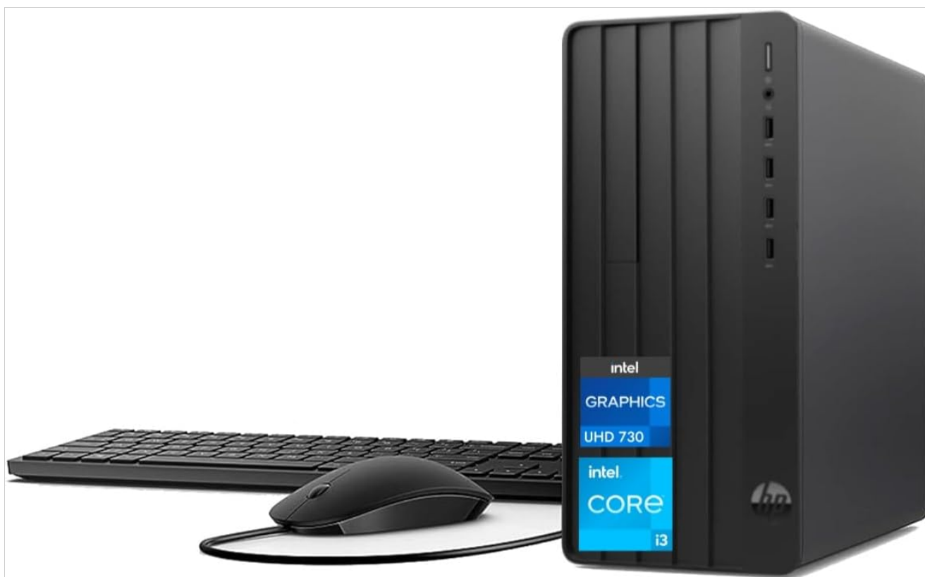
Image: The HP Pro Tower 290 G9 Business Desktop, shown with its included keyboard and mouse, ready for use.

This manual provides comprehensive instructions for setting up, operating, maintaining, and troubleshooting your HP Pro Tower 290 G9 Business Desktop. Please read this manual thoroughly to ensure proper use and to maximize the performance and longevity of your device.