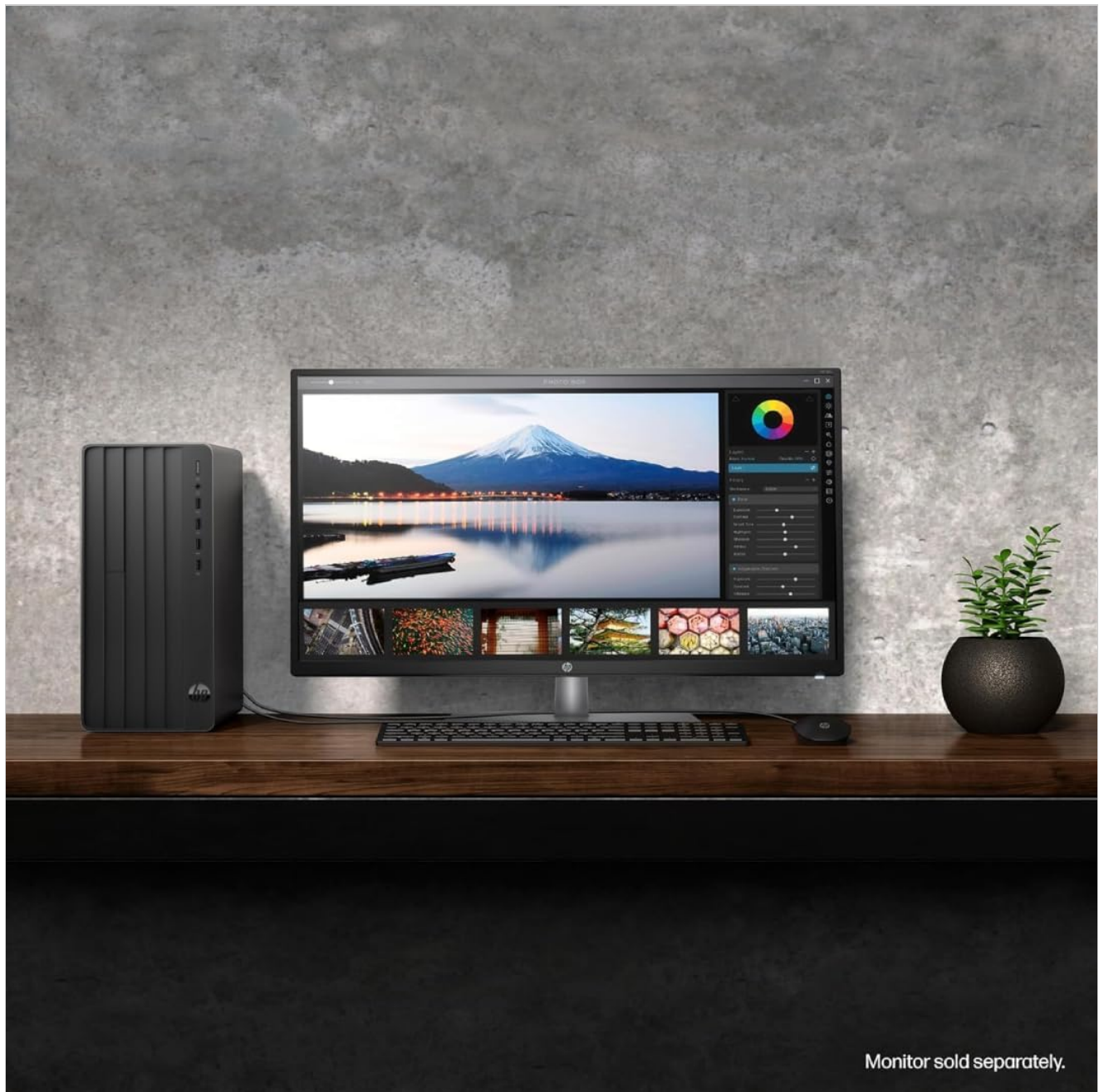
Image: The desktop and monitor displaying a photo editing application, demonstrating its suitability for creative and business tasks.