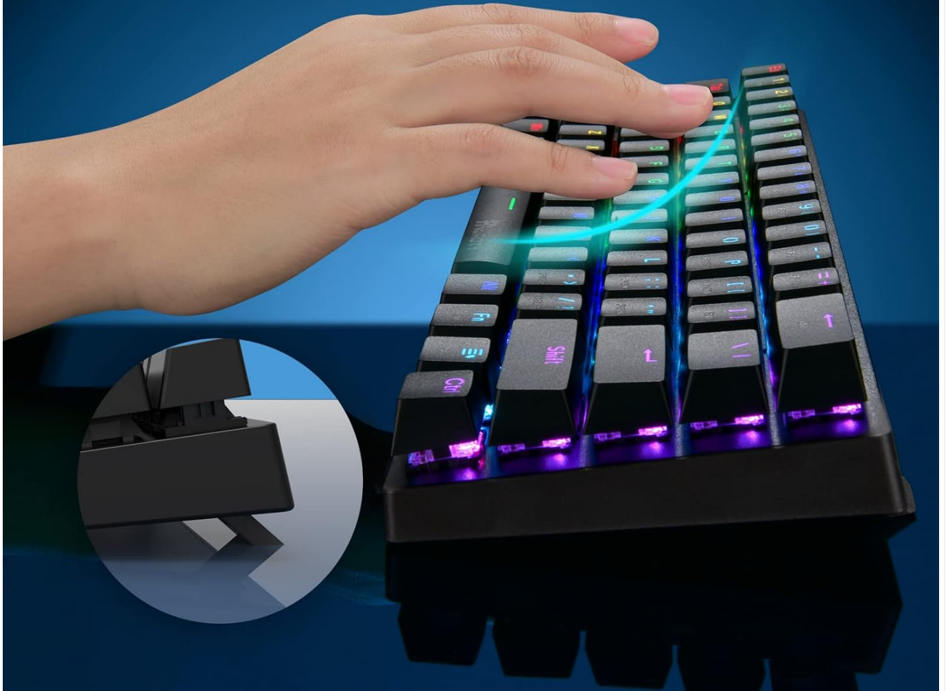
Image: A close-up of the keyboard with a hand typing, revealing the classic blue mechanical switches and detachable keycaps. Text highlights features like fast response, no lag, and a 50 million keystroke life.