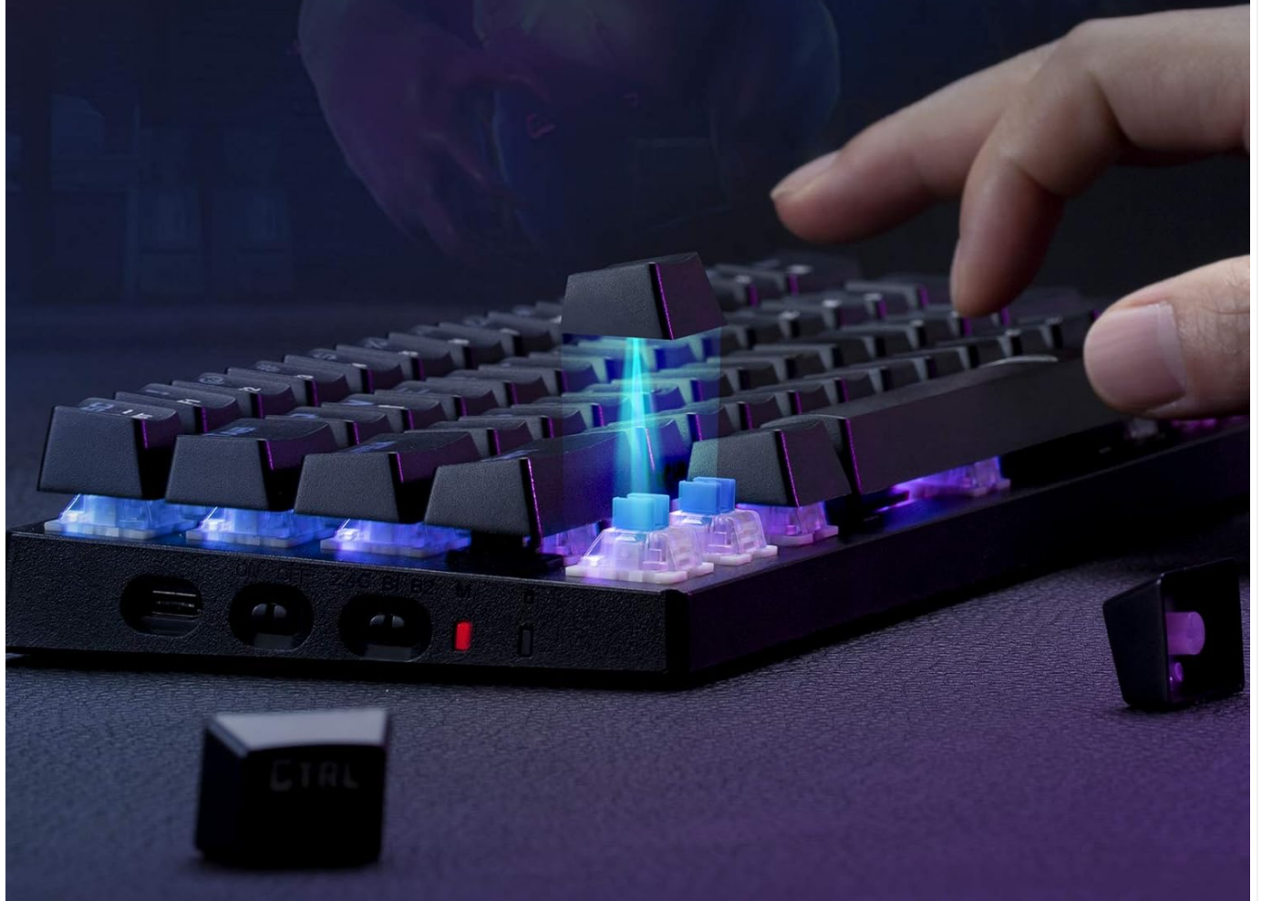
Image: The keyboard displaying its RGB backlighting capabilities, including 16 lighting effects, 8 selectable colors, 6 brightness levels, customizable lighting options, and a power on/off function for the lights.

Fast response & No lag | 50 million keystroke life | Detachable Keycaps