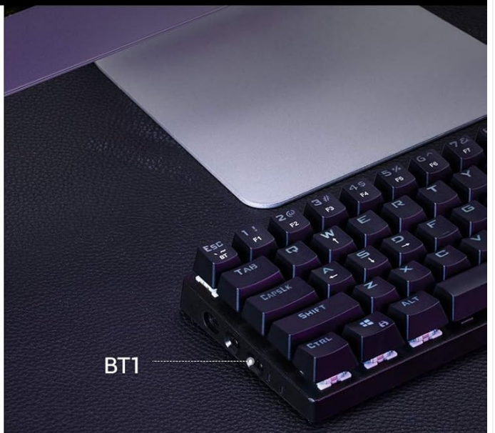
Image: Top-down view of the RisoPhy 60% Wireless Mechanical Keyboard, showcasing its compact layout and vibrant RGB backlighting.