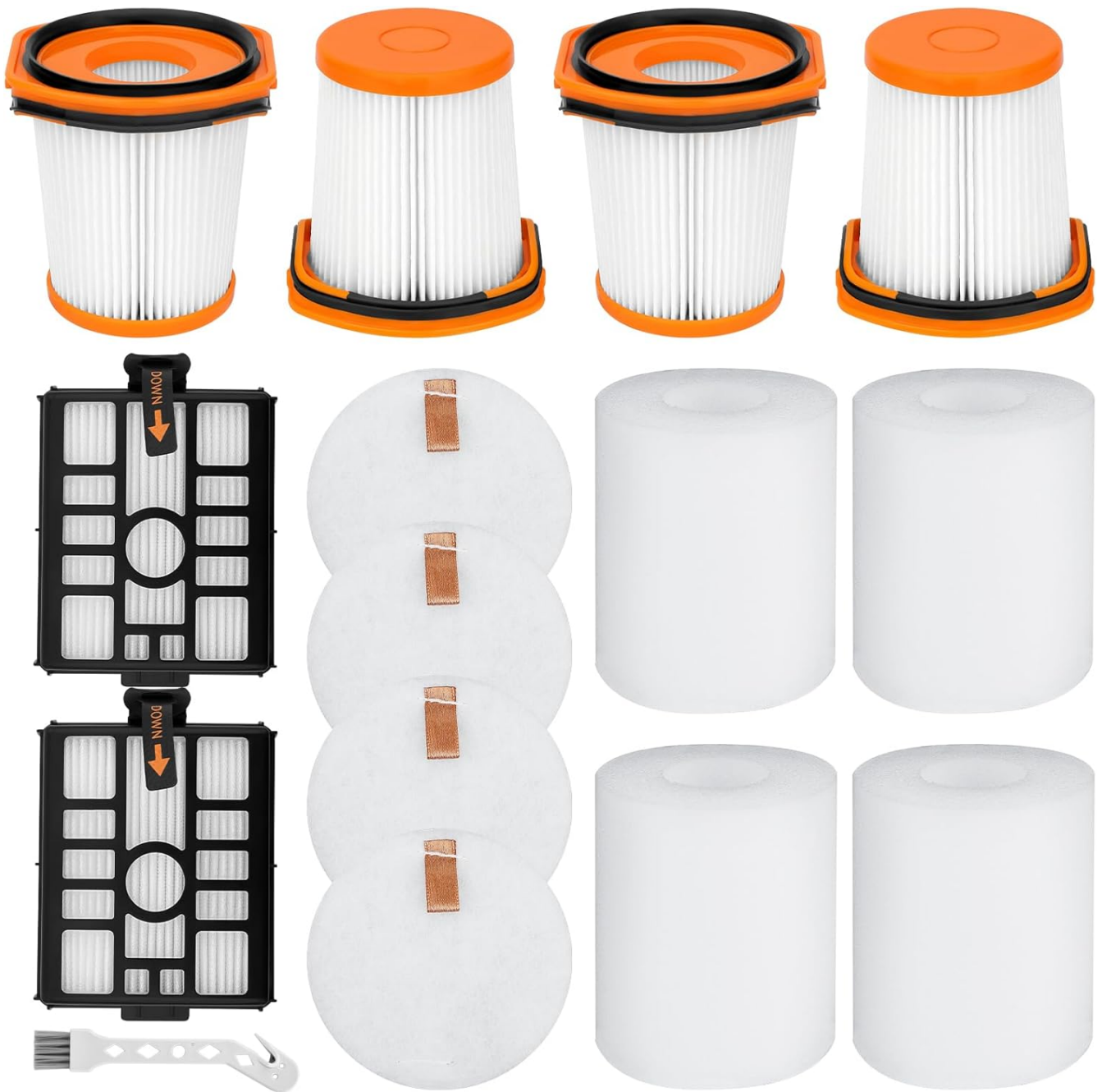
Image: Complete Erince WS642AE filter replacement kit, showing HEPA filters, foam & felt filters, base post-motor filters, and a cleaning brush.