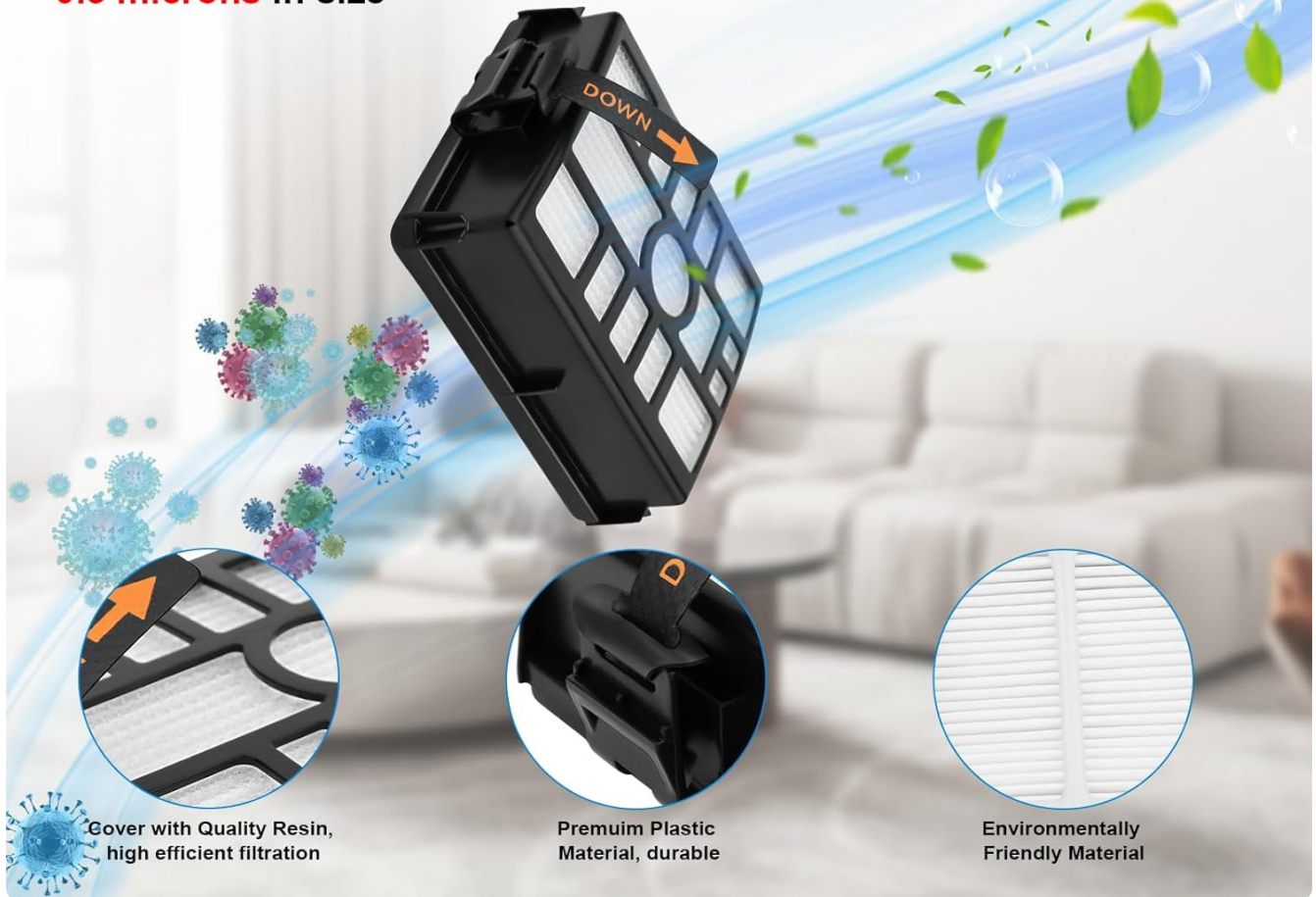
Image: Close-up view of the H13 HEPA filter, illustrating its pleated design and ability to capture fine particles.