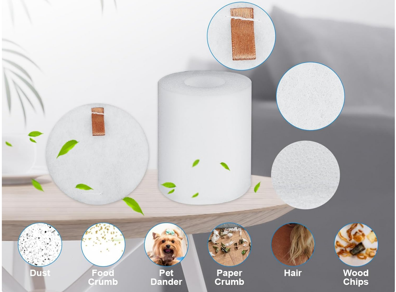
Image: Depiction of the foam and felt filters, highlighting their role in capturing various household particles like dust, food crumbs, pet dander, and hair.