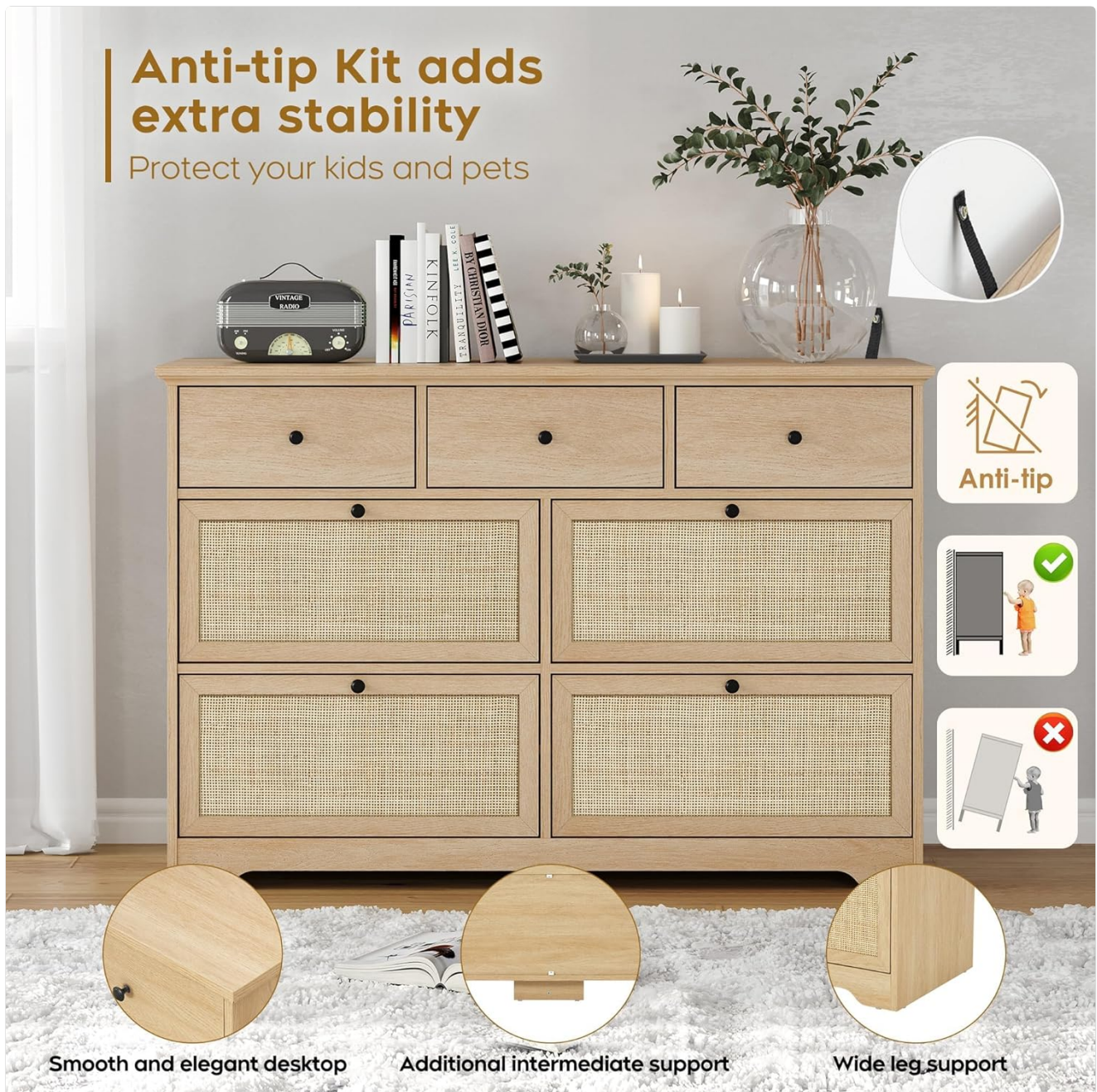
Figure 2: Illustration of the anti-tip kit, demonstrating how it adds stability and protects against accidental tipping. The image highlights the importance of securing the dresser to a wall.