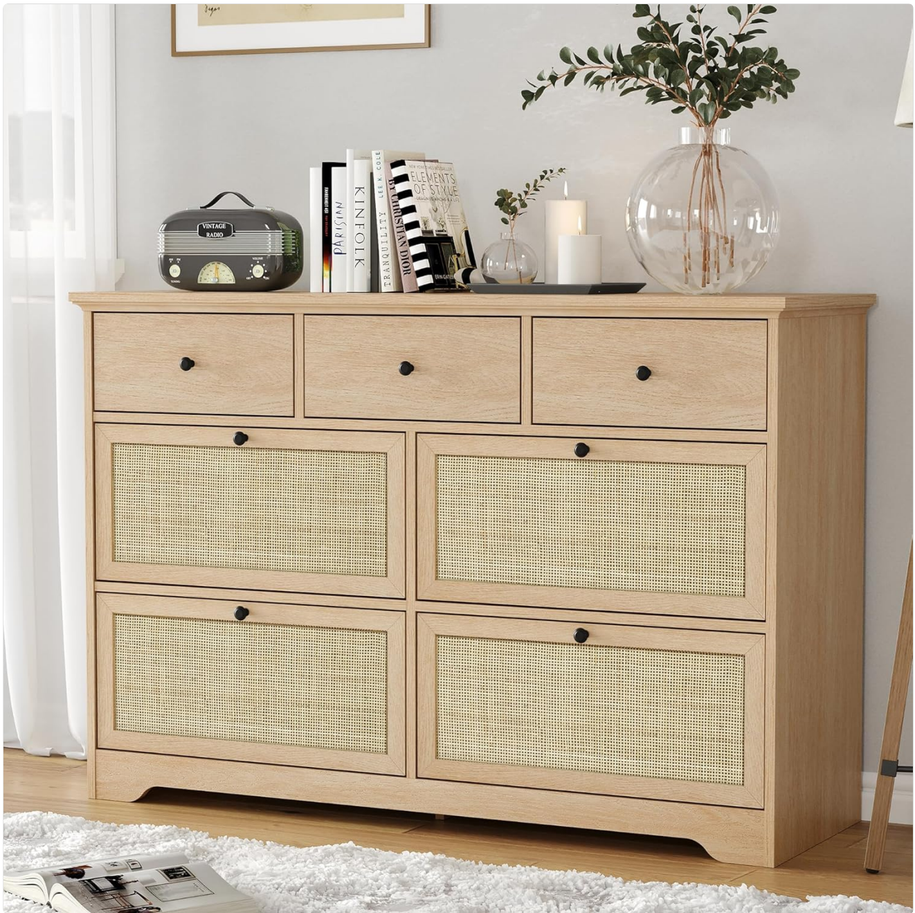
Figure 1: The Brafab Rattan Dresser (Model QH-1501NL) featuring seven drawers and a natural wood finish with rattan panels.