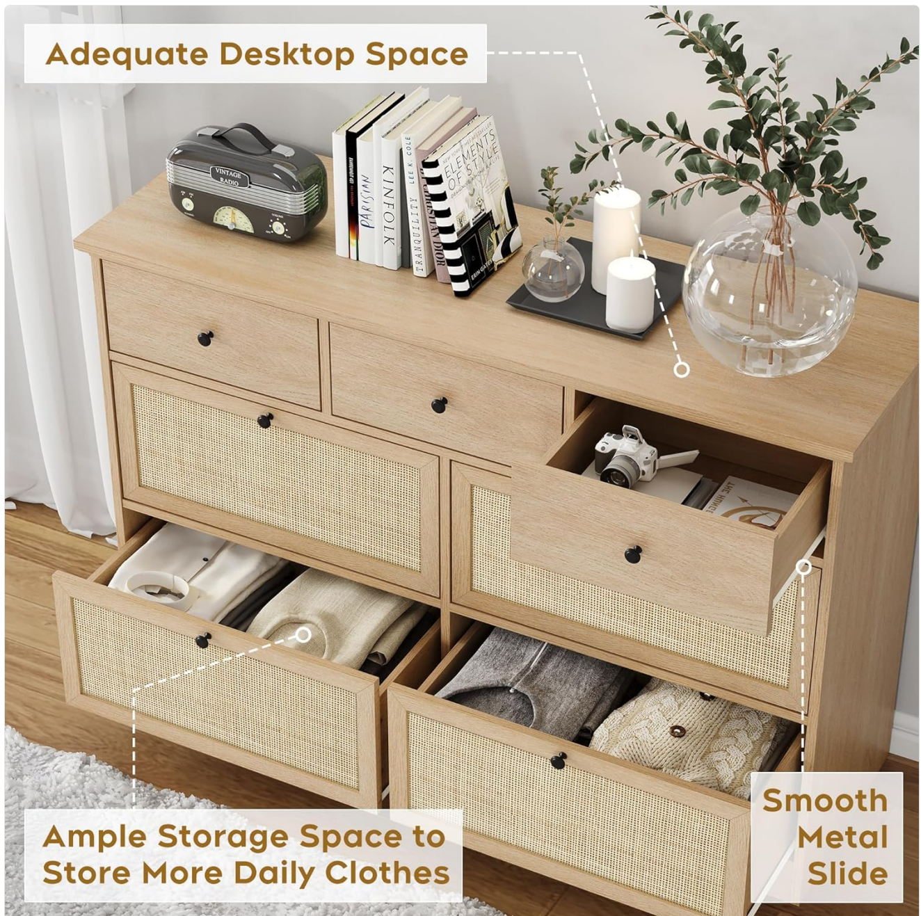
Figure 4: The dresser with drawers open, showcasing its storage capacity and smooth metal slides.