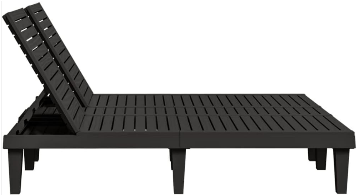
Image 5.2: Side view of the lounge demonstrating one backrest in a raised position.