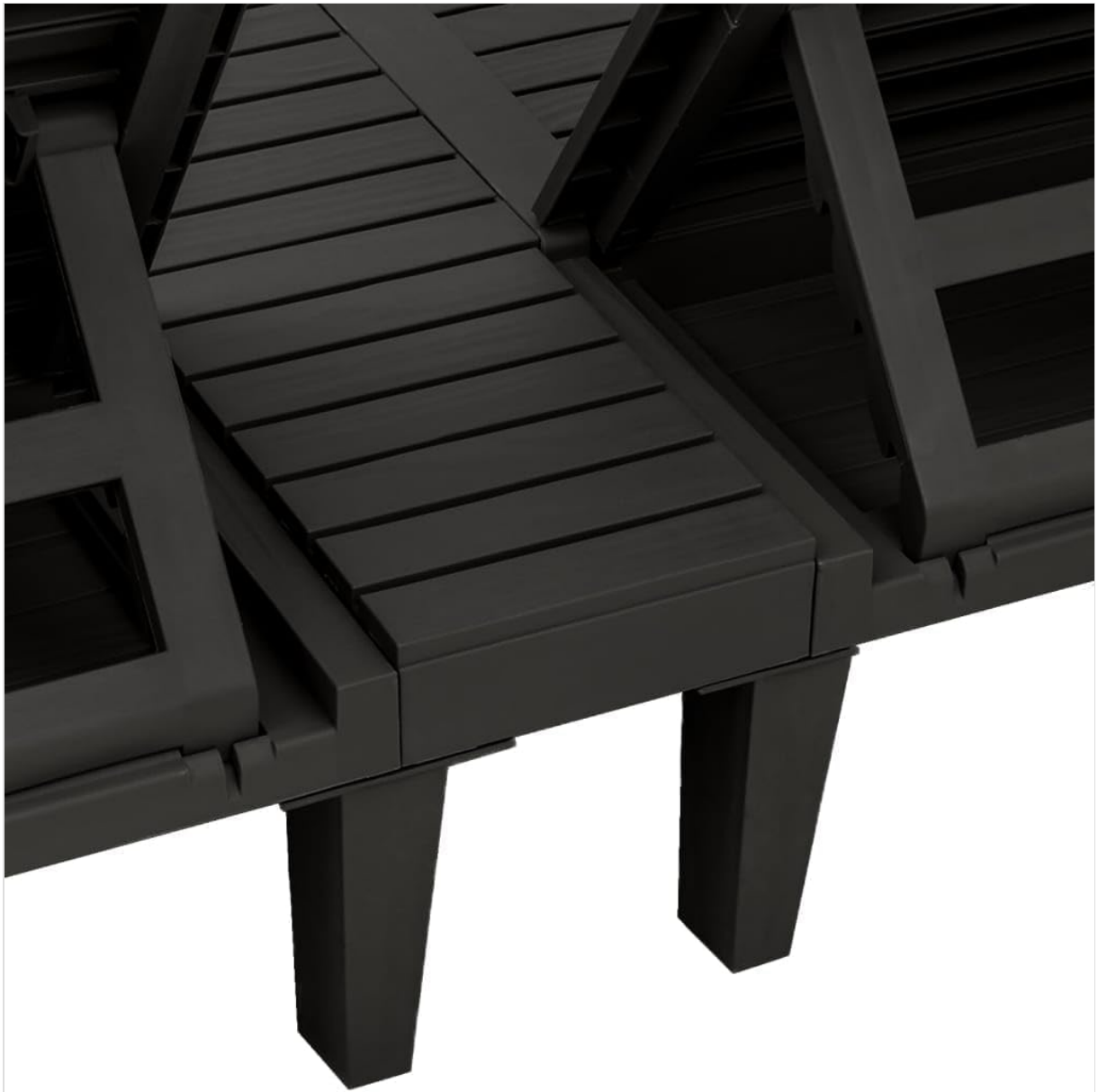
Image 4.2: Detail of the lounge's leg and frame structure, illustrating connection points for assembly.