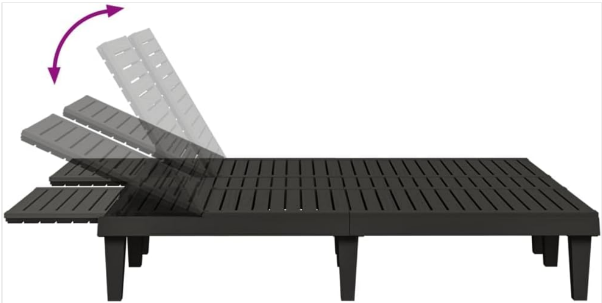
Image 5.1: Illustration of the backrest adjustment mechanism, showing how to change reclining positions. Each side of the double lounge can be adjusted independently, allowing two users to select their preferred reclining angle.