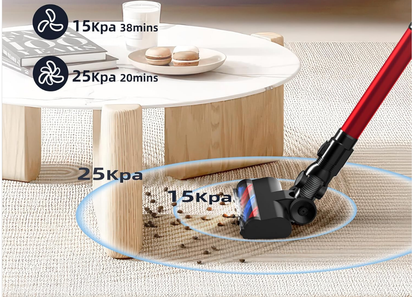
Figure 2: The vacuum cleaner offers two suction modes for different cleaning needs.

The vacuum cleaner offers two suction modes: