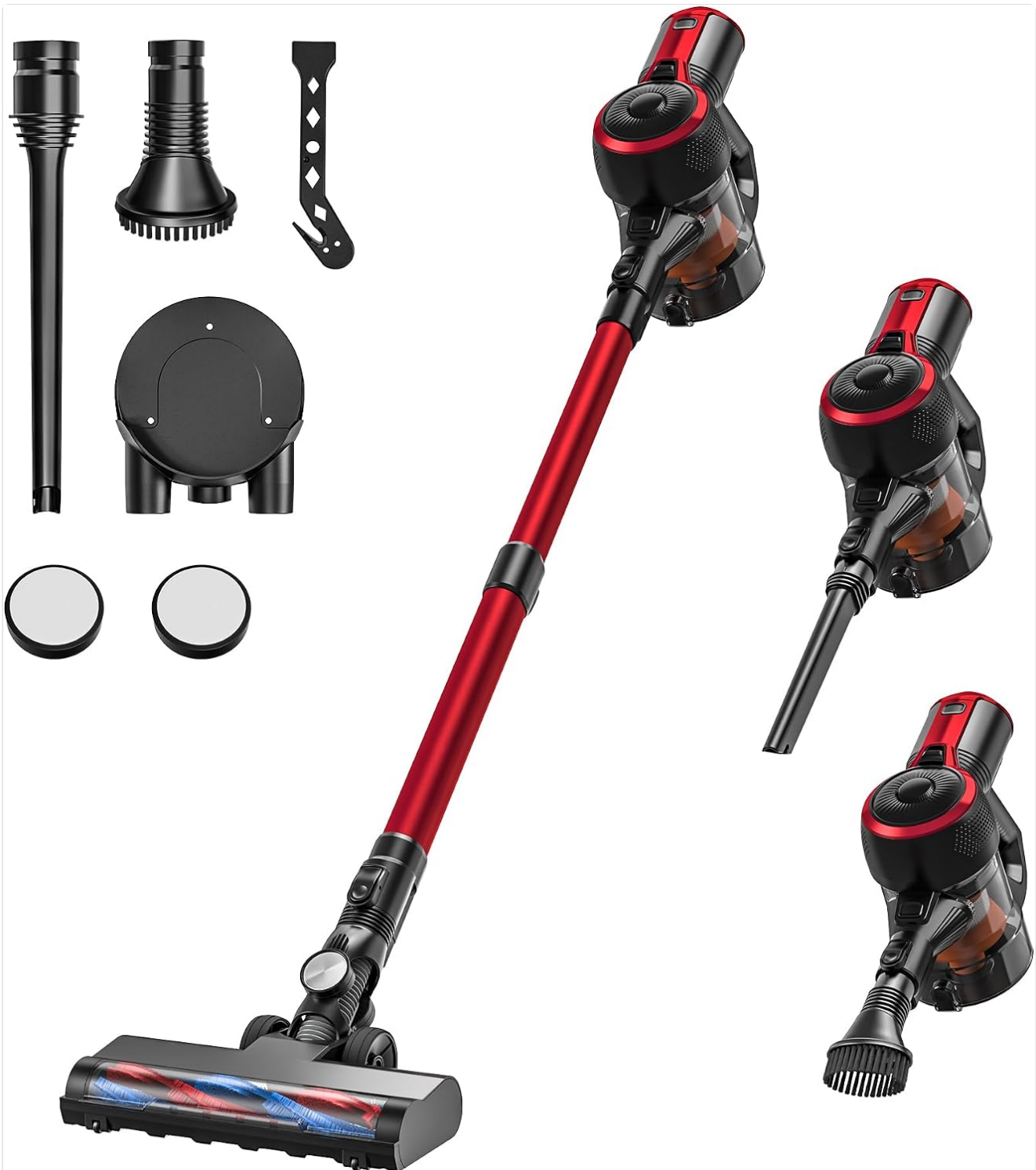
Figure 1: Main components of the CONOPU Cordless Vacuum Cleaner, including the main unit, extension tube, floor brush, crevice tool, and brush attachment.