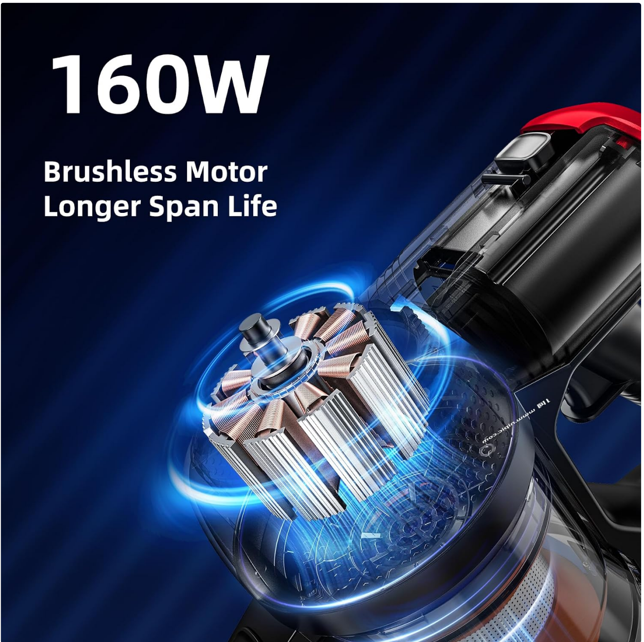
Figure 7: The powerful 160W brushless motor provides efficient and long-lasting performance.