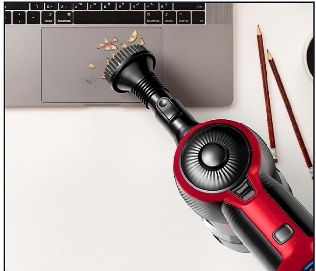
Figure 3: Different nozzles are included to fit various cleaning tasks, from floors to tight spaces and upholstery.

The vacuum cleaner comes with multiple suction nozzles for different tasks: