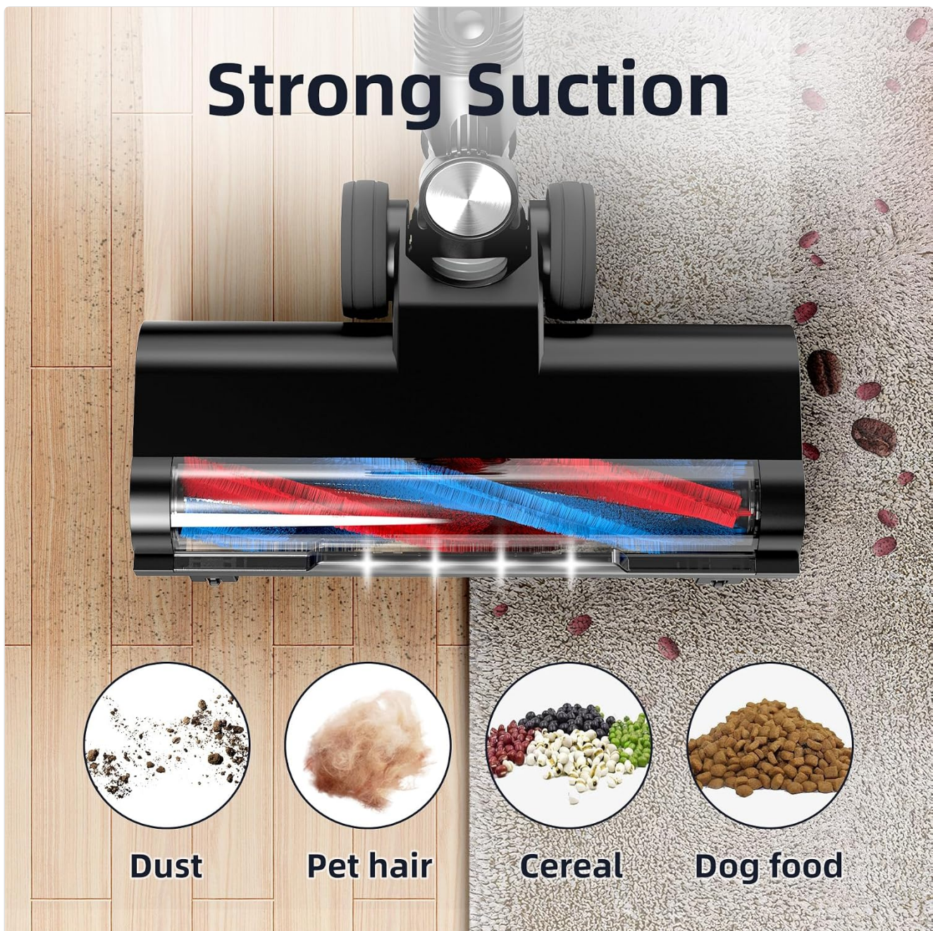
Figure 5: The powerful suction effectively cleans various types of debris, including dust, pet hair, and food particles.