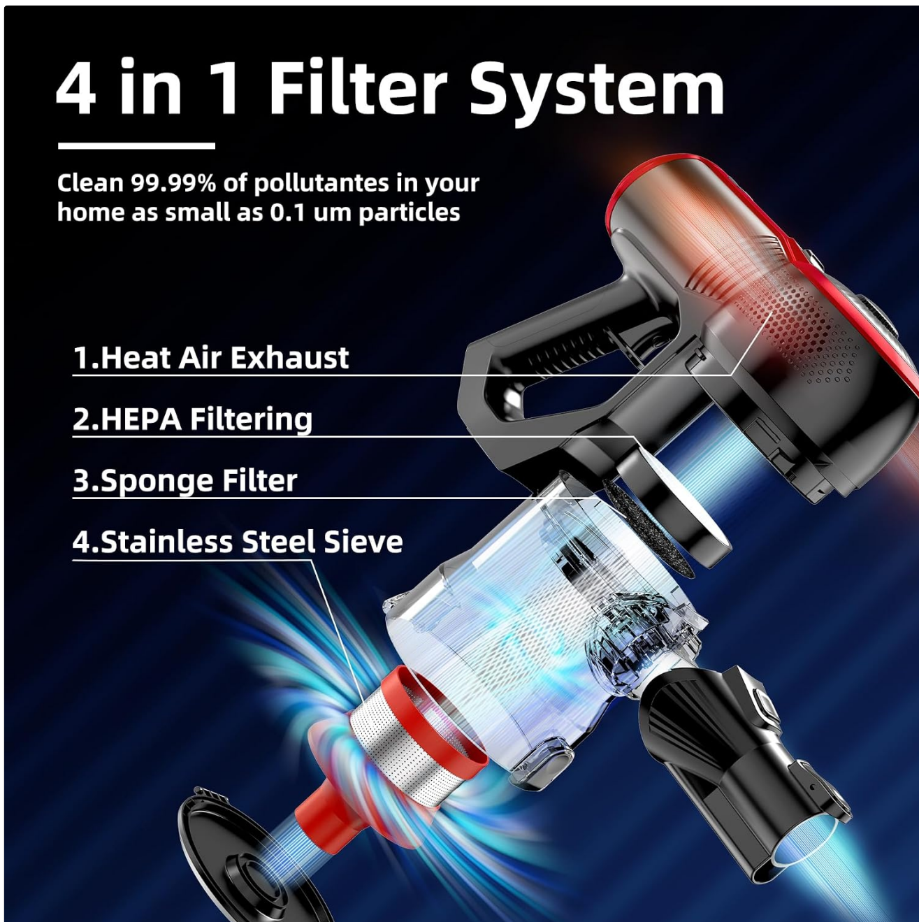
Figure 6: The 4-in-1 filter system ensures thorough air purification.

The vacuum cleaner features a 4-stage HEPA filter system. Clean the filters regularly to maintain suction power and air quality.