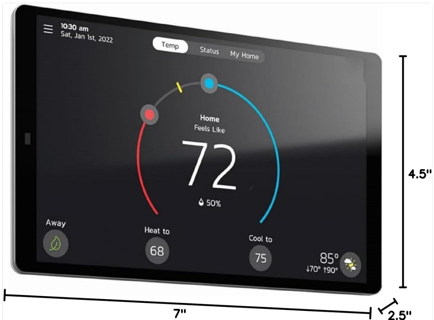
Figure 2: Lennox S40 Smart Thermostat with dimensions (2.5"D x 7"W x 4.5"H)

Ensure adequate space for installation, considering the thermostat's dimensions.