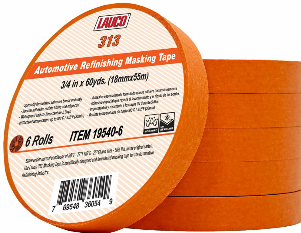
Figure 1.1: LAUCO Orange Automotive Refinishing Masking Tape (0.75 inch, 6 Rolls)