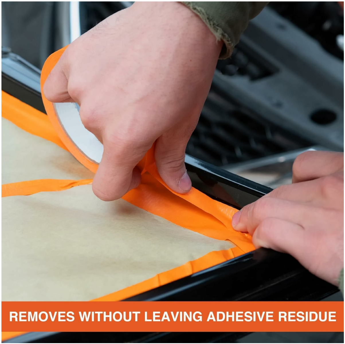
Figure 3.3: Tape removal without leaving adhesive residue