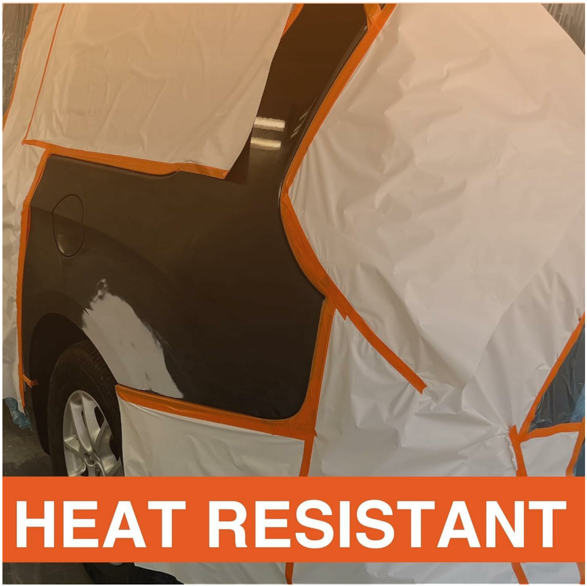
Figure 3.1: Tape applied to a vehicle, demonstrating heat resistance