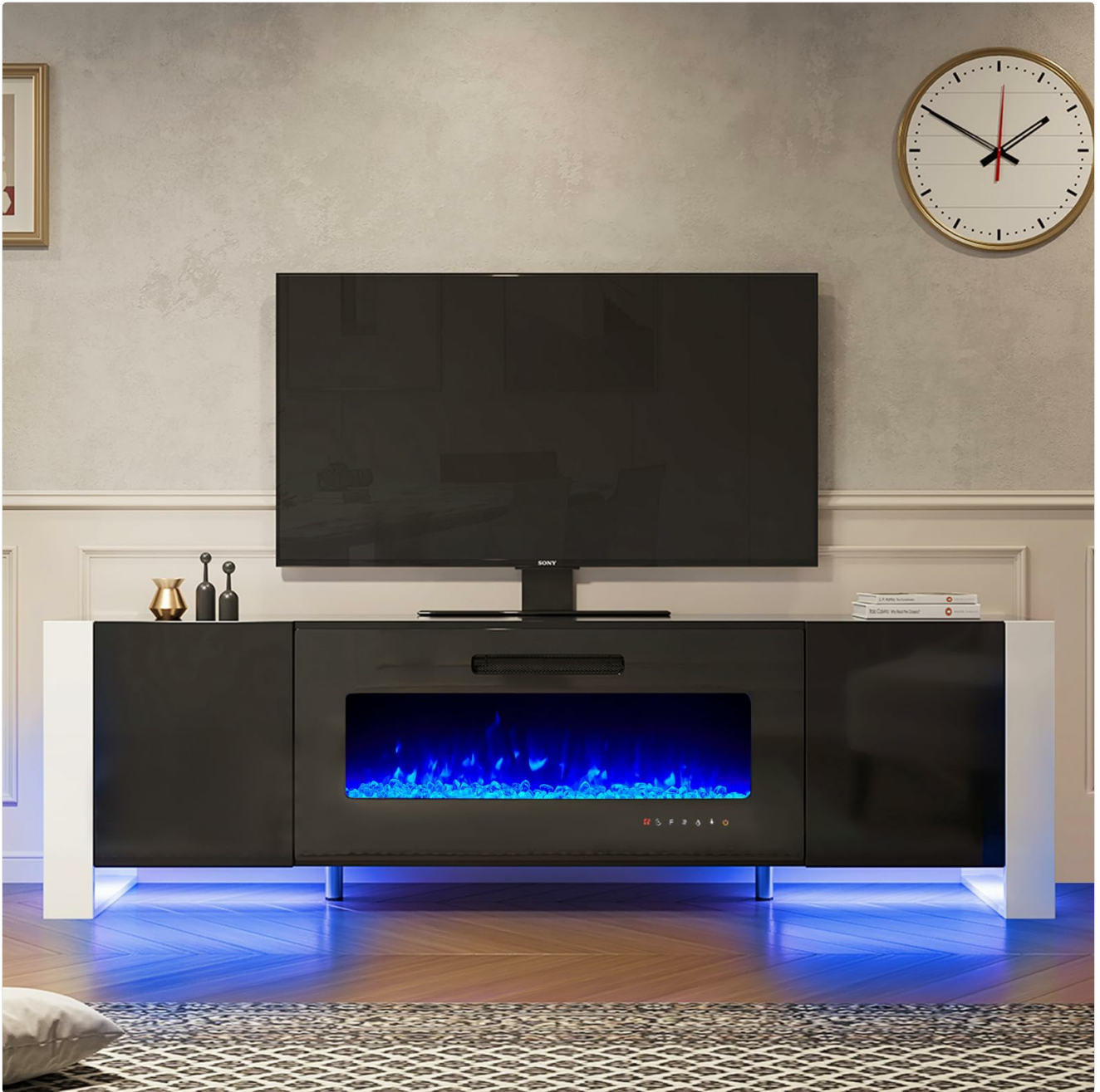
Image: The 36-inch electric fireplace unit, showing the remote control and the touch panel with controls for flame, LED lights, power, heater, and timer.