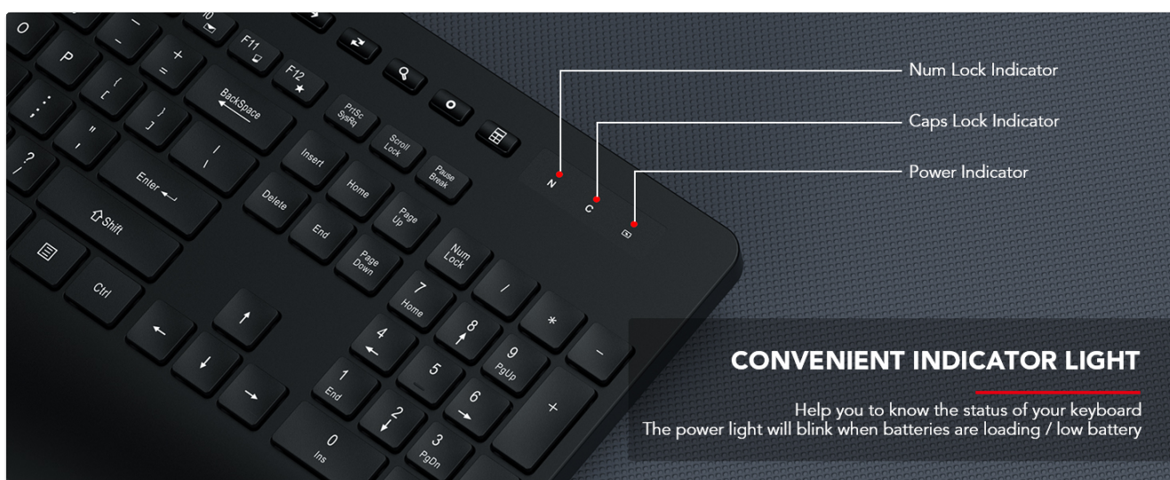
Figure 9: Keyboard Hotkeys and Mouse Buttons