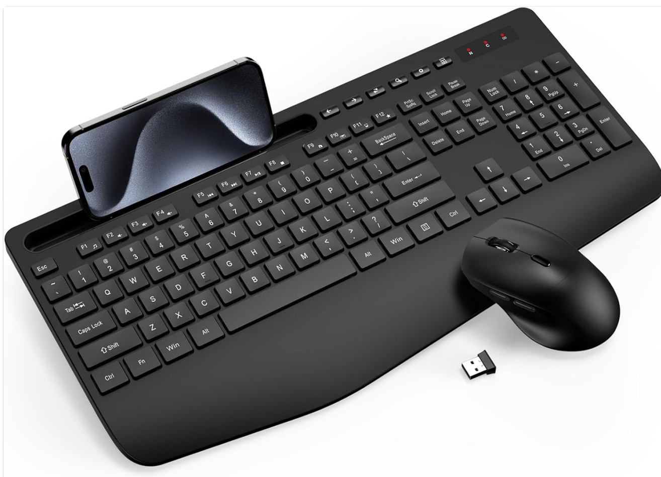
Figure 1: Trueque Wireless Keyboard and Mouse Combo

Thank you for choosing the Trueque Wireless Keyboard and Mouse Combo. This full-sized ergonomic combo is designed for comfort and efficiency, featuring a wrist rest, phone holder, silent keys, and reliable 2.4GHz wireless connectivity. This manual provides detailed instructions for setup, operation, maintenance, and troubleshooting to ensure optimal performance and longevity of your device.