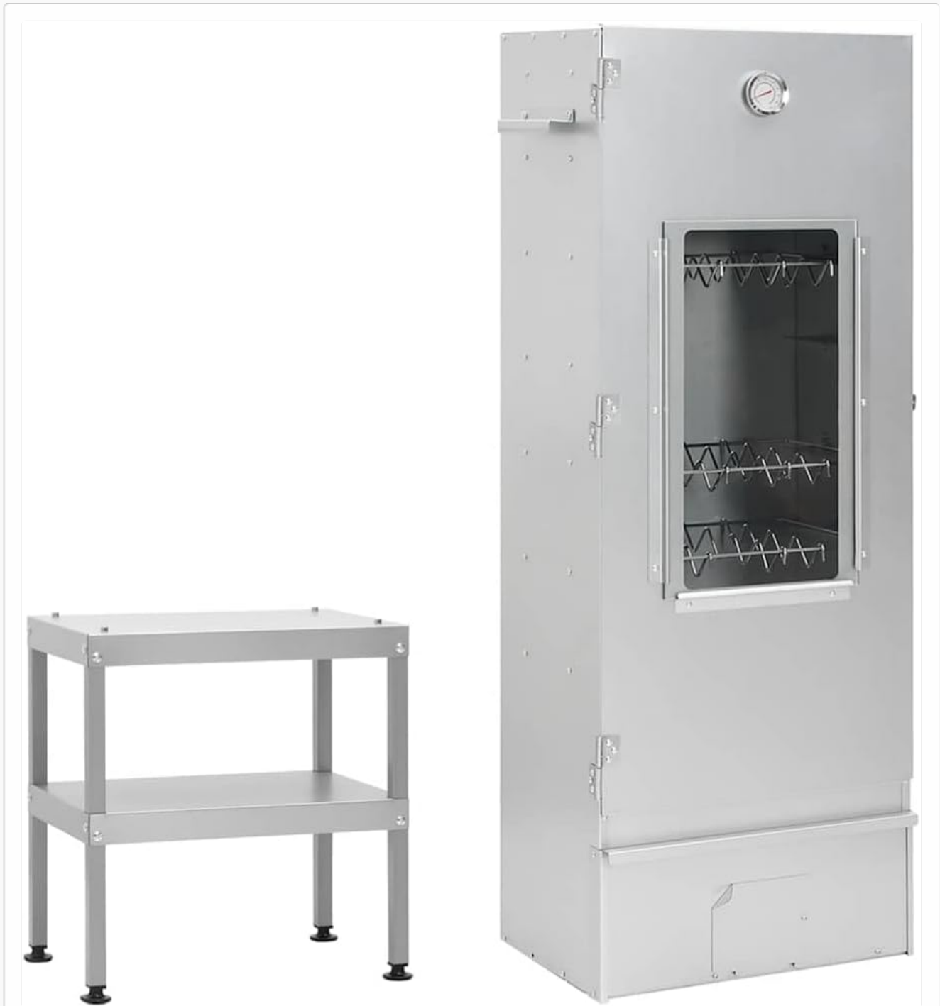
Figure 2.1: Overall view of the vidaXL BBQ Oven Smoker and its accompanying prep table. The smoker is a tall, rectangular unit with a front-facing glass window and a thermometer at the top. The table is a smaller, two-tiered rectangular structure.