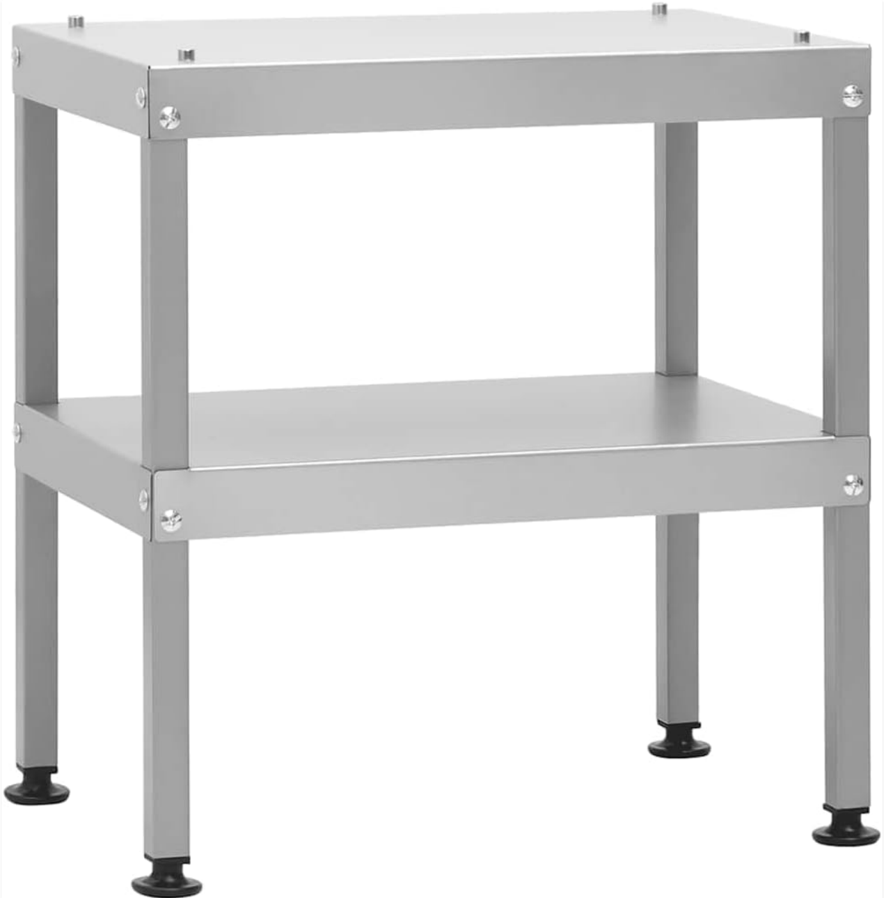
Figure 2.7: The galvanized steel prep table, featuring two shelves and adjustable feet for stability. This table provides a convenient surface next to the smoker.