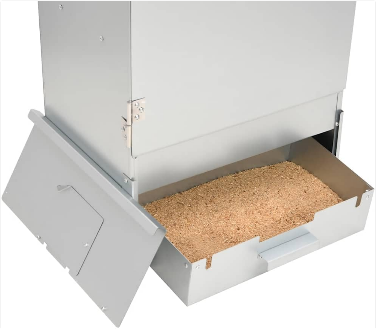
Figure 2.6: The lower section of the smoker with the wood chip drawer pulled out, showing wood chips inside. This drawer is used to hold the fuel for smoking.