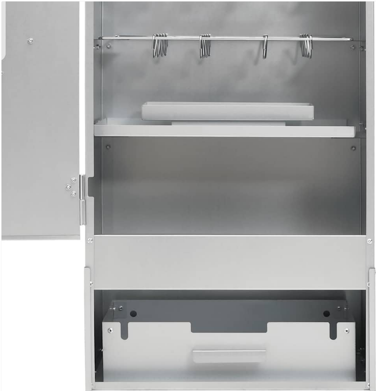
Figure 2.4: A closer look at the upper interior of the smoker, showing the S-shaped hooks for hanging food and the zinc-plated grids for laying items flat.