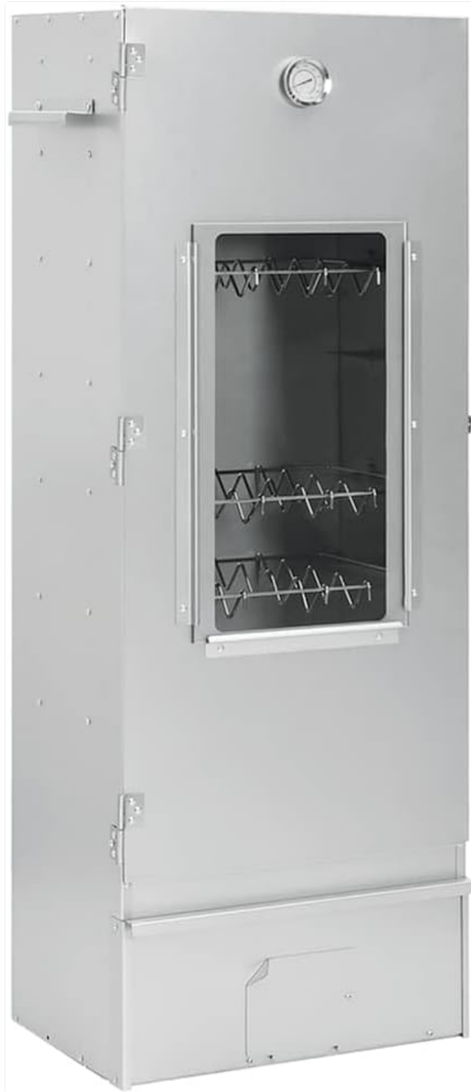
Figure 2.2: Detailed front view of the BBQ Oven Smoker, highlighting the glass observation window and the integrated temperature gauge located on the top panel.