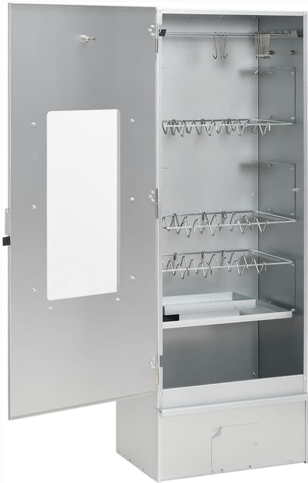
Figure 2.3: The smoker with its door open, revealing the internal structure including multiple levels of racks and hanging hooks for various smoking configurations.