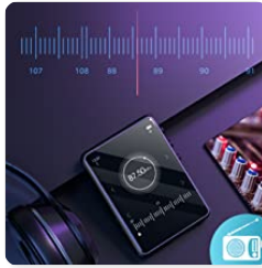
Image: A square icon representing the FM Radio function, featuring a radio antenna symbol.