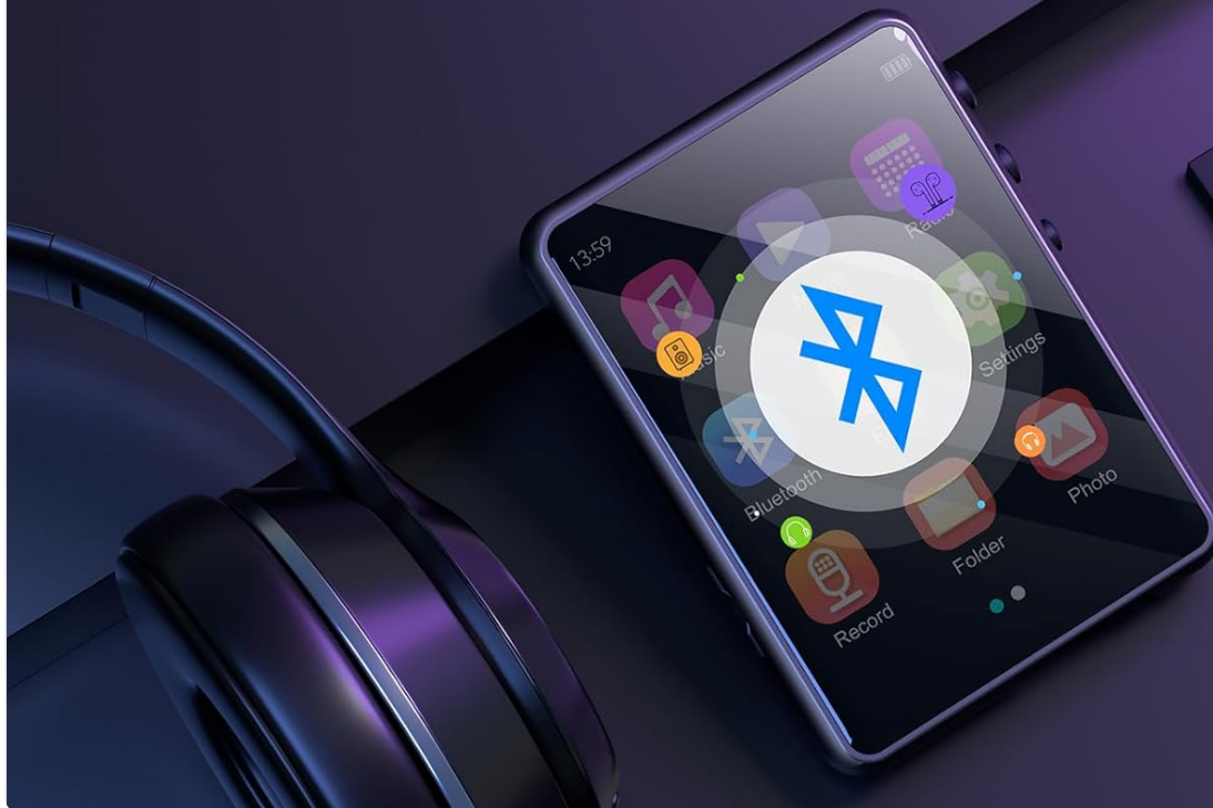
Image: The Conrain MP3 Player with a Bluetooth icon prominently displayed, surrounded by images of Bluetooth headphones, earbuds, and a speaker, illustrating its universal compatibility with Bluetooth 5.3 for stable and faster connections.