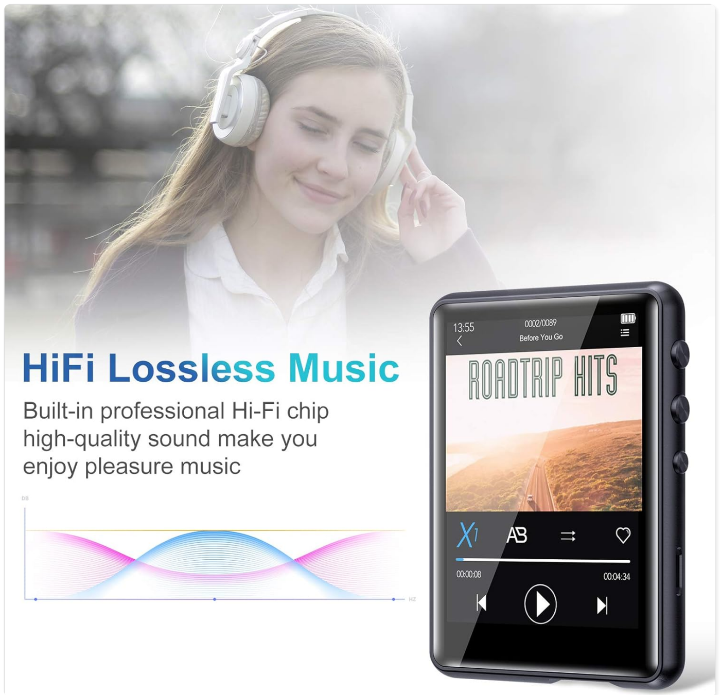
Image: A hand holding the Conrain MP3 Player, which displays a music playback screen with album art and controls. An overlay emphasizes "HiFi Lossless Music" and shows a sound wave graphic, indicating high-quality audio output.