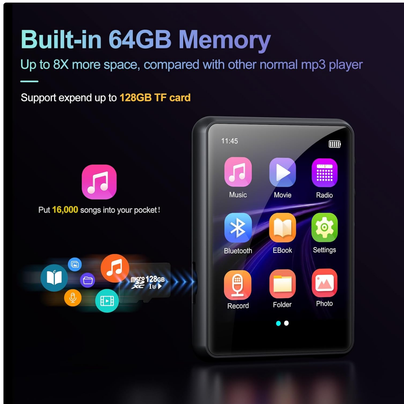
Image: The Conrain MP3 Player displaying its main menu, with an overlay indicating "Built-in 64GB Memory" and support for up to a 128GB TF card.

Connect the MP3 player to your computer using the provided Type-C USB cable. The device will appear as a removable disk drive. You can then drag and drop your desired files into the respective folders (e.g., "Music," "Video," "Pictures," "Ebook") on the player.