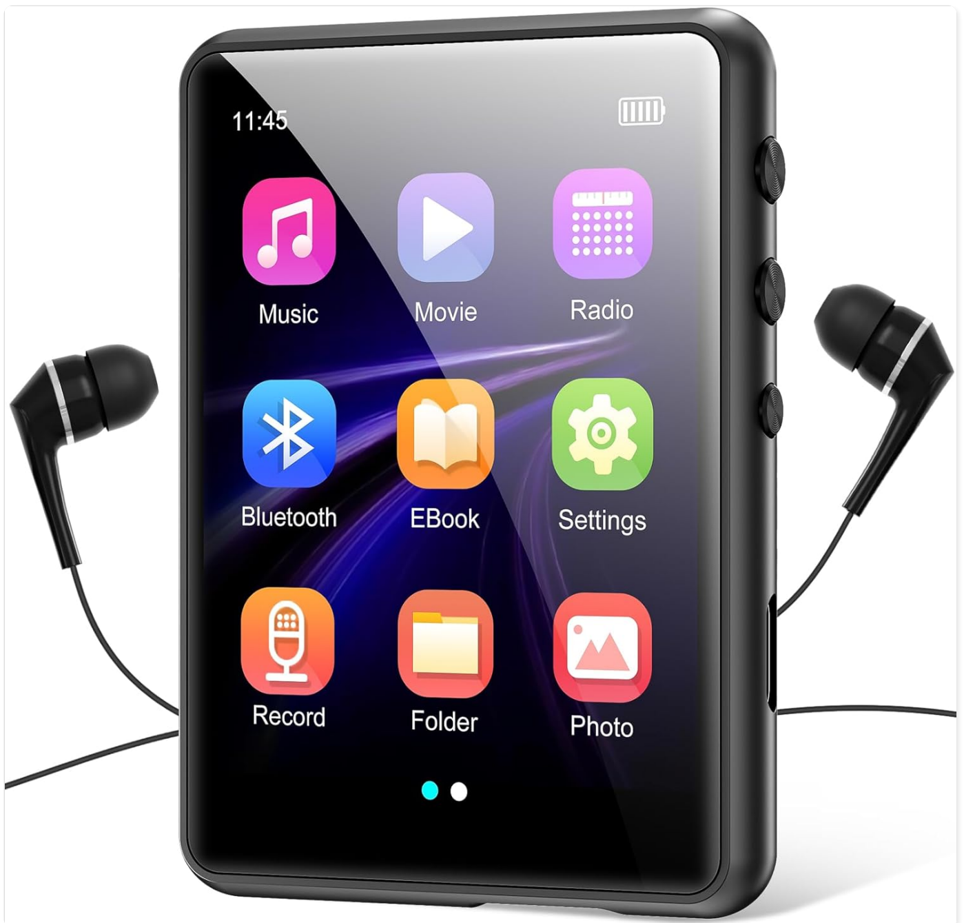
Image: The Conrain MP3 Player, a compact black device with a touchscreen display, shown alongside a pair of black wired earphones. The screen displays various app icons for music, video, radio, Bluetooth, e-book, settings, record, folder, and photo.