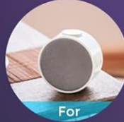
For Bluetooth Speaker