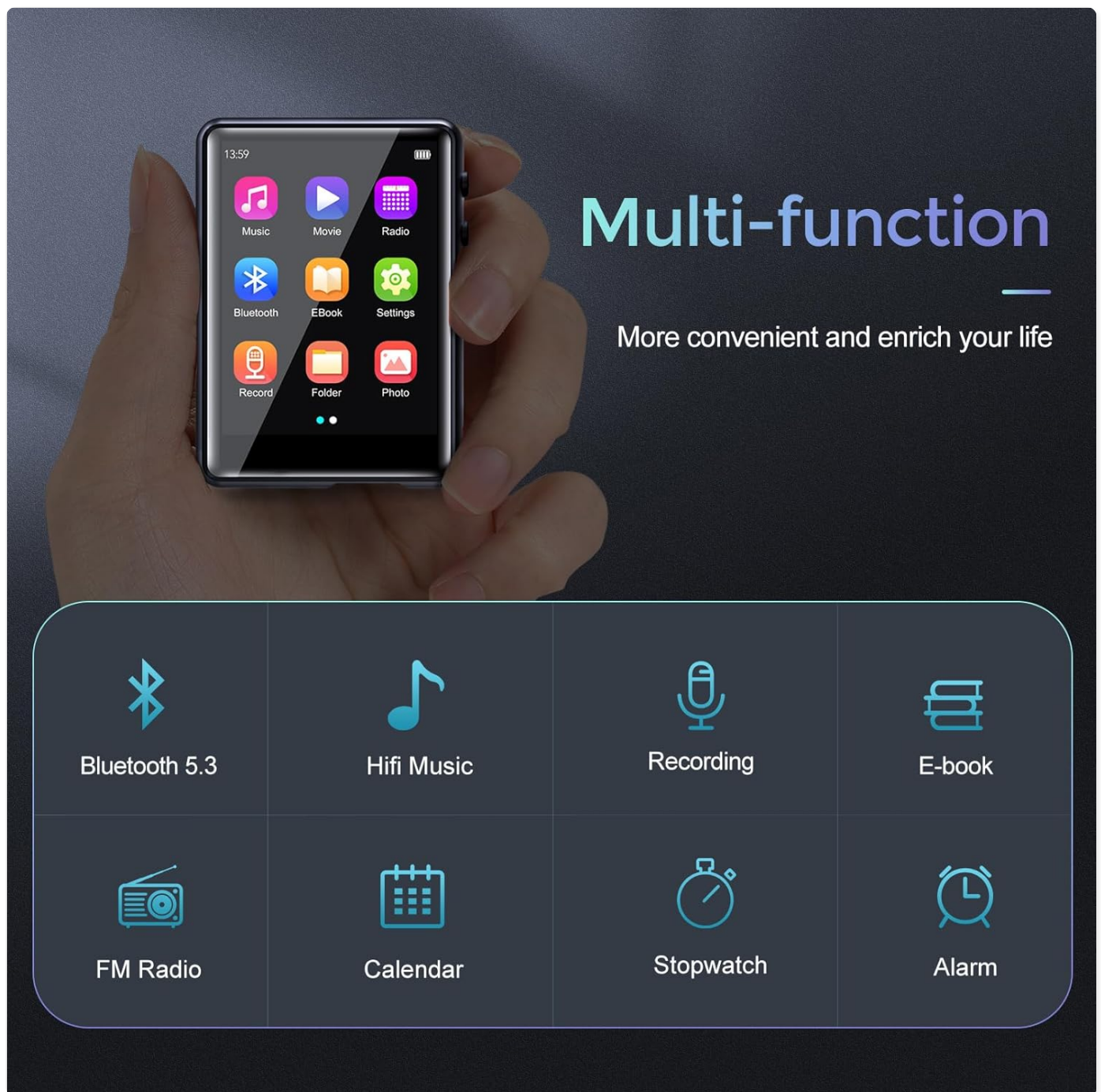
Image: The Conrain MP3 Player held in a hand, displaying its multi-function icons on the touchscreen, including Music, Movie, Radio, Bluetooth, E-book, Settings, Record, Folder, and Photo. An overlay highlights the "Multi-function" capability.

The Conrain MP3 Player features a full touchscreen interface for easy navigation. Tap icons to open applications and swipe to navigate menus.