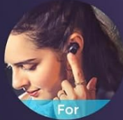
For Bluetooth earbuds