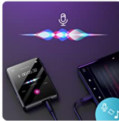
Image: A square icon representing the Voice Recorder function, featuring a microphone symbol.

Tap the "Record" icon to access the voice recorder. You can record lectures, meetings, or personal notes. Recordings are saved in a designated folder on the device.