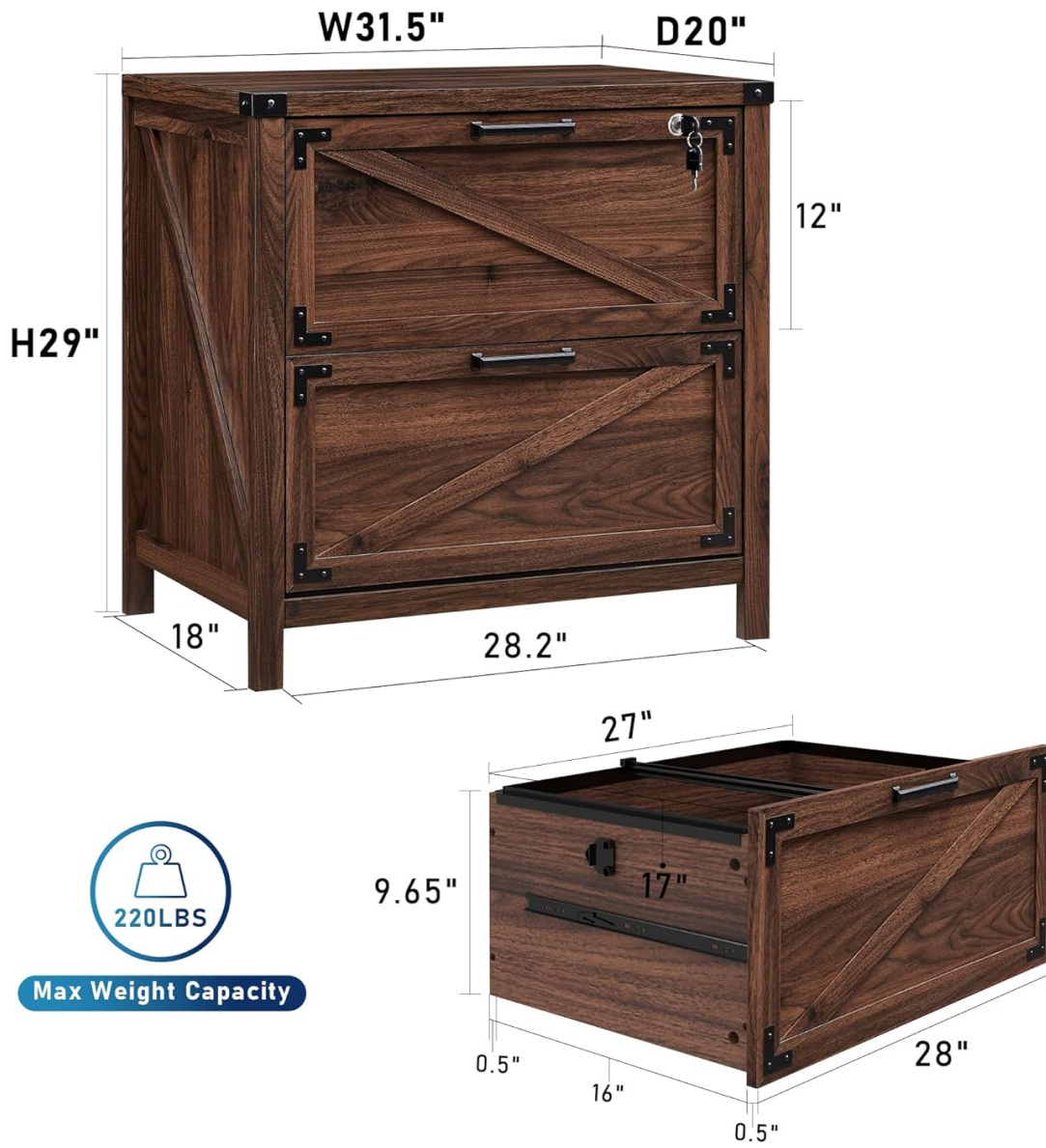
Figure 4.1: Product dimensions and weight capacity. The cabinet measures 31.5"W x 20"D x 29"H and has a maximum weight capacity of 220 lbs.