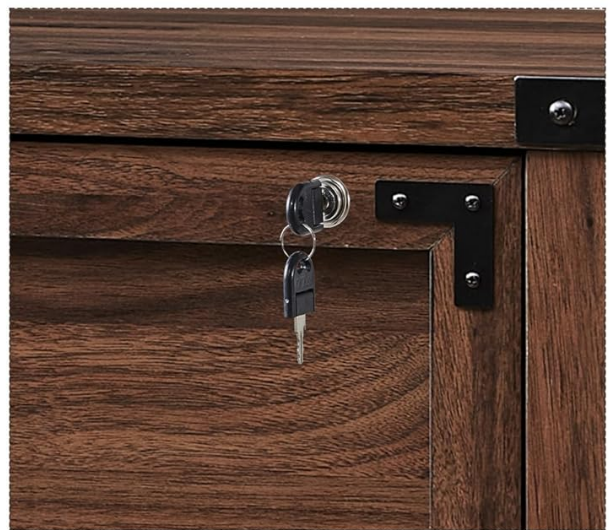
Top Drawer with Lock