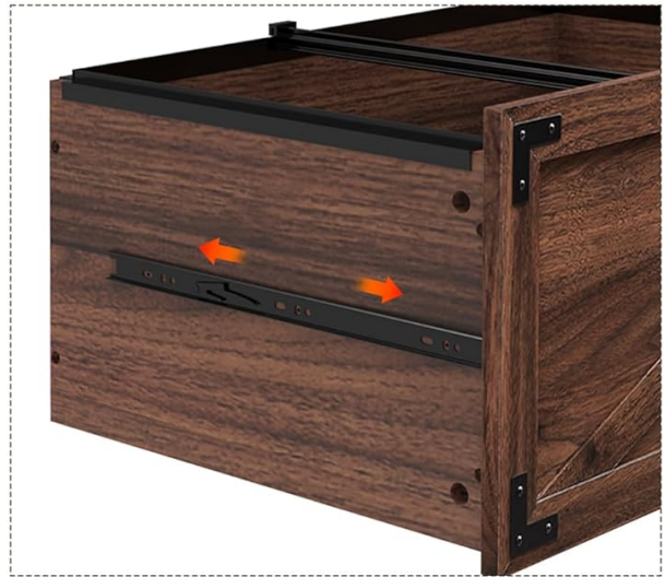
Smooth Sliding Drawer