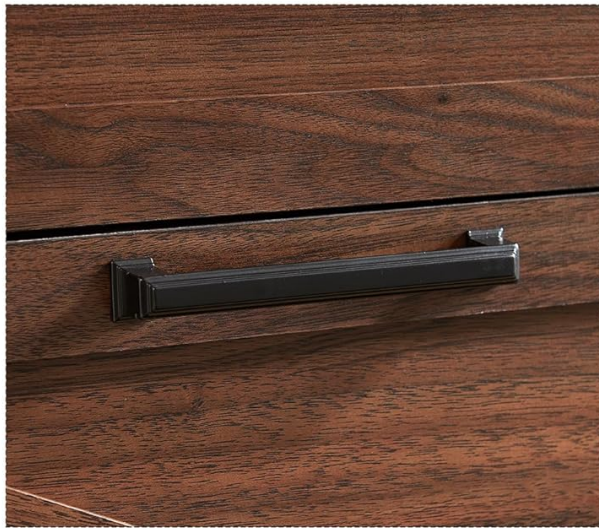
Roman Column-Style Handle