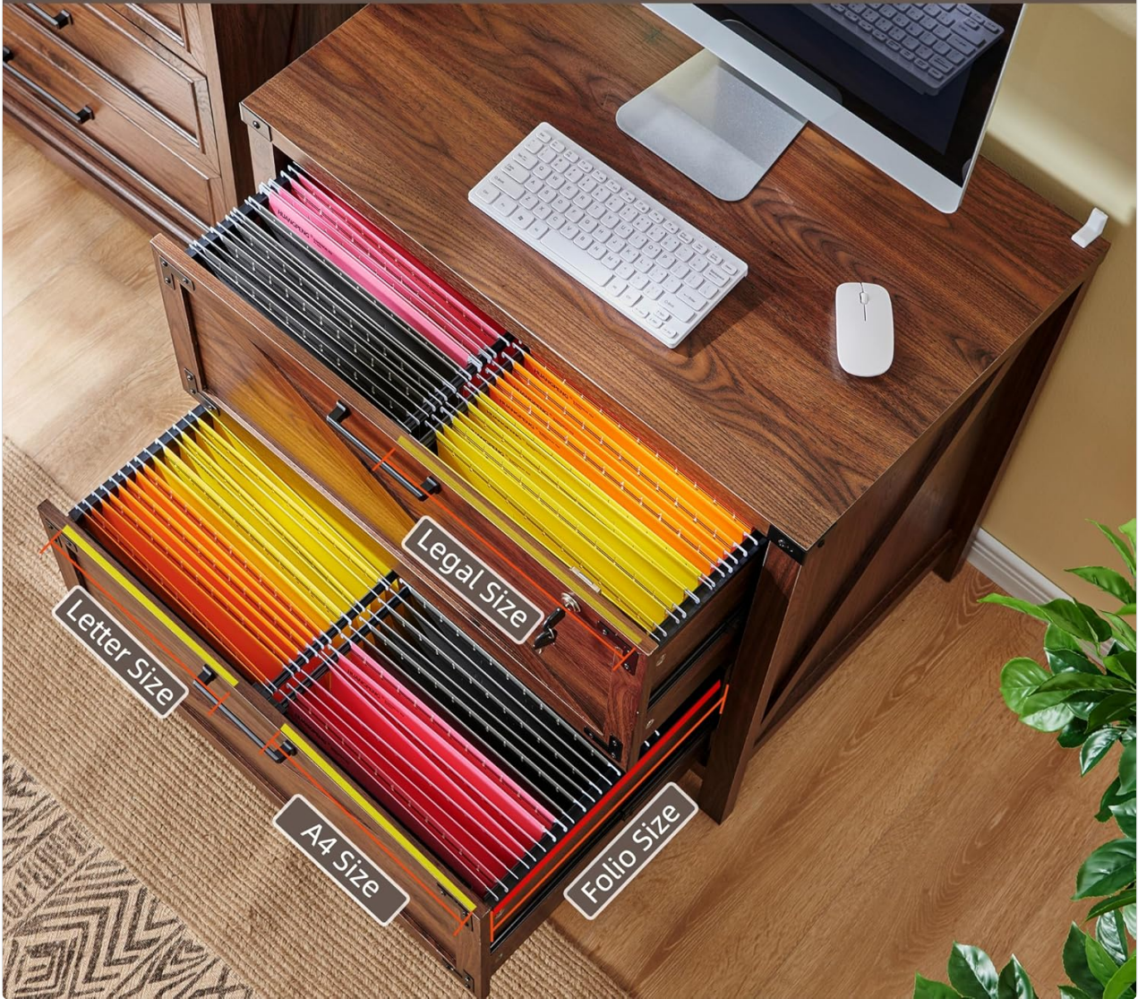
Figure 5.1: Multifunctional use of the drawers, compatible with A4, Letter, Legal, and F4 file sizes.