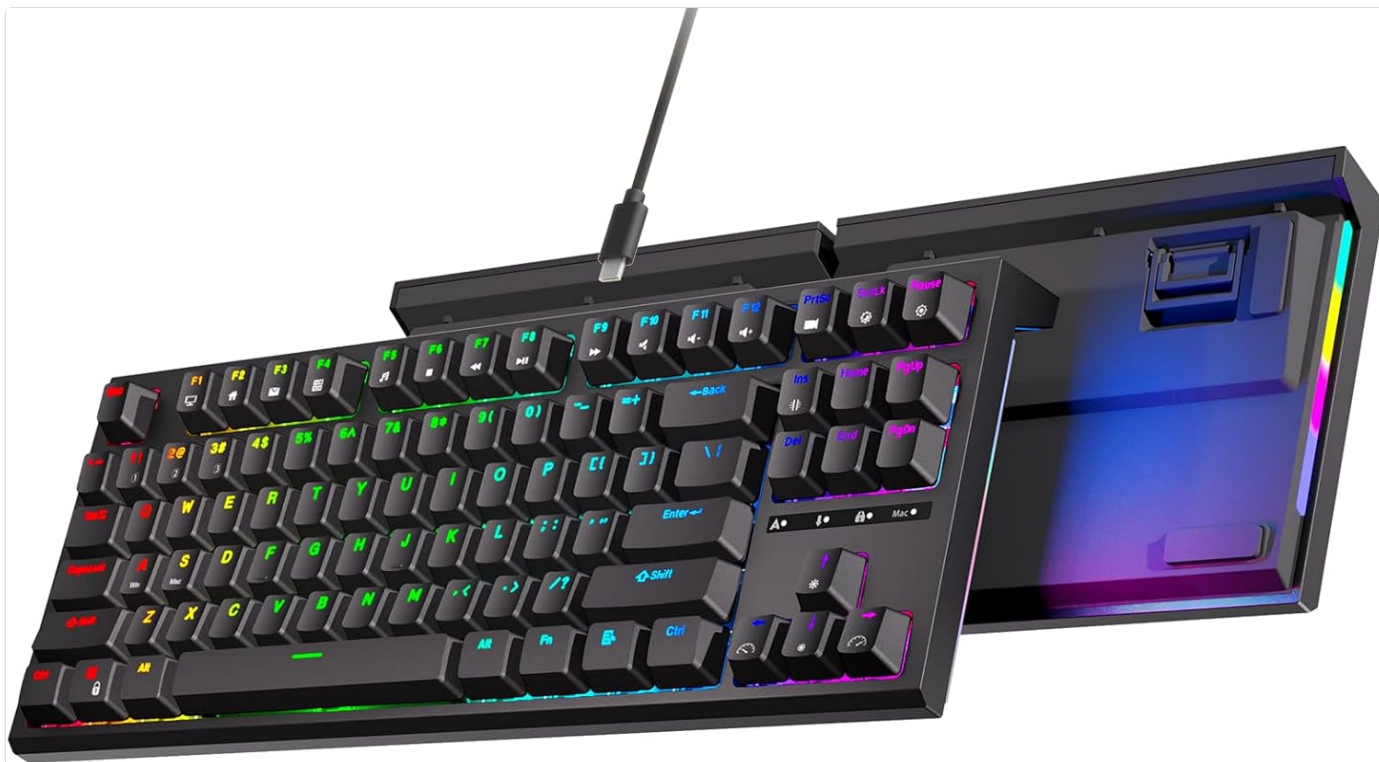
Image: The RK ROYAL KLUDGE R87 Mechanical Keyboard with its detachable USB-C cable connected, showing the wired setup.