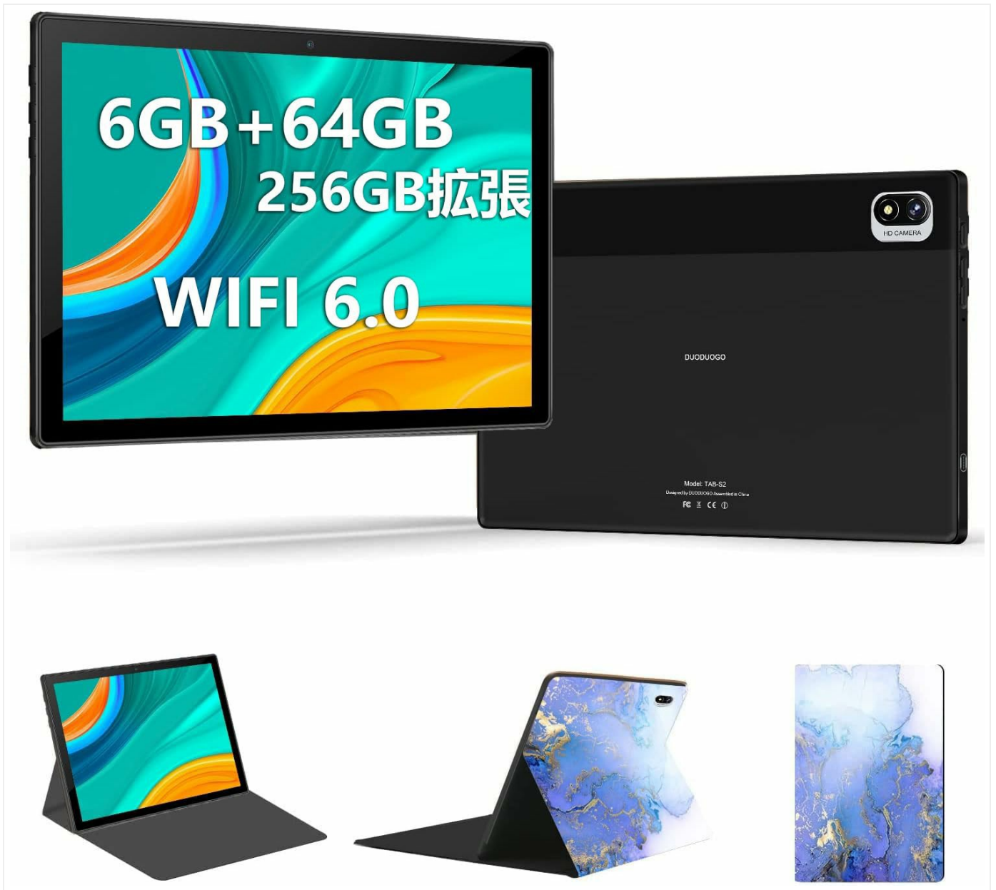
Image: DUODUOGO S2 Tablet and included accessories.