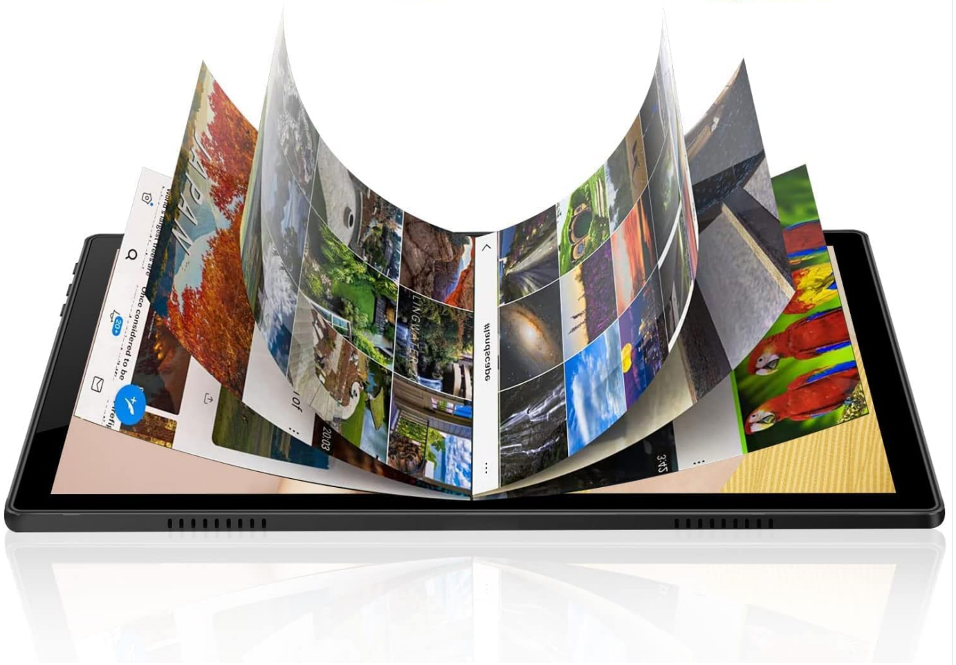
Image: A visual representation of the tablet's memory, showing 6GB RAM, 64GB internal storage (ROM), and the option to expand storage up to 256GB with a TF card.