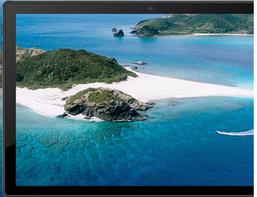
Image: The tablet displaying a high-resolution image, illustrating the 10.1-inch IPS HD screen and indicating the 5MP front and 8MP rear camera capabilities.