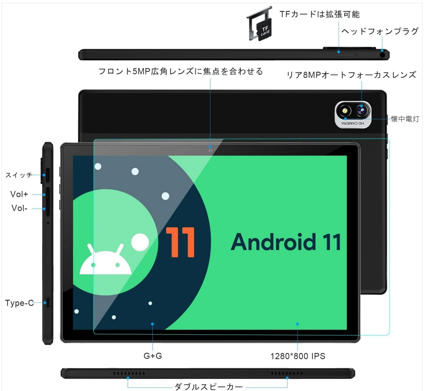
Image: Diagram showing the tablet's side view with labels for the power button, volume buttons (Vol+, Vol-), Type-C port, headphone jack, and TF card slot. The front and rear cameras are also indicated.