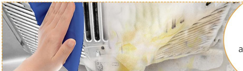
Image: A visual comparison demonstrating the effectiveness of the cleaner on various surfaces, highlighting the transformation from dirty to clean.

Fresh, not pungent, gentle and not harmful to hands