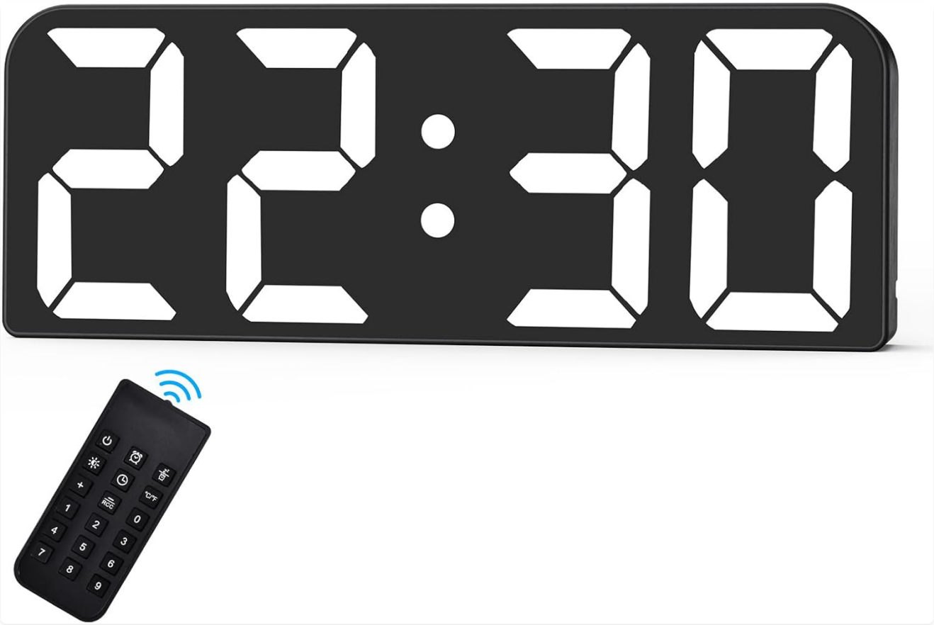
Image: The Meloya Digital Alarm Clock displaying time, accompanied by its remote control.

Thank you for choosing the Meloya Digital Alarm Clock. This 9.6-inch LED clock features a large, easy-to-read display, remote control operation, three adjustable brightness levels, and multiple alarm functions. It is designed for versatile placement, suitable for both wall mounting and desk use in various environments such as bedrooms, living rooms, home offices, and kitchens. This manual provides detailed instructions to help you set up, operate, and maintain your new digital clock.