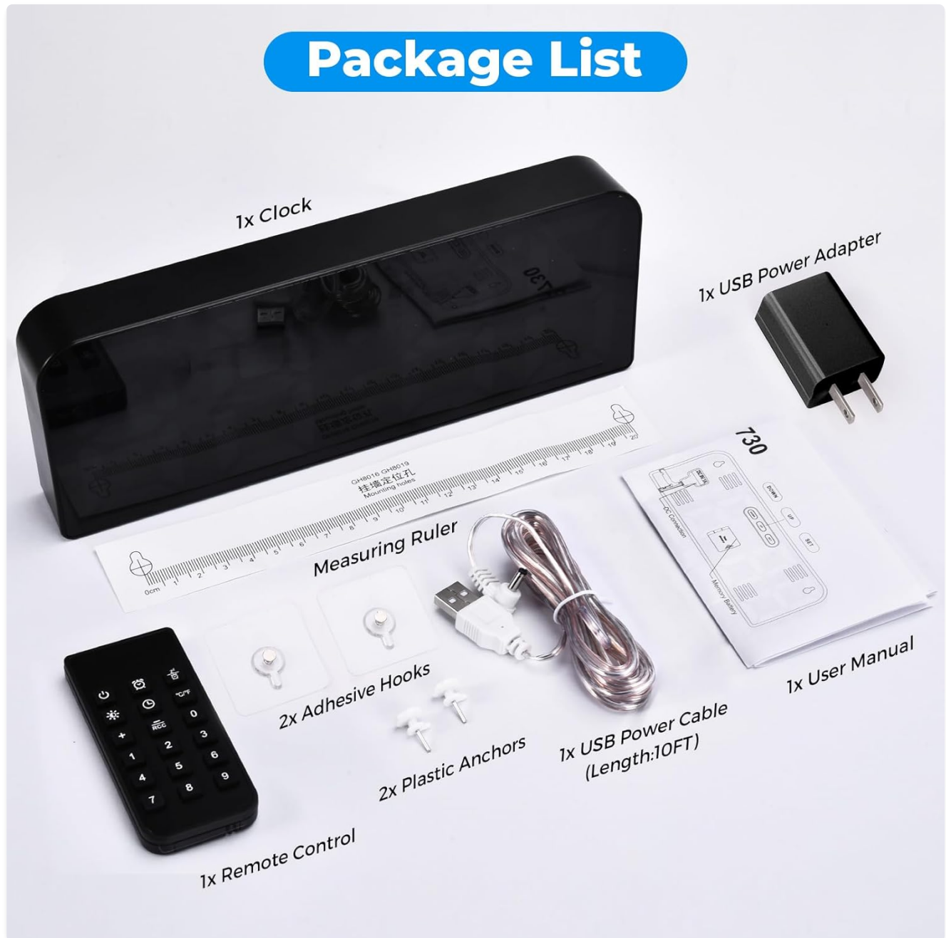
Image: All components included in the Meloya Digital Alarm Clock package, laid out clearly.