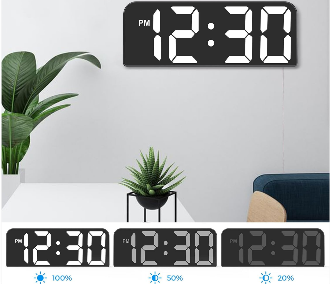
Image: Detailed view of the clock's display showing the visual difference between 100%, 50%, and 20% brightness settings.