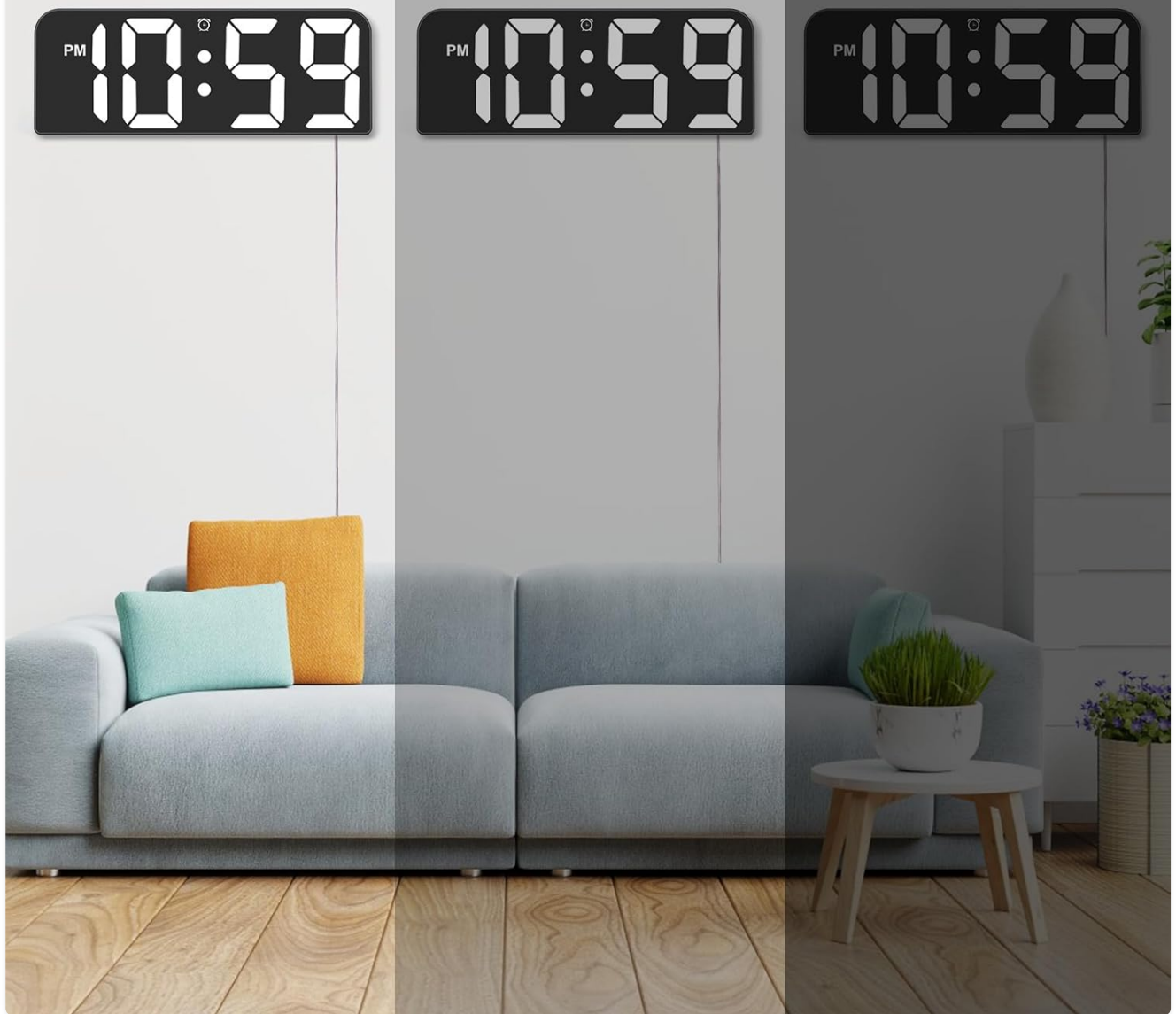
Image: The clock demonstrating its three adjustable brightness levels in a living room environment.