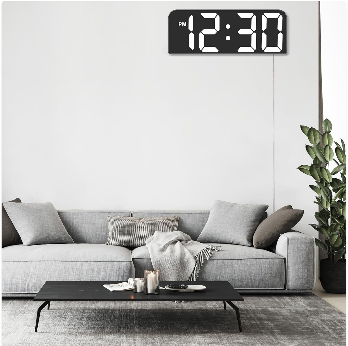
Image: The digital clock displayed on a wall, demonstrating its visual integration into a living space.