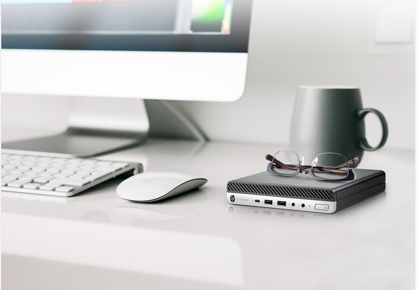
Figure 1: The HP EliteDesk 800 G4 Mini PC in a typical office setup. This image illustrates the compact size of the desktop, making it suitable for various environments.

Super performance, fully competent for multi-page and multi-software simultaneous office, light, small and efficient.