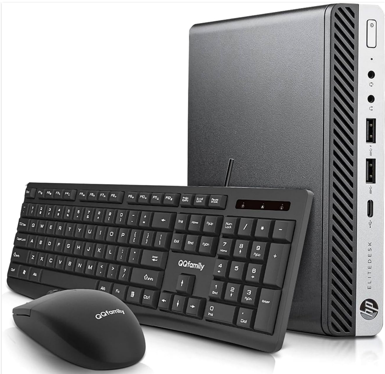
Figure 2: Contents of the HP EliteDesk 800 G4 Mini package, including the desktop unit, wired keyboard, and wired mouse. The USB WiFi and Bluetooth adapter is also included for wireless connectivity.