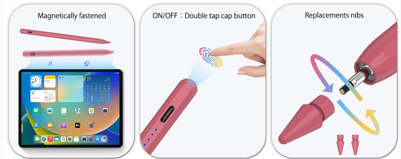
Figure 8: Understanding the power indicator lights.