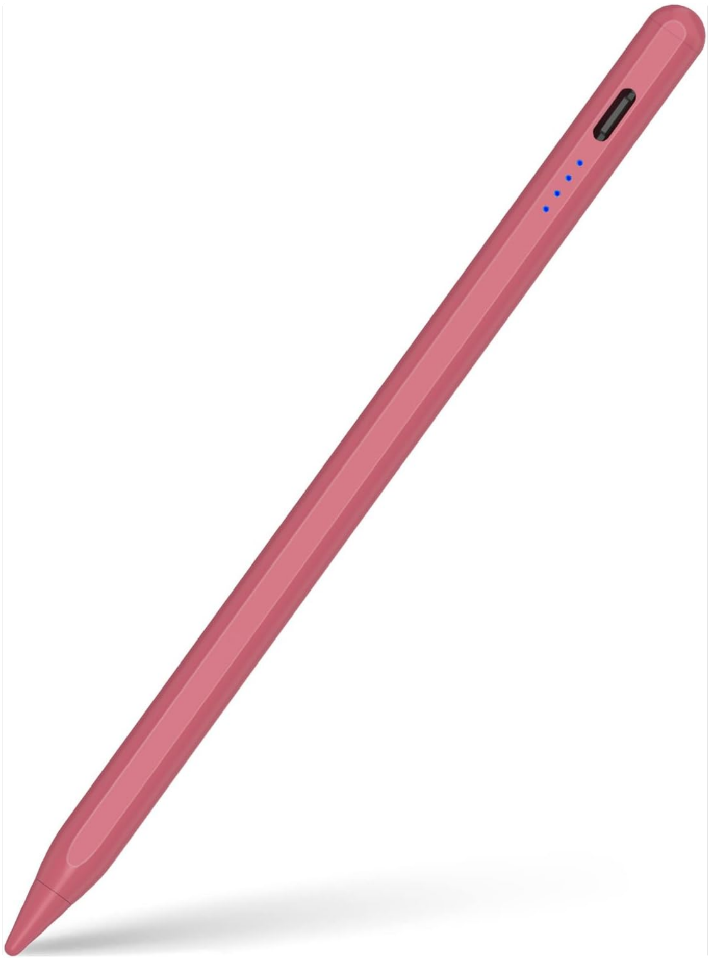
Figure 1: The QDSYLQ Stylus Pen, showcasing its sleek design and integrated power indicator lights.