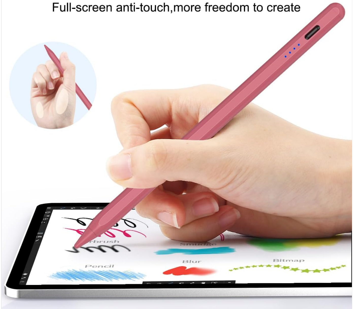
Figure 5: Illustrating how tilt sensitivity affects line thickness.

Full-screen anti-touch, more freedom to create