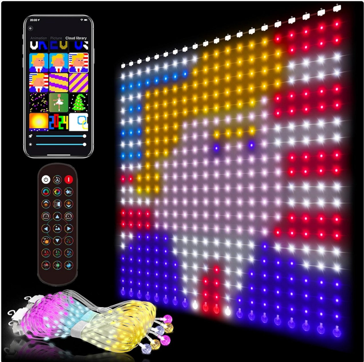
Image: The Smart Curtain Lights displaying a heart pattern, with the remote control and mobile app interface visible, illustrating control options.