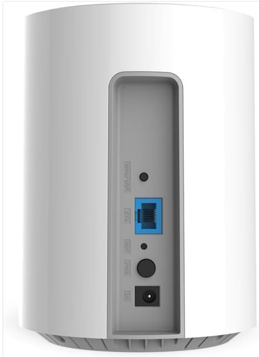
Figure 2: Rear view of the Greenpacket 4G LTE Cat.6 Router, showing the WPS/Wi-Fi button, Ethernet port, Reset button, Power button, and DC power input.