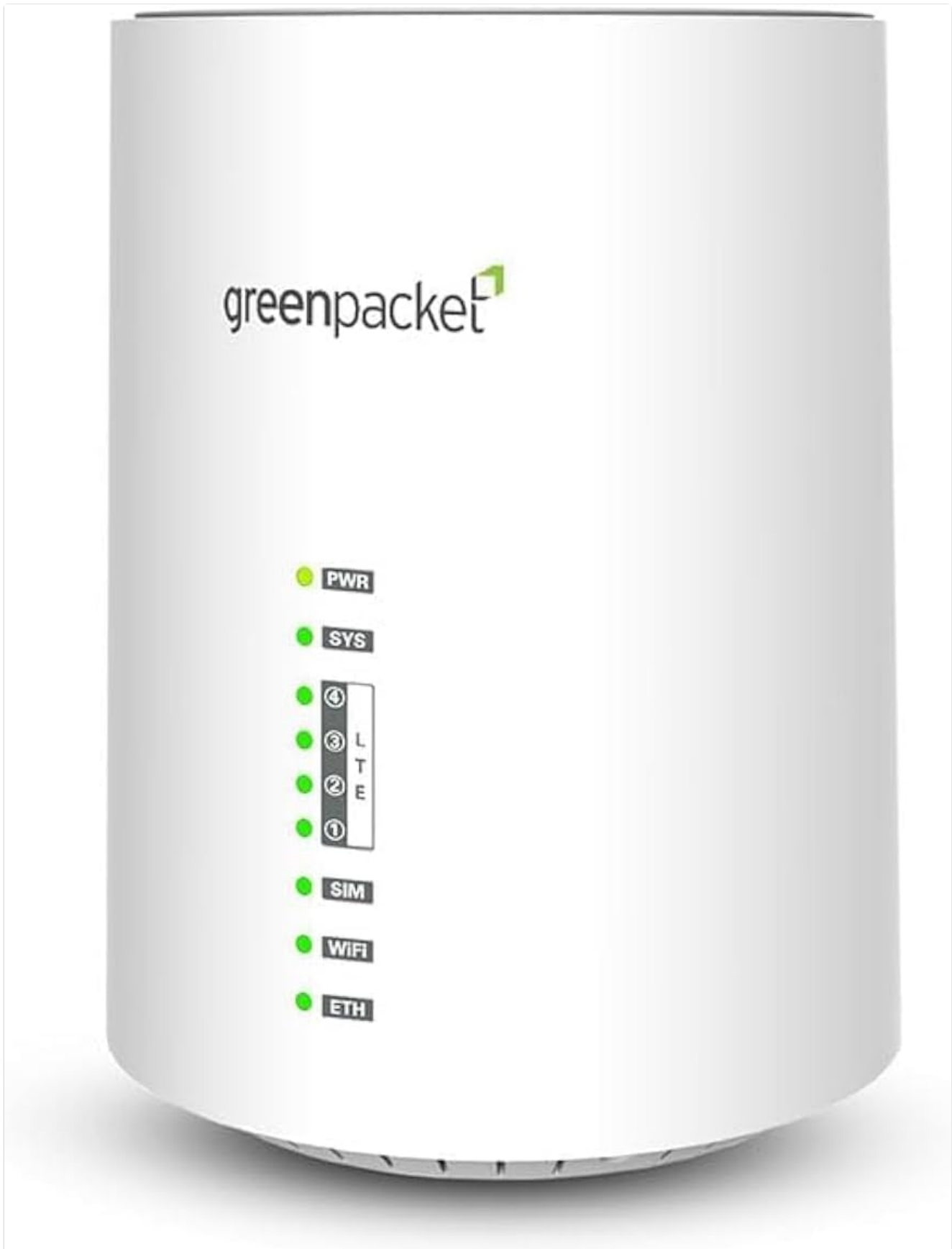
Figure 1: Front view of the Greenpacket 4G LTE Cat.6 Router, showing the LED indicators for Power, System, LTE signal strength, SIM status, Wi-Fi, and Ethernet.