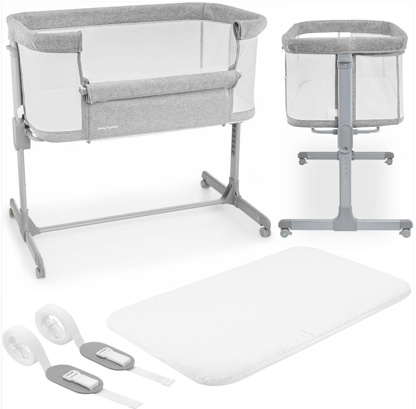
Image 4.1: Overview of Moby-System LUNA bassinet components, including the main frame, mattress, and attachment straps.