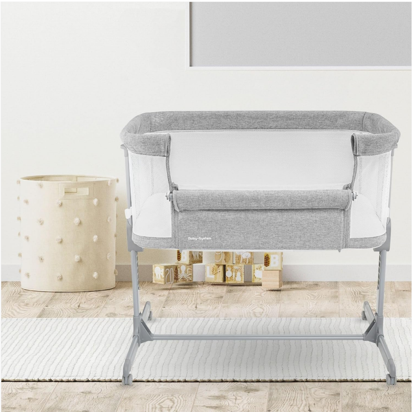
Image 4.2: The Moby-System LUNA bassinet fully assembled and positioned next to an adult bed, demonstrating its co-sleeper functionality.