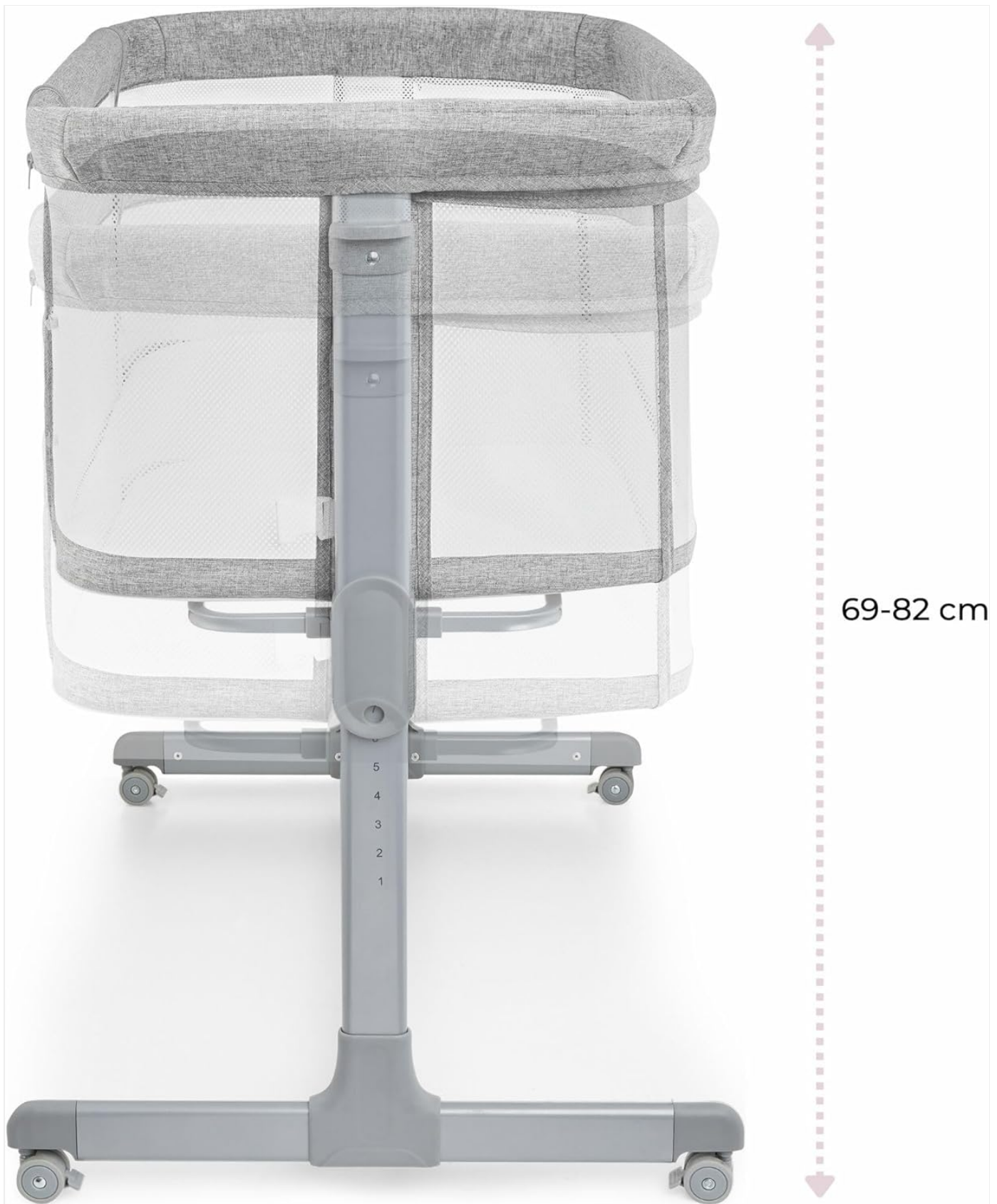
Image 8.1: Dimensional overview of the Moby-System LUNA bassinet, showing length, width, and adjustable height.