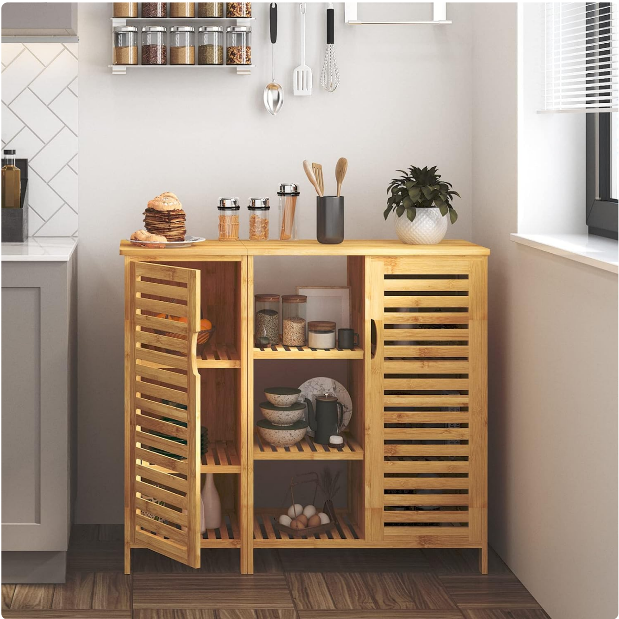
Image 1.1: The SogesHome 4-Tier Bamboo Bathroom Storage Cabinet, showcasing its natural bamboo finish and dual storage compartments.