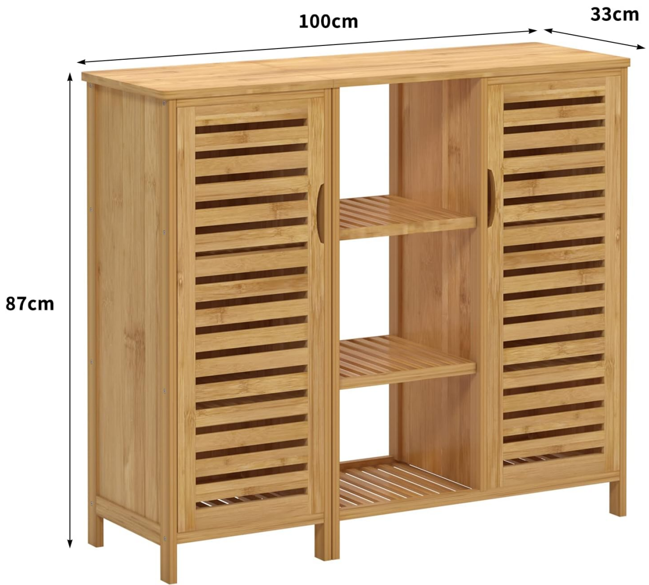
Image 4.1: Illustration of the cabinet's dimensions and its potential for modular arrangement, showing two units combined or separated.