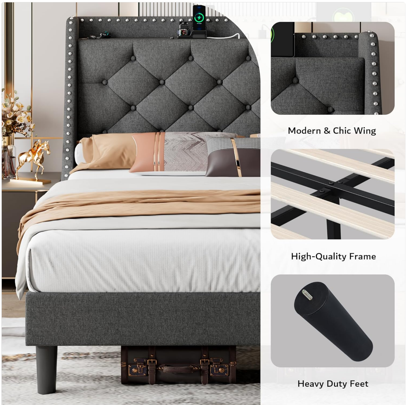
Figure 8.1: Key structural features including the high-quality frame and heavy-duty support feet.