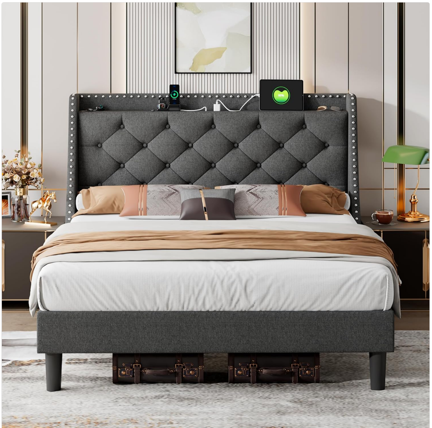
Figure 1.1: Fully assembled iPormis Queen Bed Frame with its wingback headboard and integrated charging station.