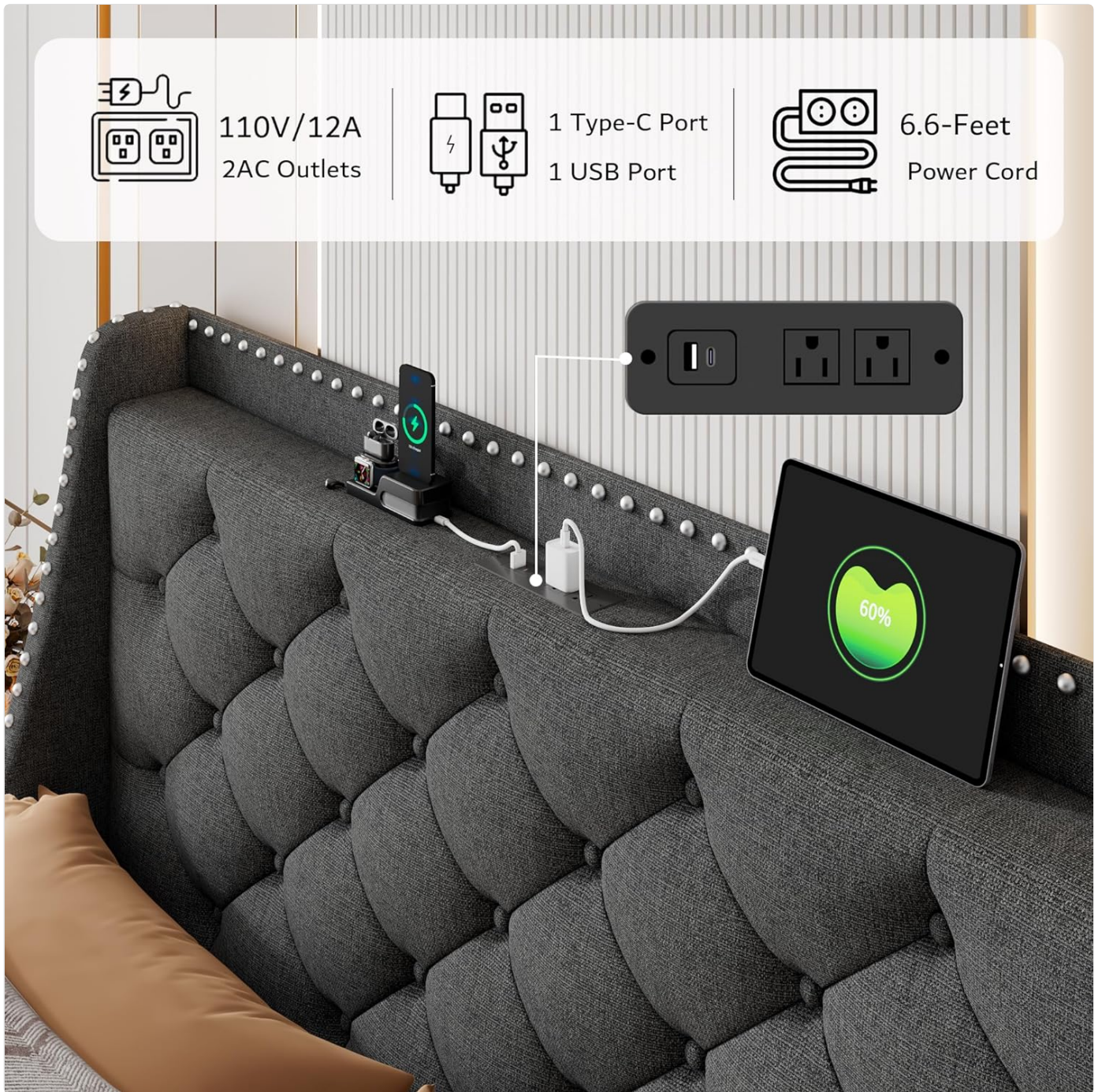
Figure 5.1: Detailed view of the charging station, showing the power outlets and USB ports.

The headboard features a built-in charging station with 2 AC outlets, 1 Type-C port, and 1 USB port. Simply plug your devices into the appropriate ports on the headboard's top shelf for convenient charging.