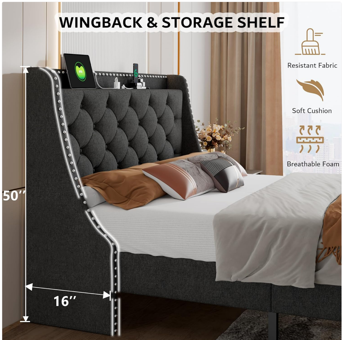
Figure 4.1: The wingback headboard design, highlighting the storage shelf and upholstered finish.

Align the side rails (B, C) with the pre-drilled holes on the headboard (A). Secure them using the appropriate bolts and washers from the hardware pack (H). Do not fully tighten bolts until all major components are connected.