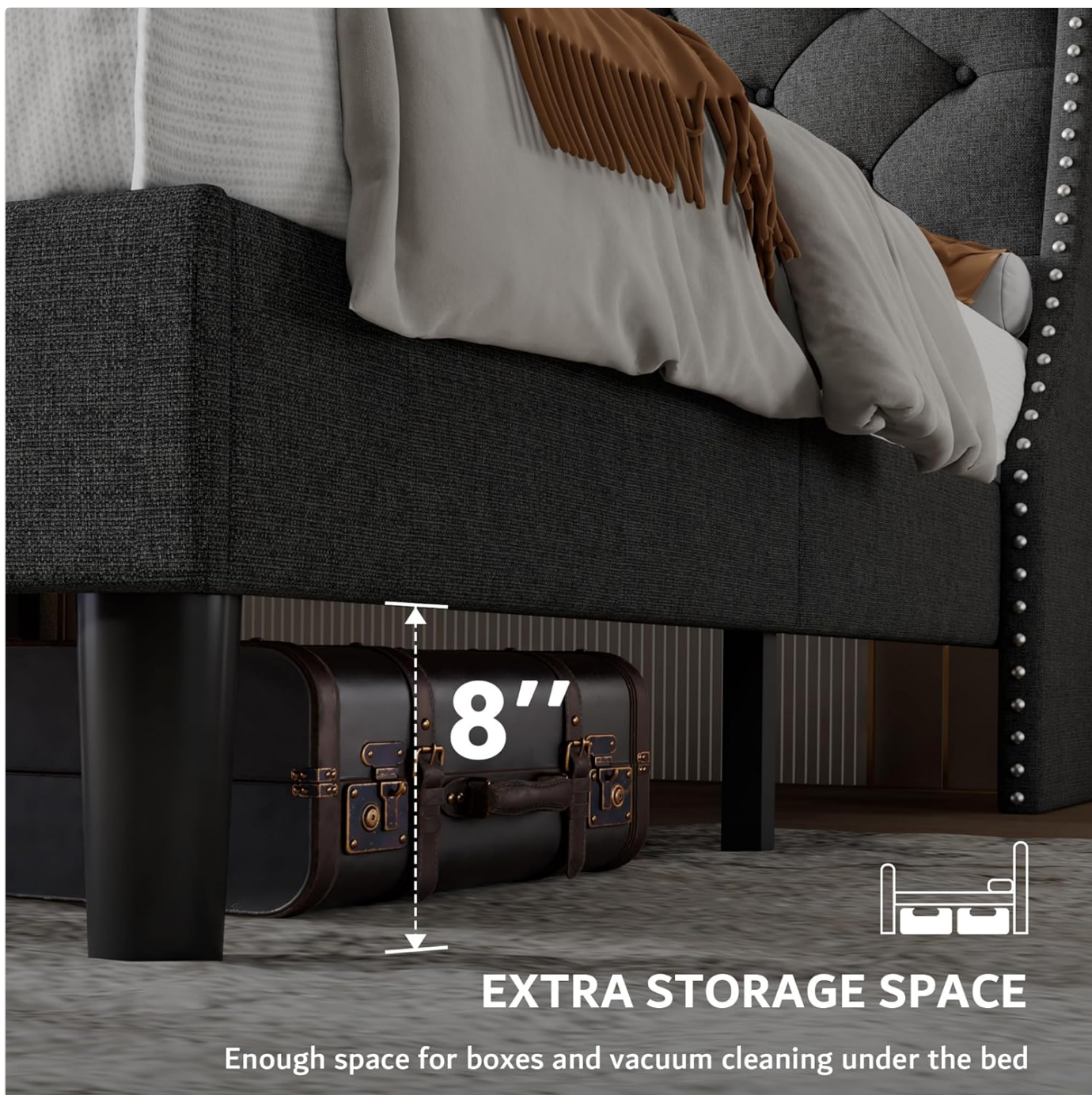
Figure 5.2: Illustration of the 8-inch under-bed clearance, suitable for storage or cleaning.