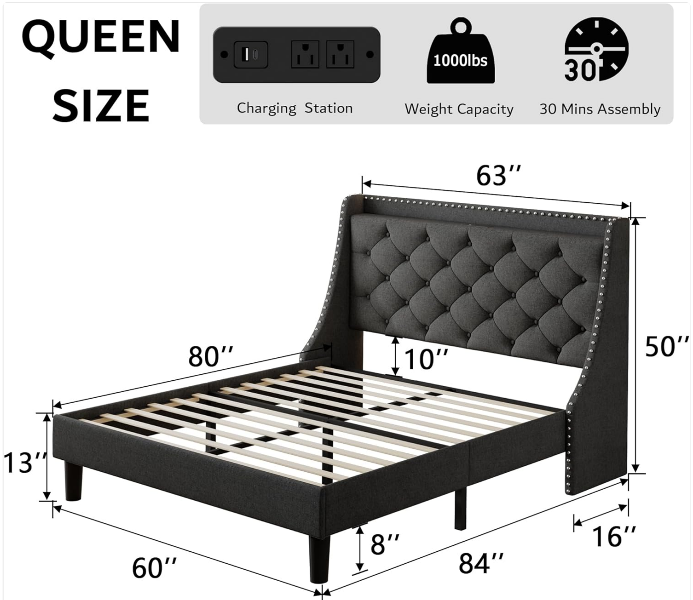
Figure 4.2: Overall dimensions of the Queen bed frame, illustrating the structure that supports the slats.

Unroll or place the wood slats (G) across the bed frame. The slats are designed with velcro strips to prevent shifting and reduce noise. Ensure each slat is properly seated and secured to the side rails.