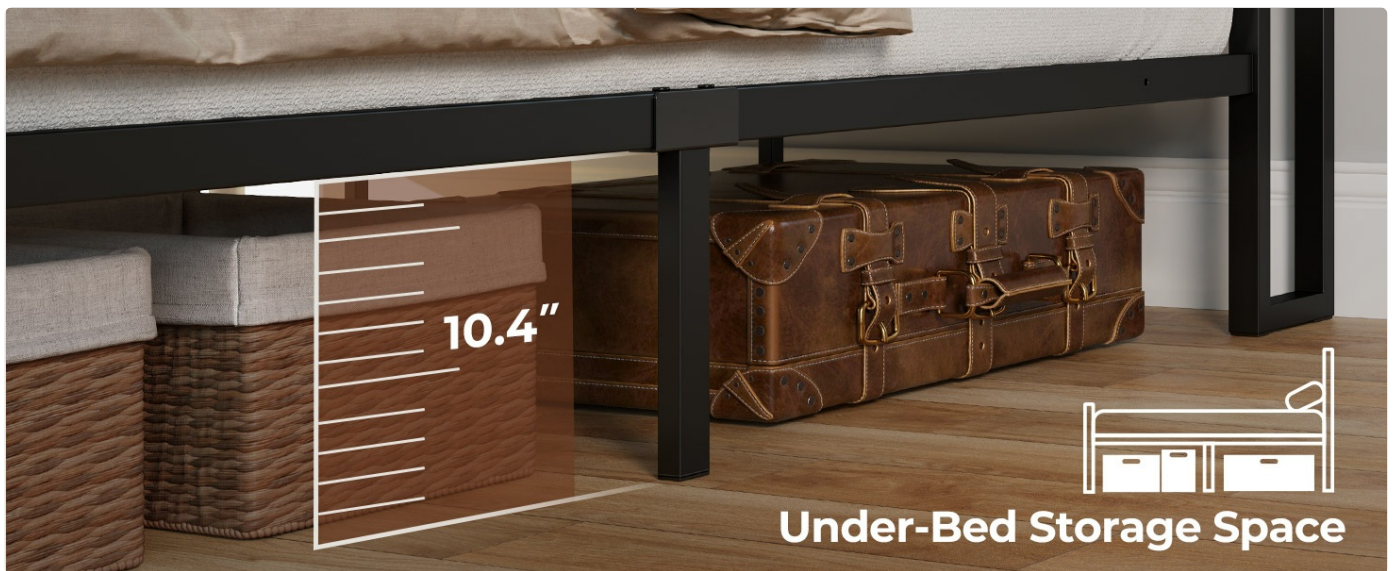
Image: Example of under-bed storage space utilized with baskets and luggage.