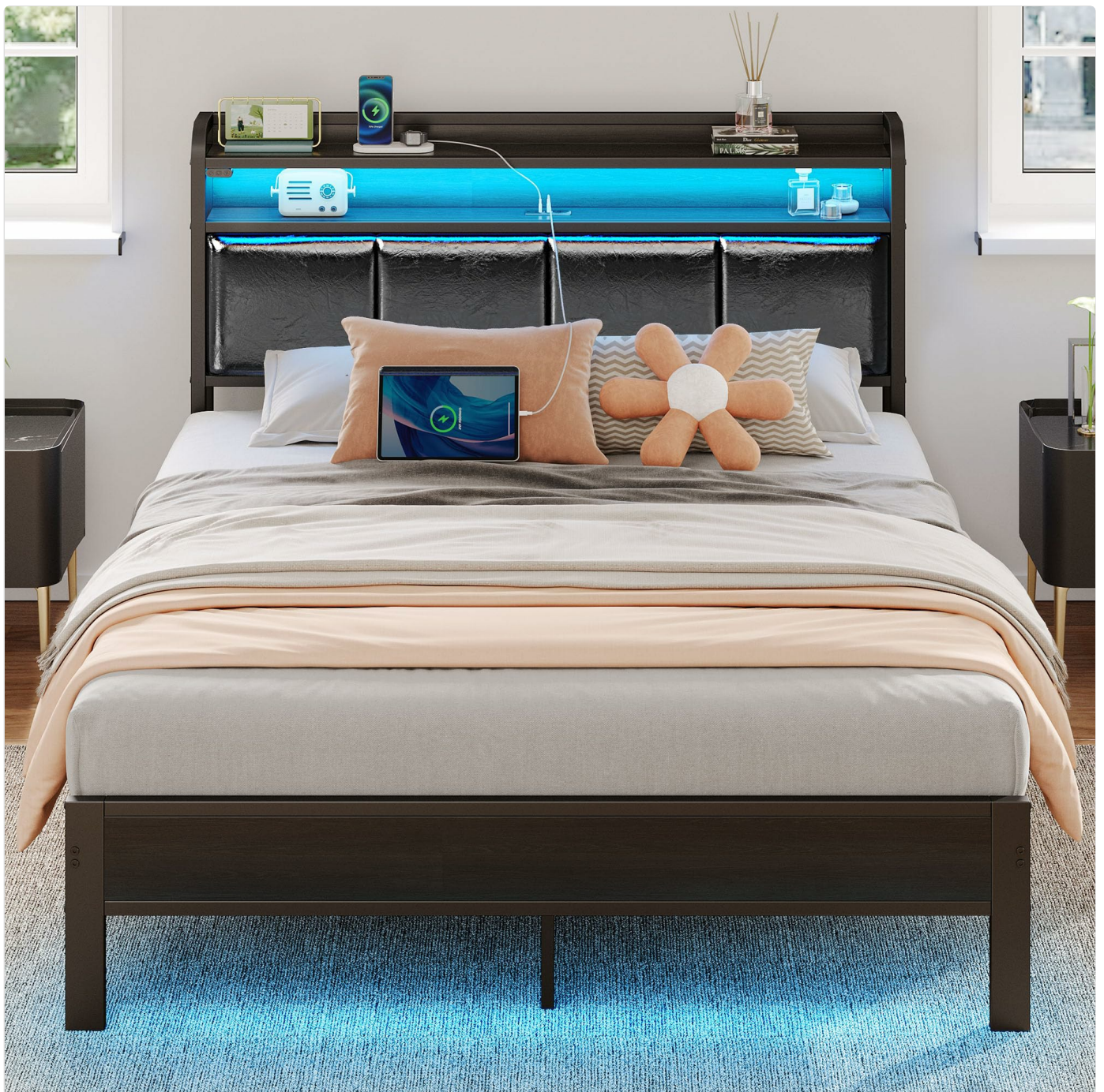
Image: The Rolanstar Full Size Bed Frame, showcasing its integrated LED lighting, headboard storage, and charging station.