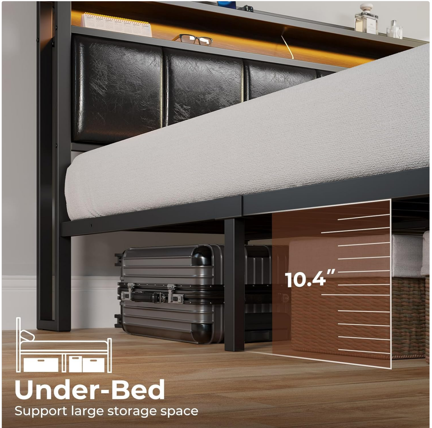
Image: A visual representation of the 10.4-inch under-bed clearance, ideal for storing various items.