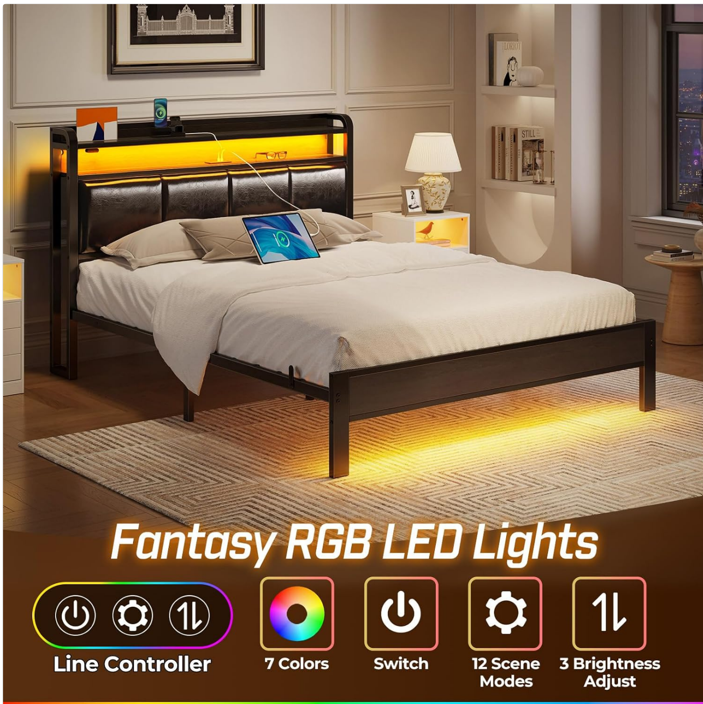
Image: Overview of the RGB LED lights and the functions of the line controller (Power, 7 Colors, Switch, 12 Scene Modes, 3 Brightness Adjust).