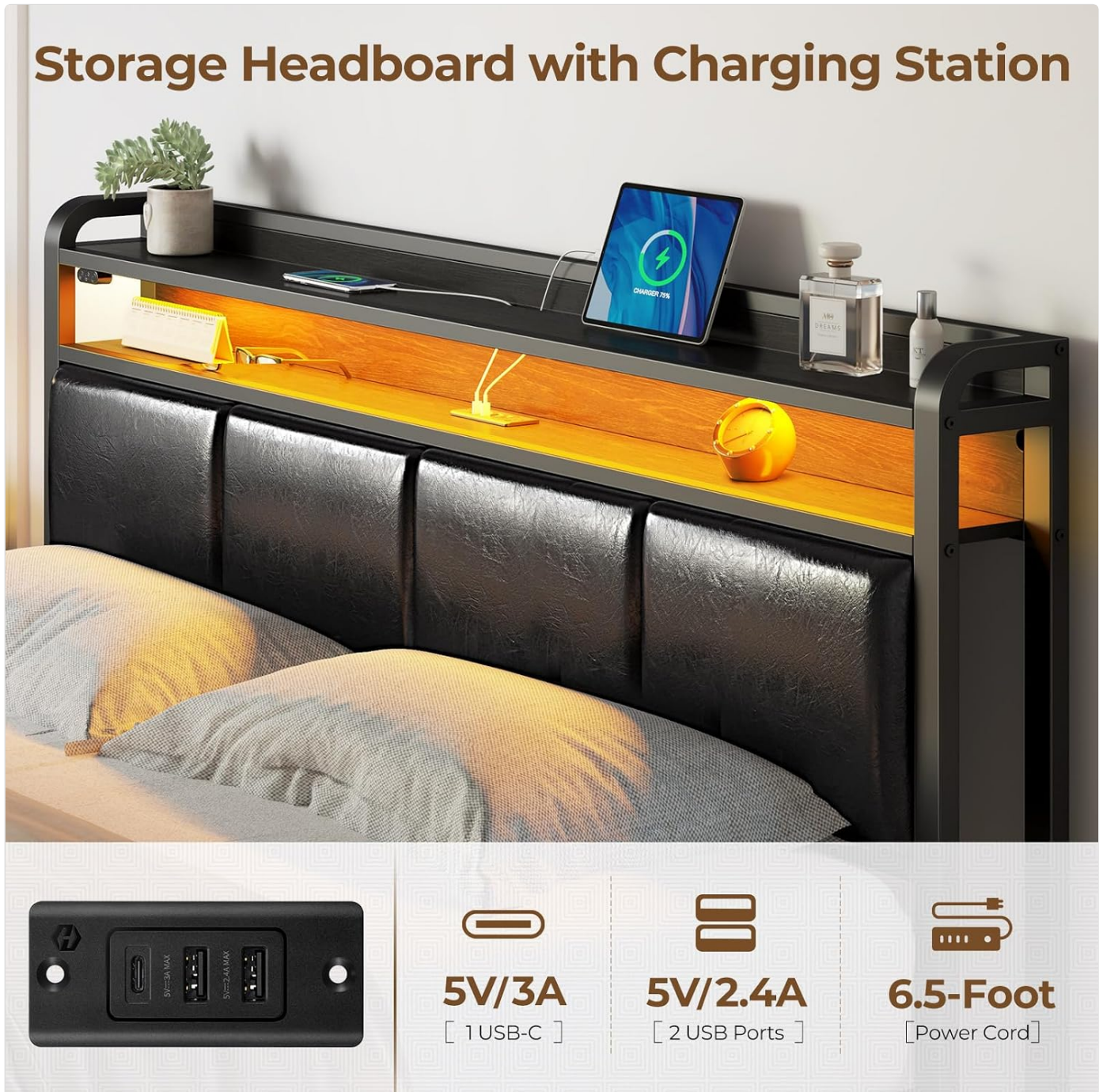
Image: The headboard featuring a 2-tier storage shelf and the integrated charging station with USB and USB-C ports.