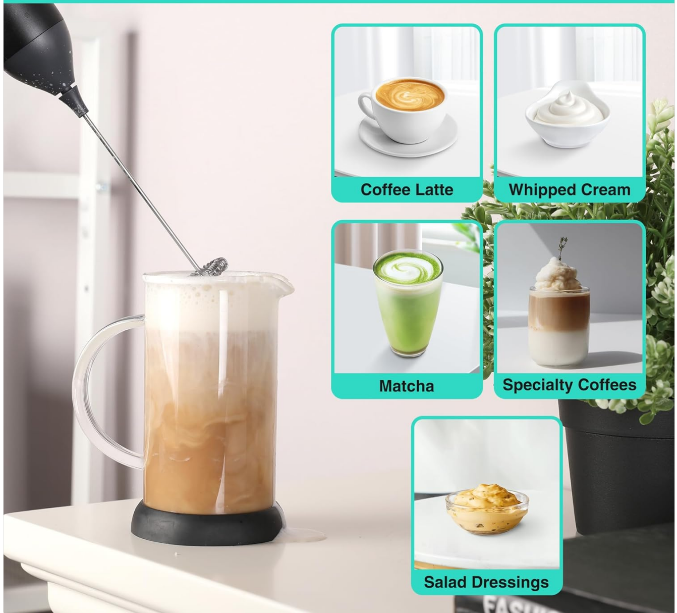
Figure 1: HAUSHOF Milk Frother with labeled components.