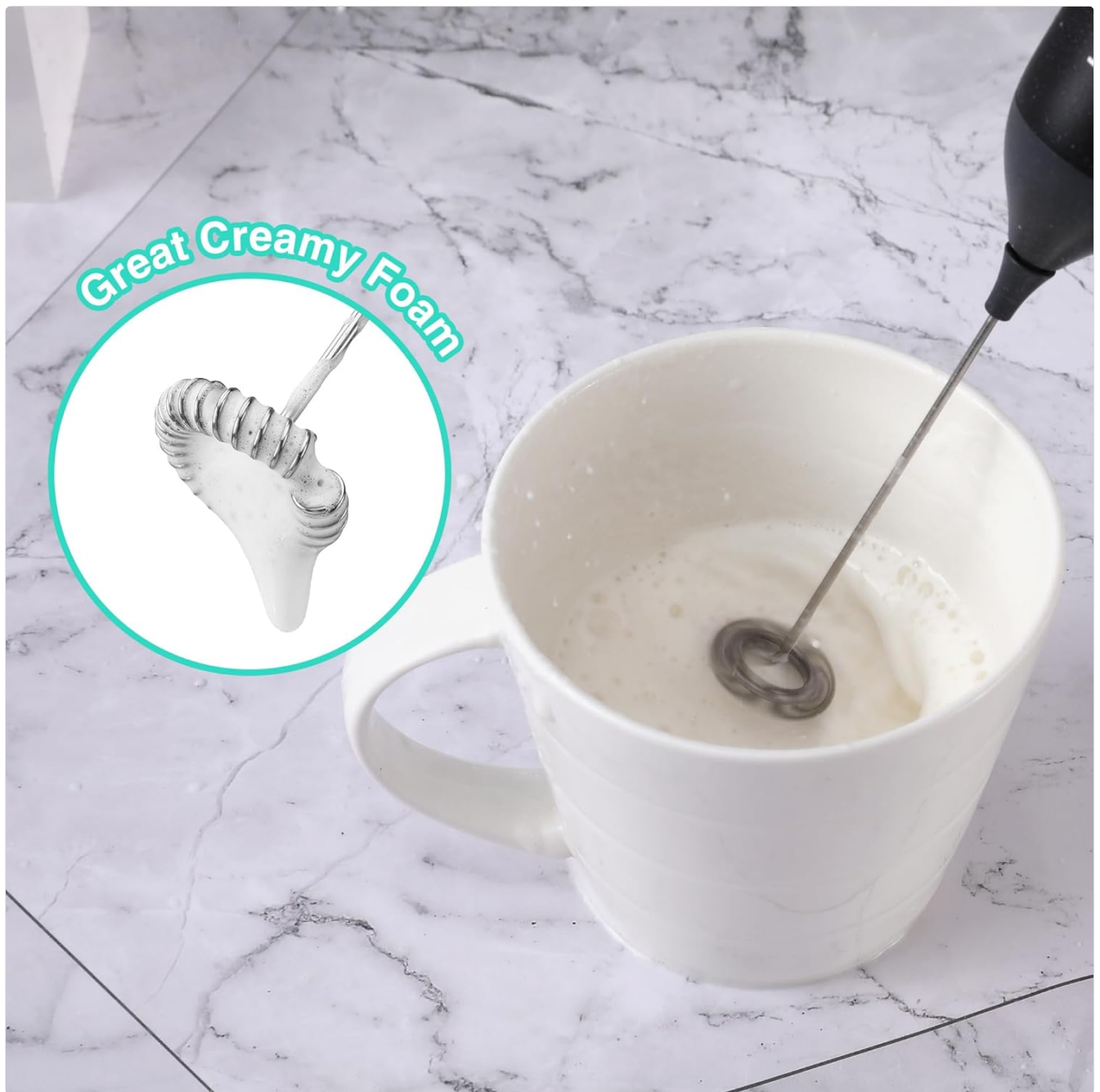
Figure 3: Frothing milk with the HAUSHOF Milk Frother.