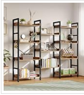
Figure 3: Bolt-Free Quick-Insert Assembly System.