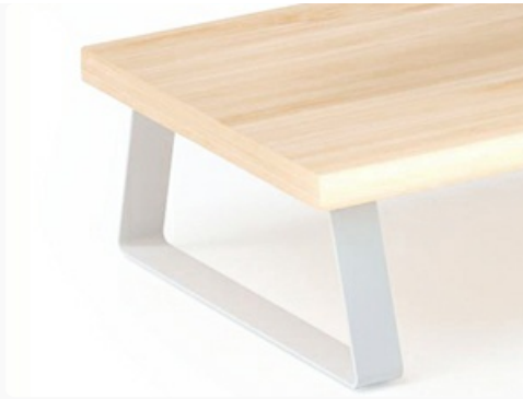
Image: A close-up of the sturdy metal legs, emphasizing the robust support structure of the monitor stand.