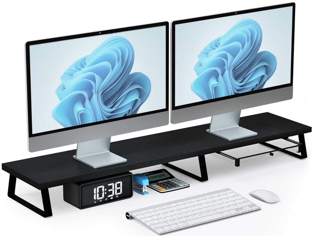
Image: The Roslim Wood Dual Monitor Stand Riser in black, featuring a sleek design with space for two monitors and a laptop, enhancing desk organization.

Your browser does not support the video tag.