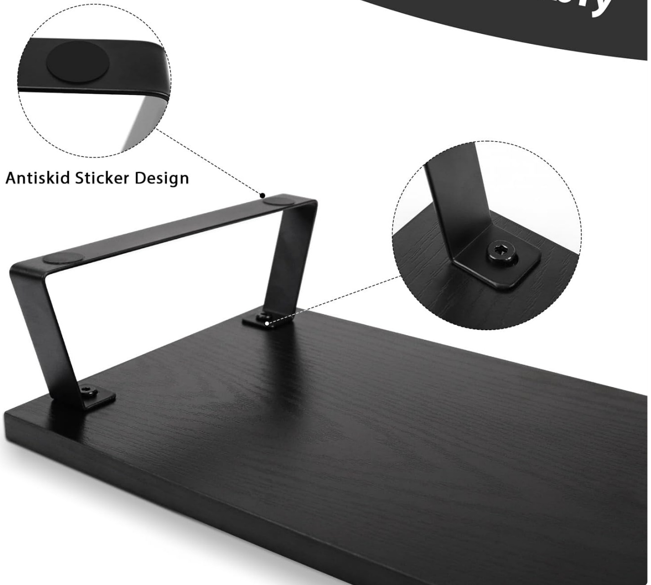
Image: A close-up view illustrating the easy assembly of the monitor stand, highlighting the attachment of metal legs and the anti-skid sticker design for stability.