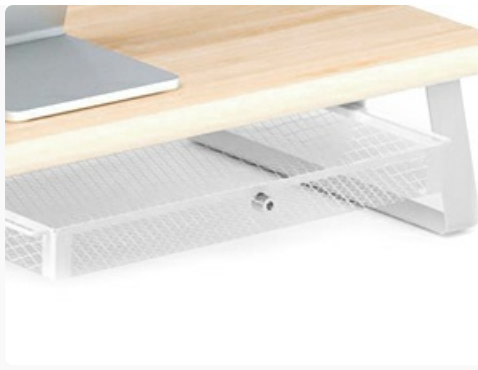
Image: A close-up of the convenient pull-out mesh drawer, ideal for storing small office supplies and keeping the desk organized.