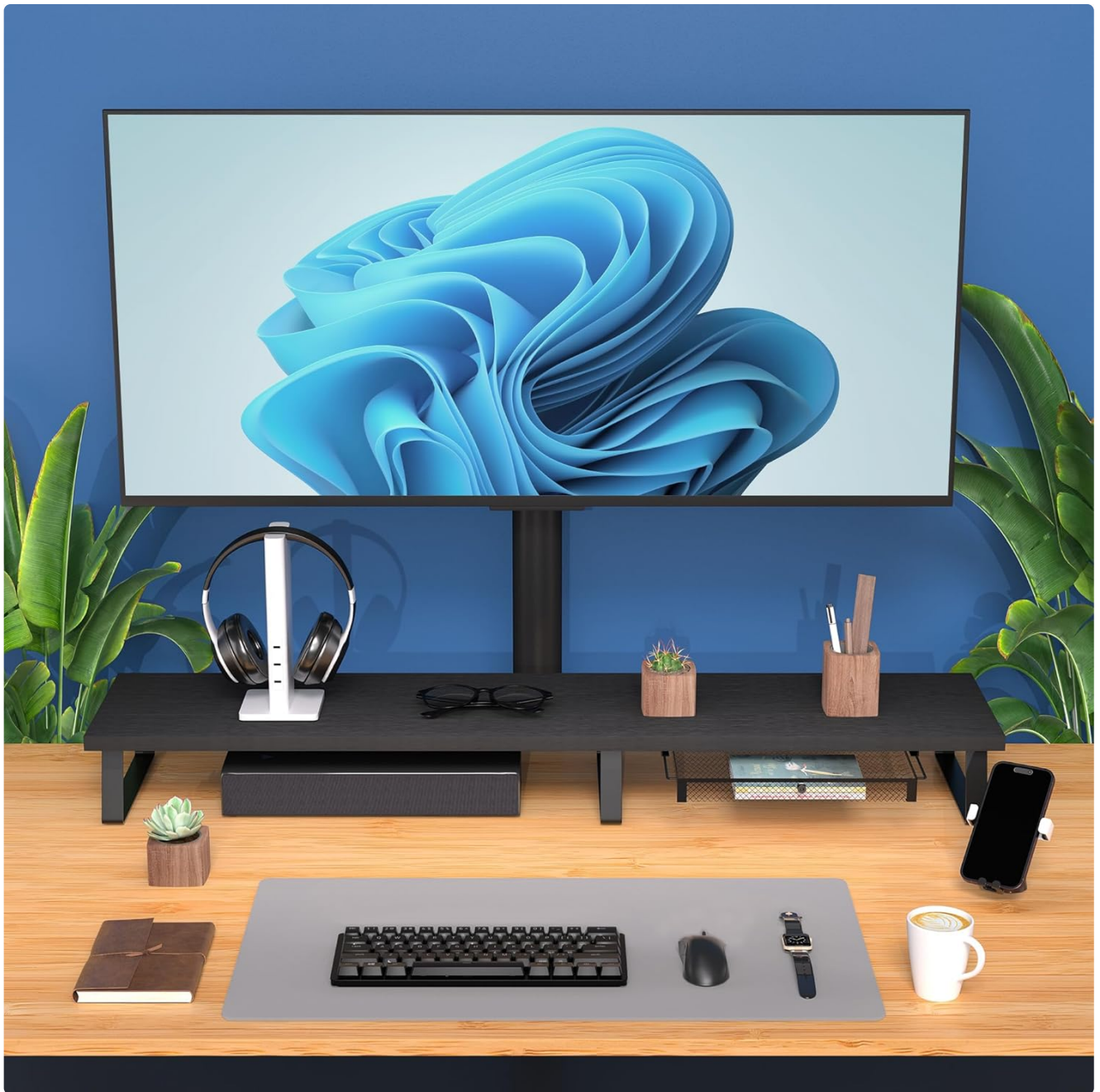
Image: The monitor stand used with a single monitor, demonstrating ample space for additional desk accessories.