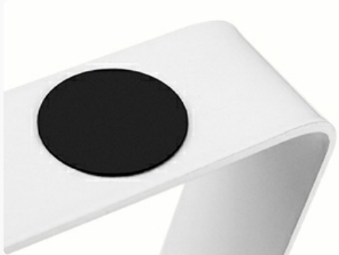
Image: A detailed view of the anti-slip rubber pads on the bottom of the stand's legs, designed to prevent movement and protect surfaces.

Your browser does not support the video tag.