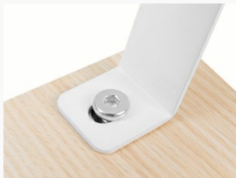
Image: Detailed view of the monitor stand's easy assembly, showing how the metal legs are secured to the wooden platform.