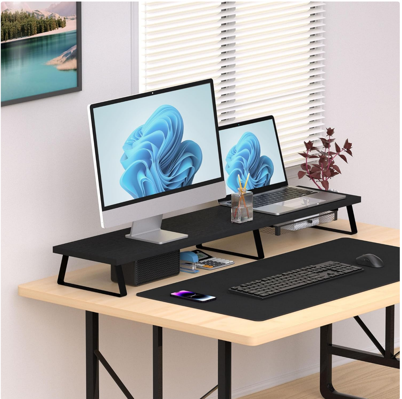
Image: A typical office setup showing the monitor stand supporting two monitors and a laptop, illustrating its practical application.