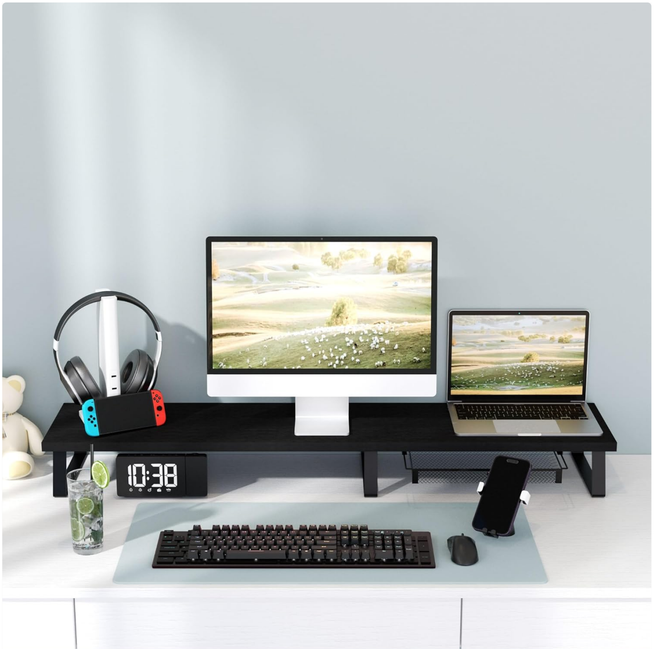
Image: The monitor stand configured for a dual monitor setup, including a laptop, showcasing its adaptability for various workstation needs.