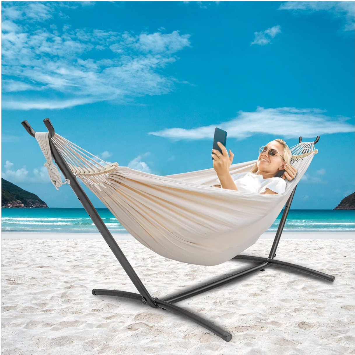
Figure 3.2: The fully assembled SZHLUX Double Hammock with its sturdy steel stand.