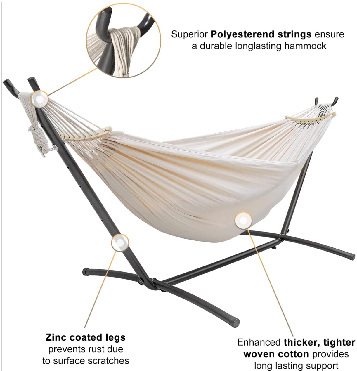
Figure 4.2: Close-up view highlighting the superior polyester end strings, zinc-coated legs, and enhanced thicker, tighter woven cotton of the hammock.