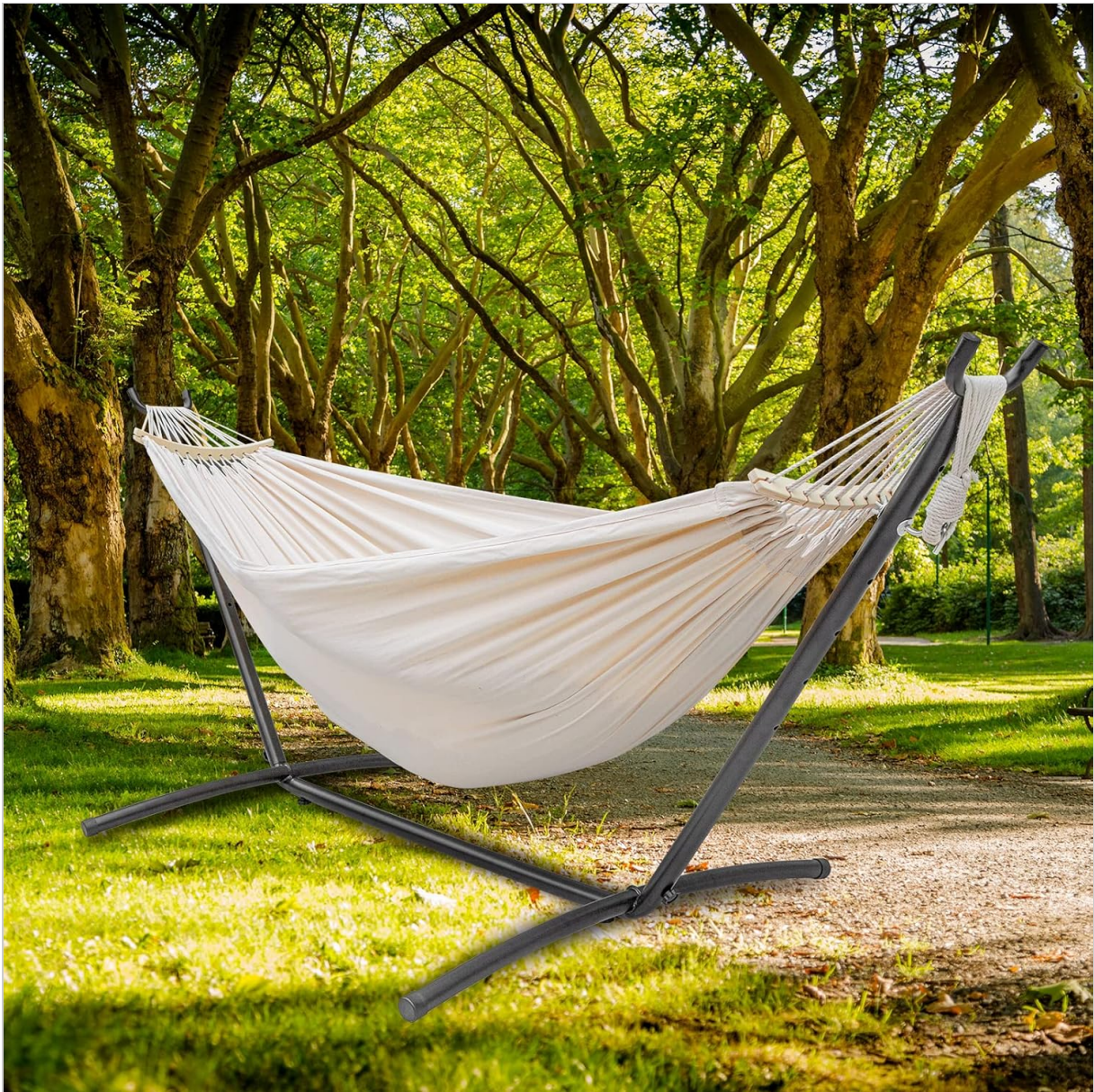
Figure 4.1: The SZHLUX Double Hammock providing a comfortable spot for relaxation in a garden setting.