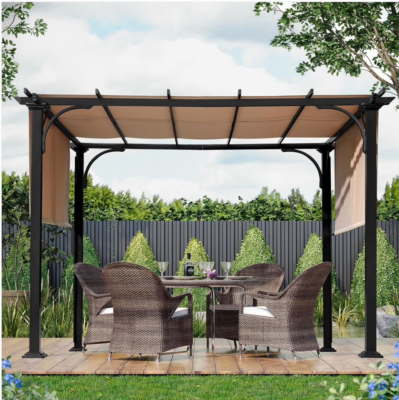
Image: The GAZEBEST Patio Pergola providing shade over an outdoor dining set in a backyard. This demonstrates the pergola's utility as a shelter for social gatherings.