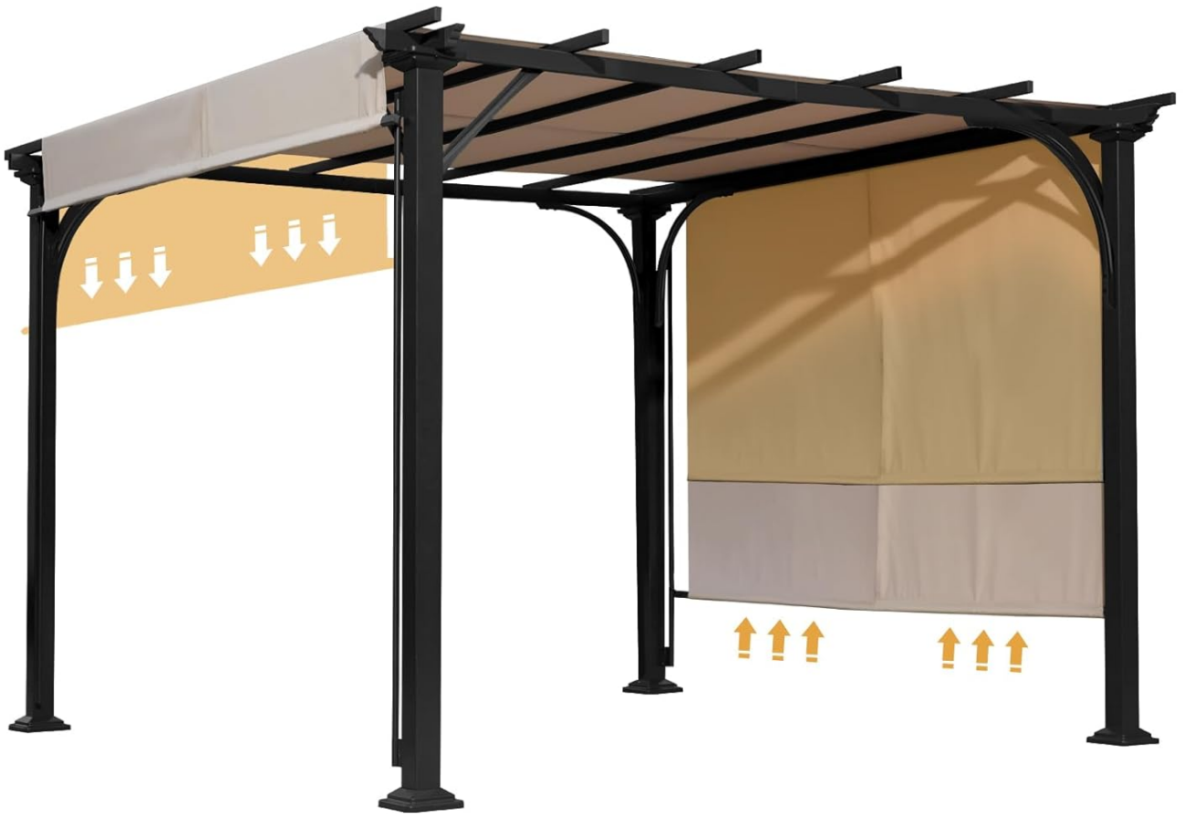
Image: A diagram illustrating the movement of the retractable canopy, showing how sections can be extended or retracted along the frame to adjust shade coverage.