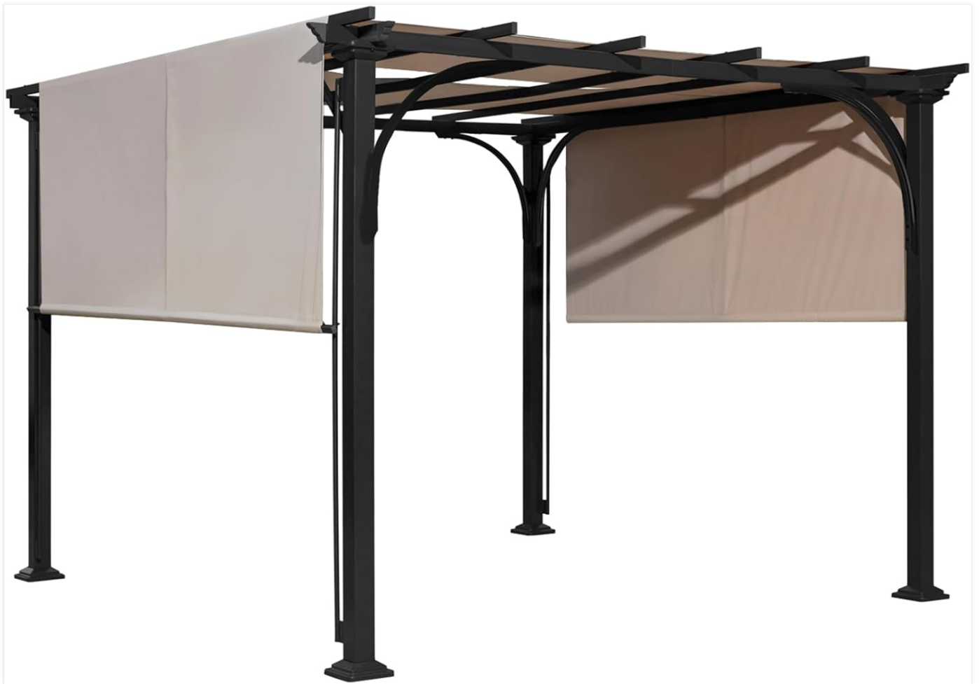
Image: A full perspective view of the GAZEBEST Patio Pergola structure, showcasing its overall design and the retractable canopy in a partially extended position.