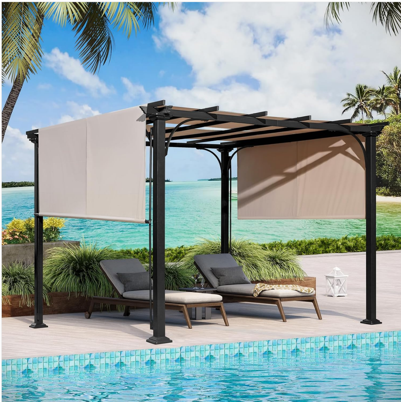
Image: The GAZEBEST Patio Pergola with its retractable canopy extended, situated next to a swimming pool. This image illustrates the product in a typical outdoor leisure setting.