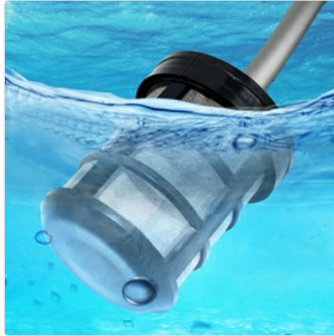
Figure 6.1: The water suction filter helps protect the pump from impurities.