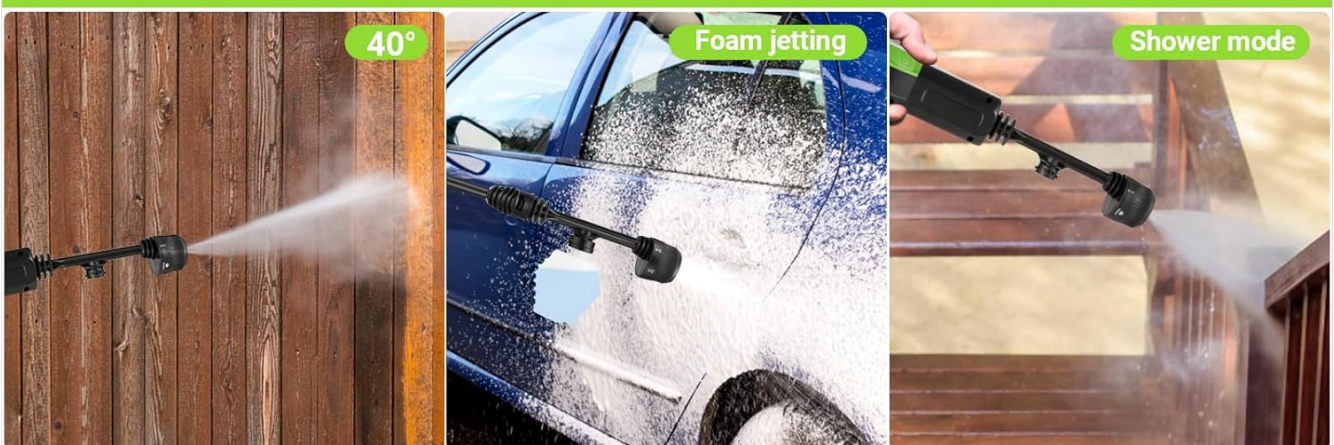
Figure 3.2: The 6-in-1 multi-function nozzle offers various spray patterns for different cleaning needs.