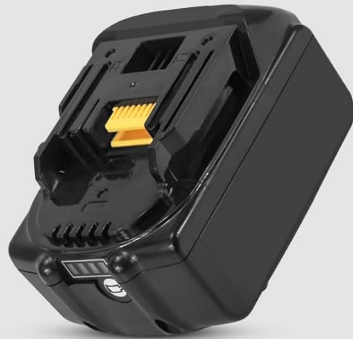
Figure 3.3: The 40V battery provides robust power for the pressure washer.