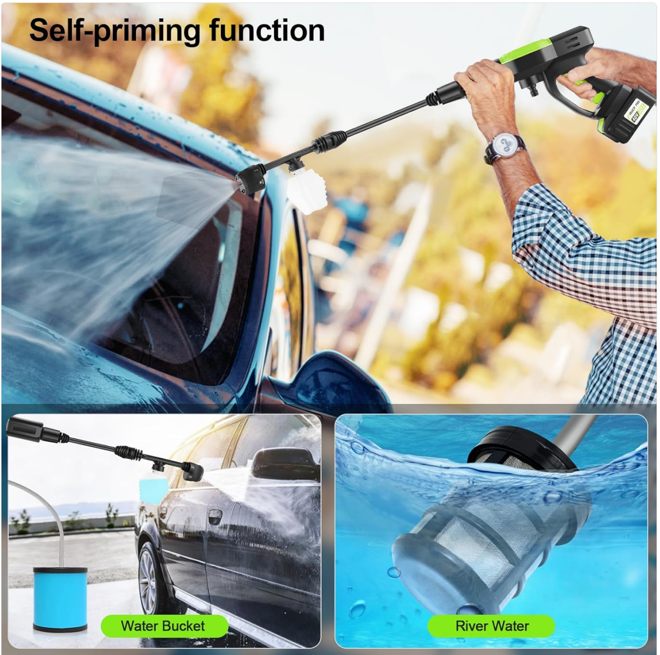
Figure 4.3: The self-priming function allows for versatile water sourcing, such as from a water bucket.