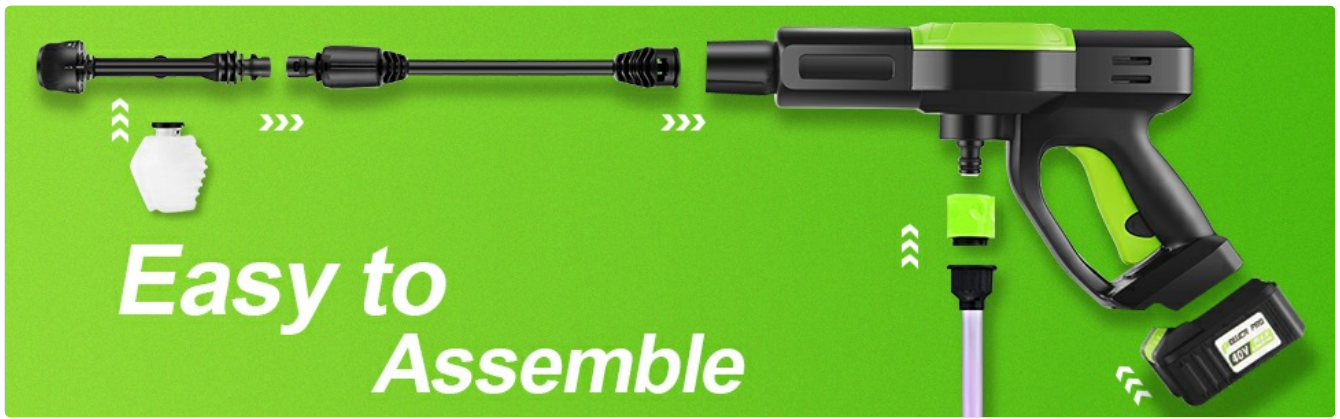
Figure 4.1: The pressure washer is designed for quick and easy assembly.