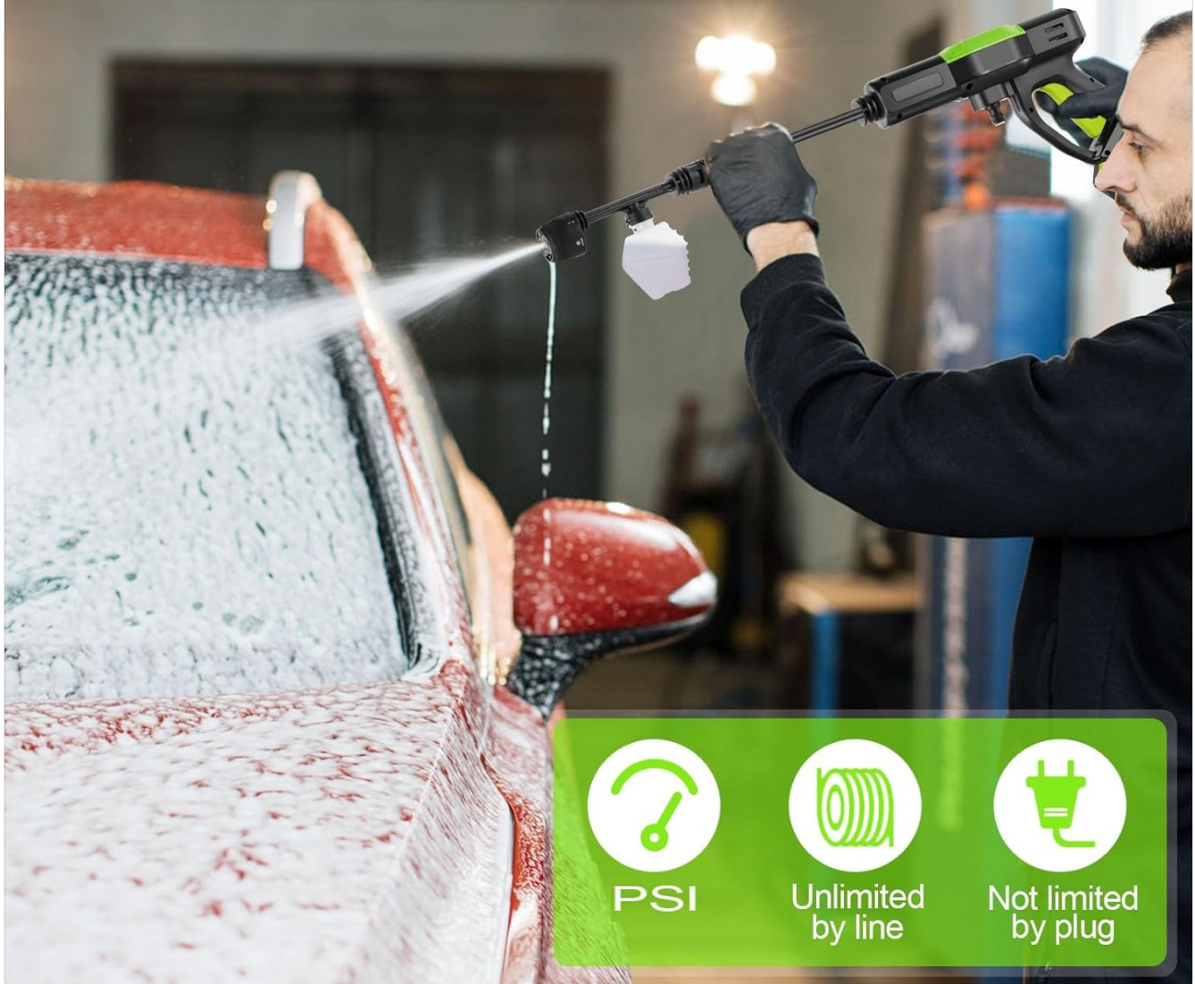
Figure 5.3: The cordless design allows for unrestricted car washing.