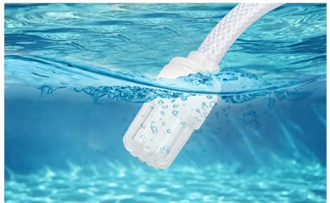
Figure 4.2: The pressure washer can draw water from a faucet or a static water source.