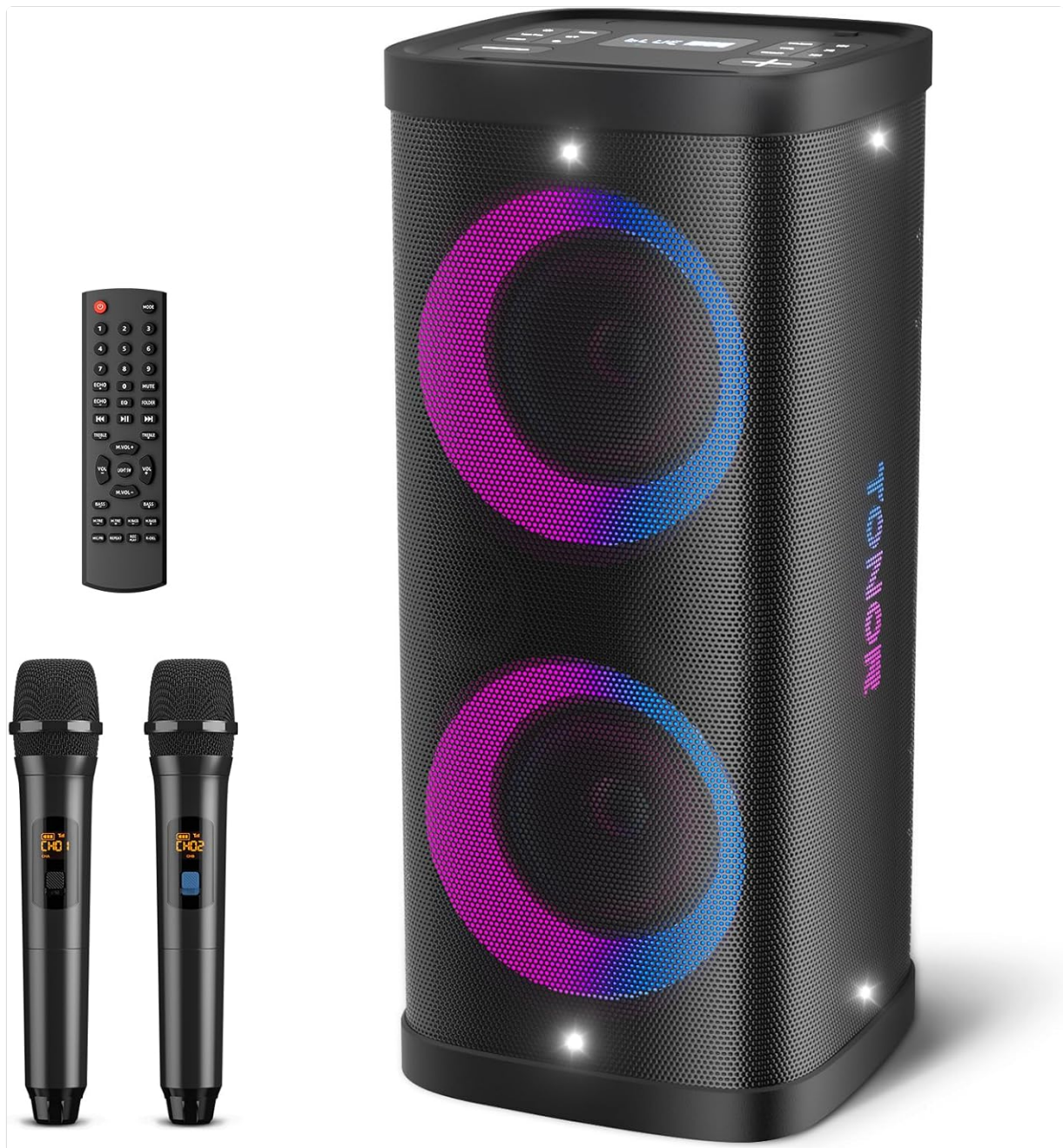
Figure 1: TONOR K61 Karaoke Machine with included wireless microphones and remote control.