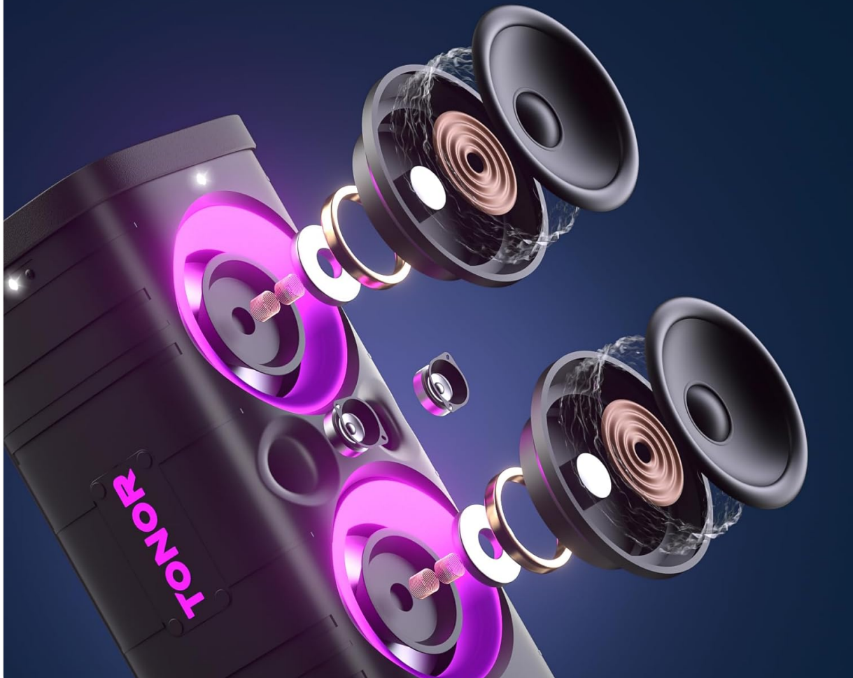
Figure 5: Examples of the dynamic light effects available on the TONOR K61.