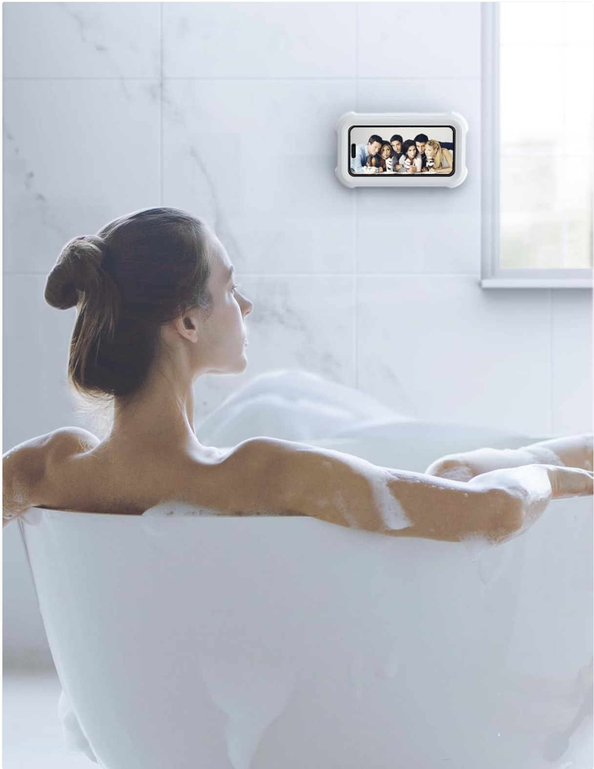
Image 4.2: The case demonstrating compatibility with various smartphone models, suitable for 4-7 inch devices.