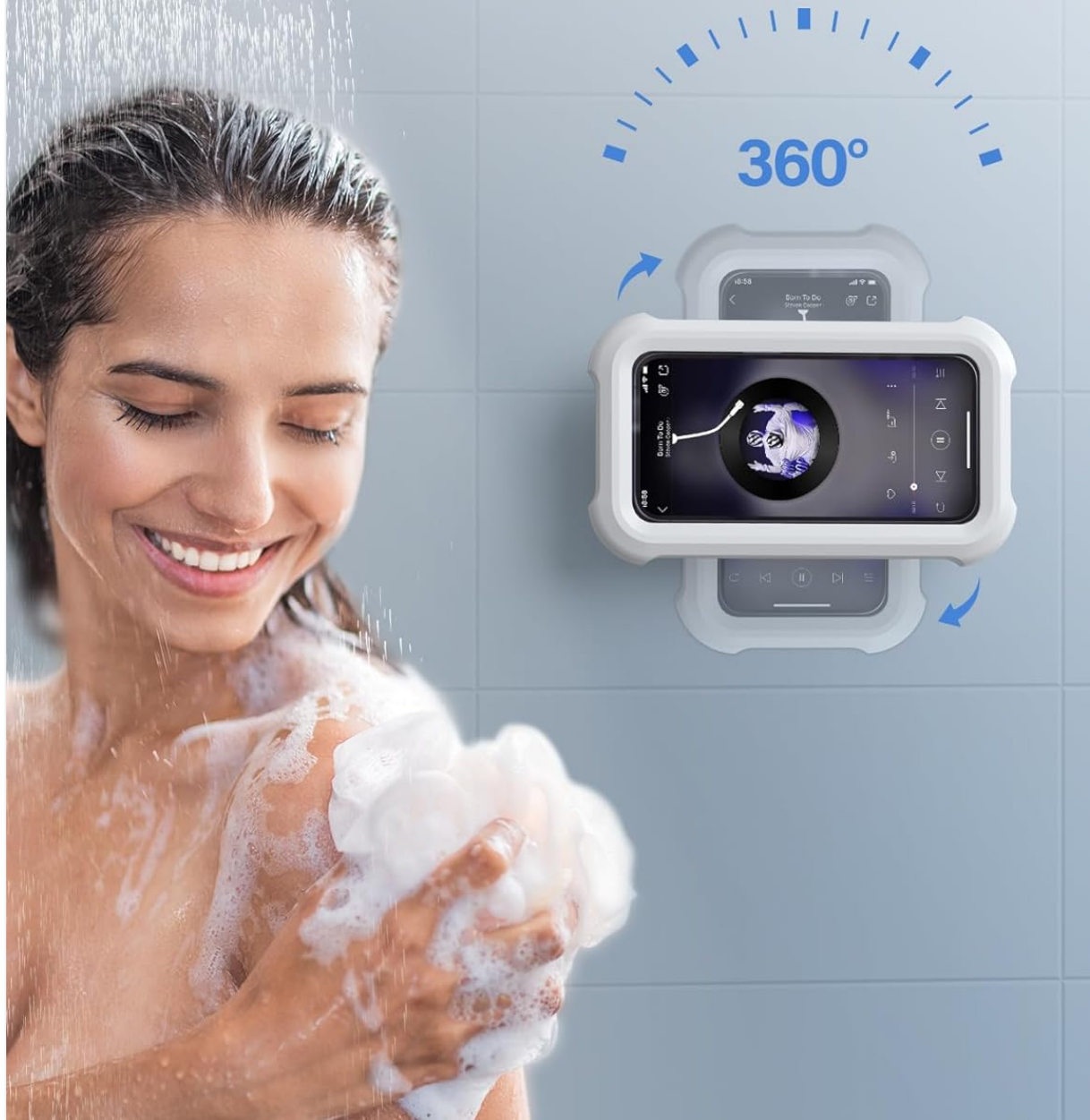
Image 1.1: The Lamicall Waterproof Phone Case mounted on a shower wall, demonstrating its 360-degree rotation capability.