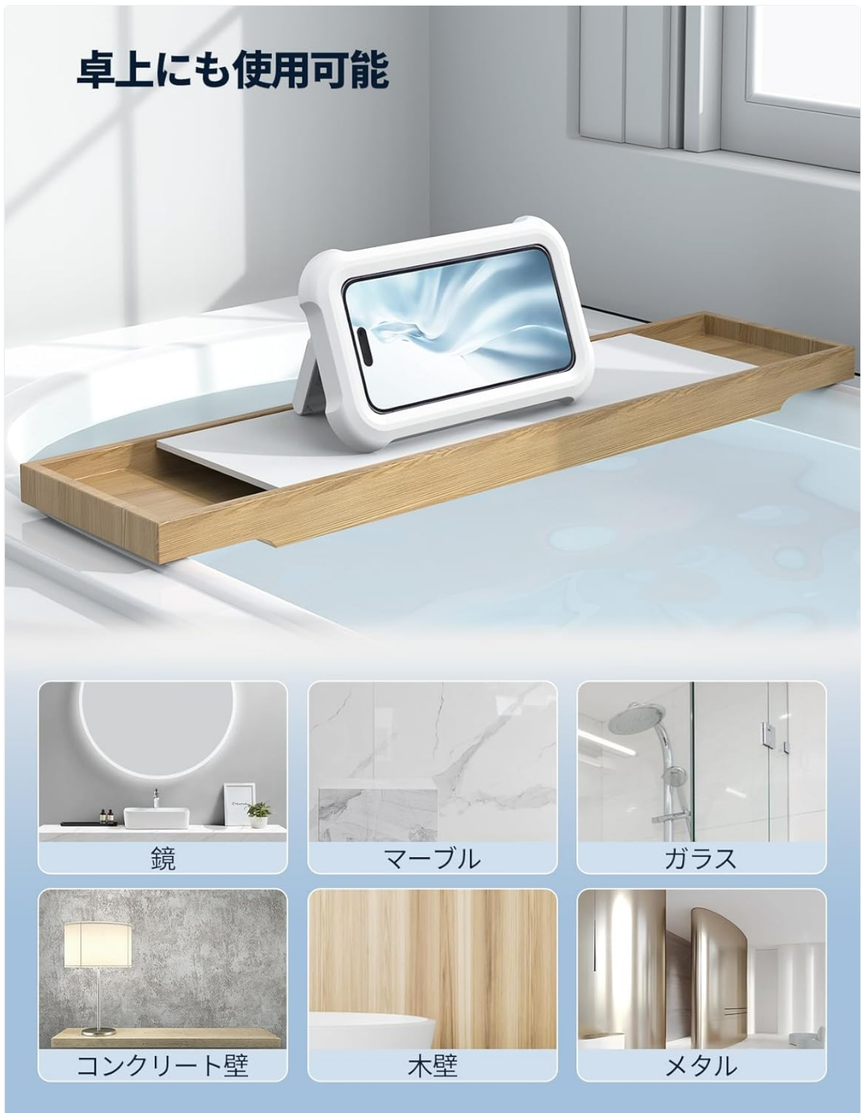
Image 4.3: The phone case positioned on a bath tray, demonstrating its versatility for desktop use.