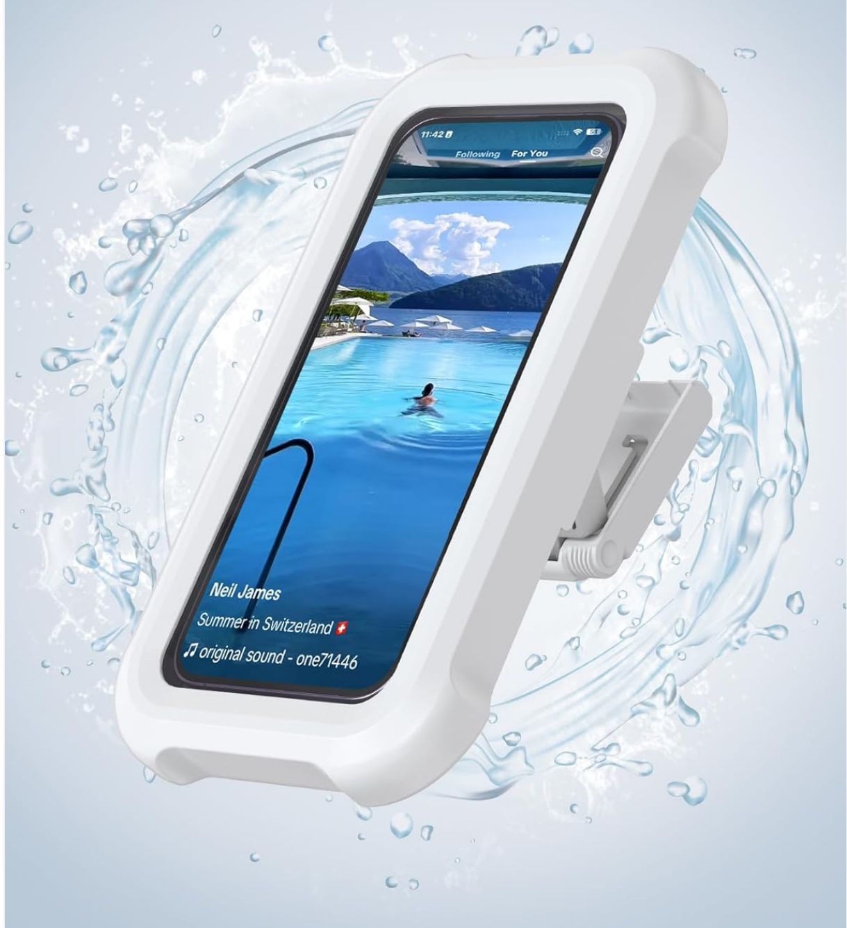
Image 2.1: The case demonstrating its IPX6 waterproof rating against splashing water. Note: Do not use underwater.